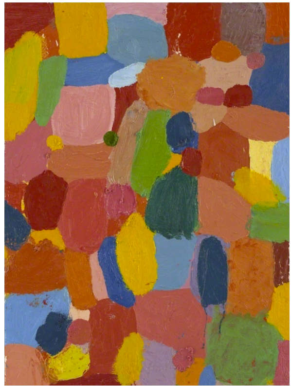
Damien Hirst Smile Smile , 1993-1995 Blain | Southern

1. “ Yu-ichi Inoue ” at Tomio Koyama, Tokyo. Coming in at the top spot, this show featured 10 works by Yu-ichi that had previously been exhibited at the 11th Sharjah Biennial. Often seen as Japan’s answer to Abstract Expressionism, the painter made a controversial name for himself on his rejection of traditional modes of calligraphy. Since his death in 1985, his reputation has only continued to climb.