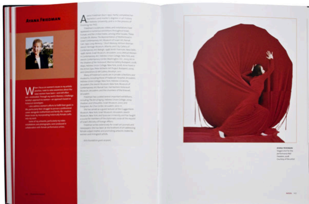
The spread from the book / photo: Ayana Friedman, Staged shot for the performance 'Red Freedom', 2008 / Photo of the spread by Islamic Arts Magazine

The authors in this volume address multi-nationalism and the interaction of Middle East countries with Euro-American cultures, resulting in U.S. and European relationships that are sometimes congenial and at other times problematic. The book also addresses the Middle East's cultural diaspora in black Africa and South Asia. But above all, the book addresses the political and theoretical issues that inform the work of these artists.