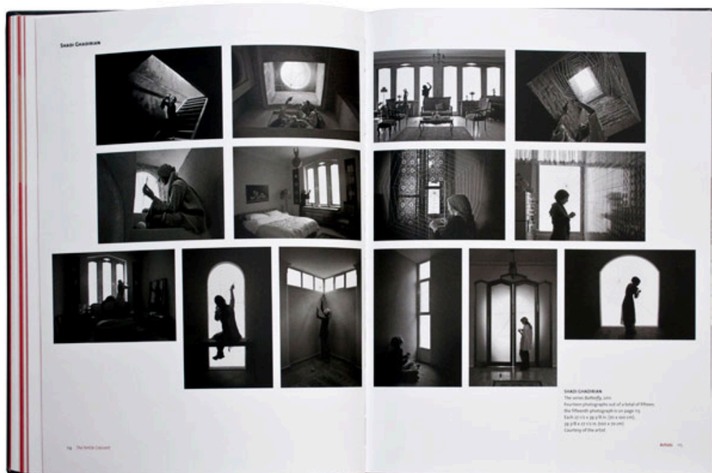
The spread from the book / photo: Shadi Ghadirian, The series 'Butterfly', 2011

The core Fertile Crescent artists are: Shiva Ahmadi (Iranian), Negar Ahkami (American/Iranian), Jananne Al-Ani (Iraqi), Ghada Amer (Egyptian/American) and Reza Farkhondeh and (Iranian), Fatima Al Qadiri (Kuwaiti), Monira Al Qadiri (Kuwaiti), Zeina Barakeh (Lebanese/Palestinian), Ofri Cnaani (Israeli), Nezaket Ekici (Turkish), Diana El Jeiroudi, (Syrian), Parastou Forouhar (Iranian), Ayana Friedman (Israeli), Shadi Ghadirian (Iranian), Mona Hatoum (Palestinian), Hayv Kahraman (Iraqi), Efrat Kedem (Israeli), Sigalit Landau (Israeli), Ariane Littman (Swiss/Israeli), Shirin Neshat (Iranian), Ebru Özseçen (Turkish), Laila Shawa (Palestinian), Shahzia Sikander (Pakistani), Fatimah Tuggar (Nigerian), Nil Yalter (French/Turkish).