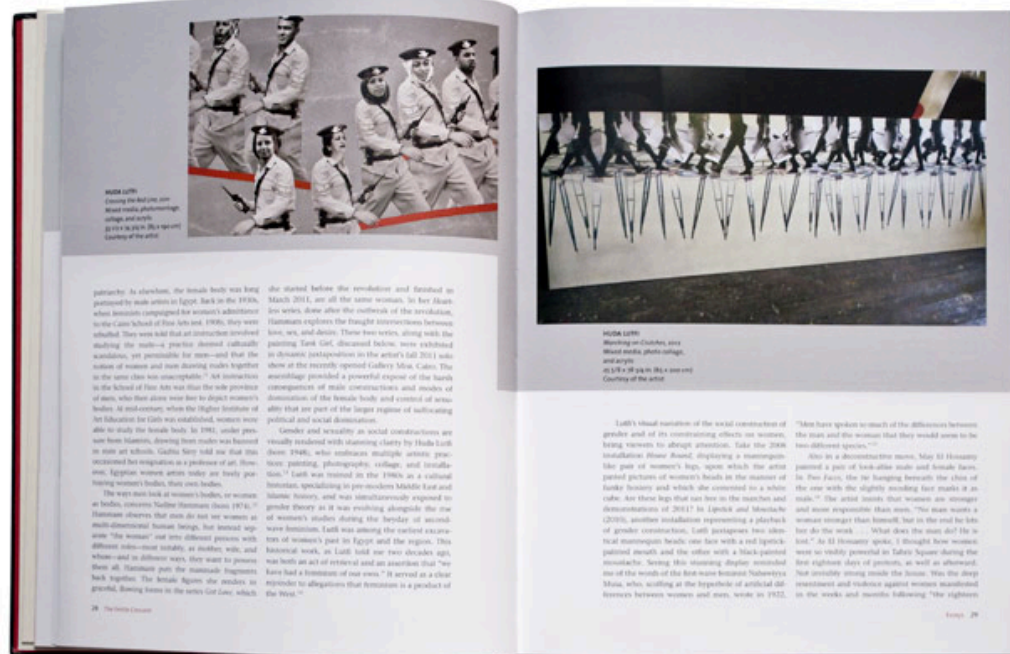
The spread from the book / photo on the left side: Huda Lufti, Crossing the Red Line , 2011 / photo on the right side: Huda Lufti, Marching on Crutches , 2012

Through painting, photography, performance art, multi-media, sculpture, and film, the artists deconstruct stereotypes of Middle East women, challenging the commonly held Western view of Middle East women as oppressed, the sexual objects of men, with their bodies hidden under veils, while acknowledging existing social and theological restrictions that have caused many of them to leave their homelands. The work is political, but goes beyond immediate confrontations to present a collective view of this region of the world that is nuanced, thought provoking and illuminating.