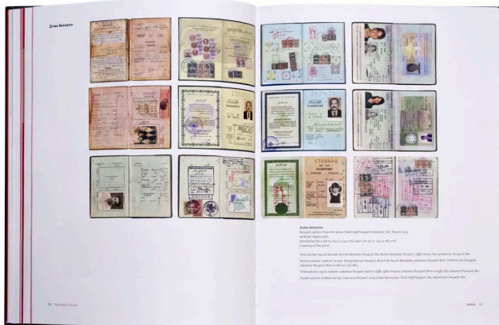
The spread from the book / photo: Zeina Barakeh, Passport details from the series Third-Half Passport Collection: M.E.Transit, 2012