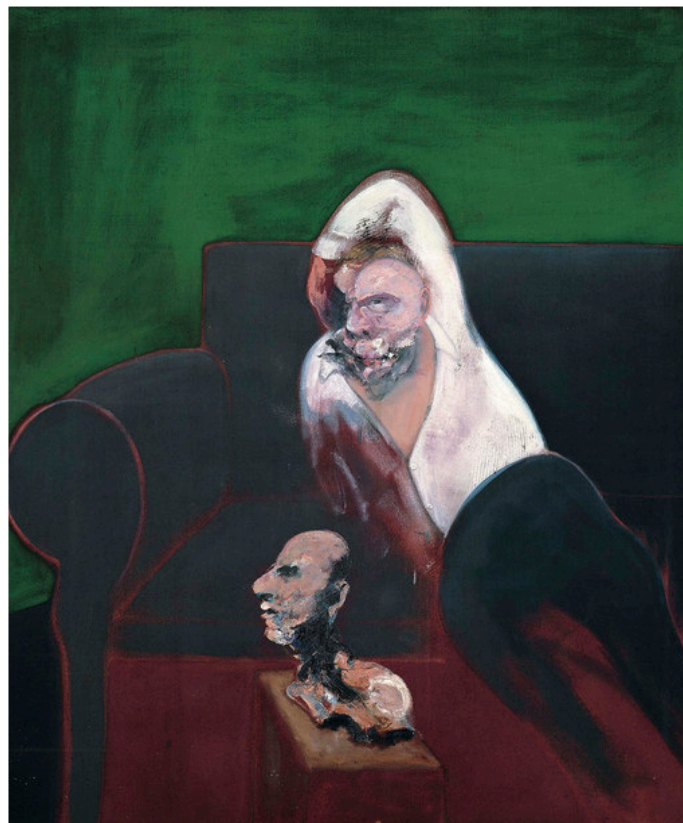
Francis Bacon, Reclining Man with Sculpture , 1961

If the full show does make its way to, say, Paris, the pieces could be re-united with the woman who acquired them. “Of course, if the collection comes outside of Iran, I might go and see it,” the empress said.