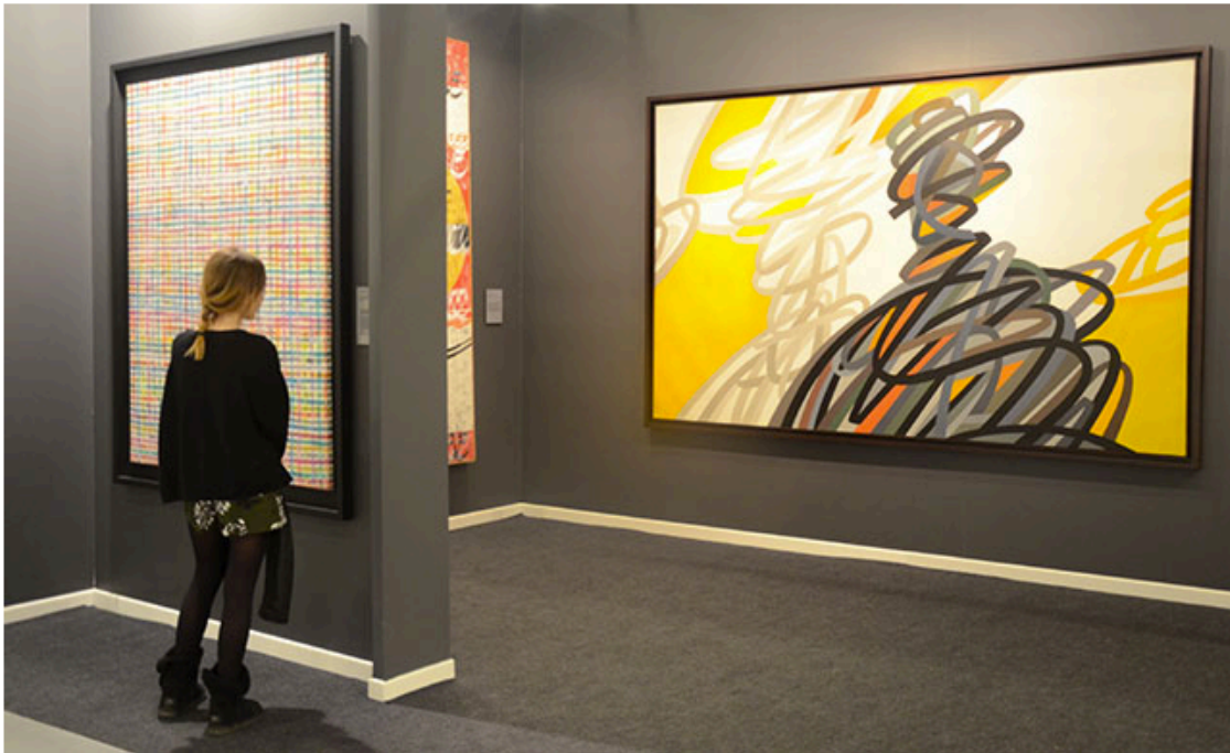
INSTALLATION VIEW OF CONTEMPORARY ISTANBUL 2015.