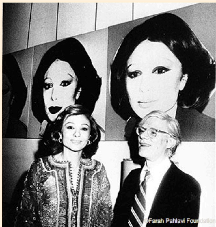
Farah Pahlavi, former empress of Iran, with Andy Warhol, c1976