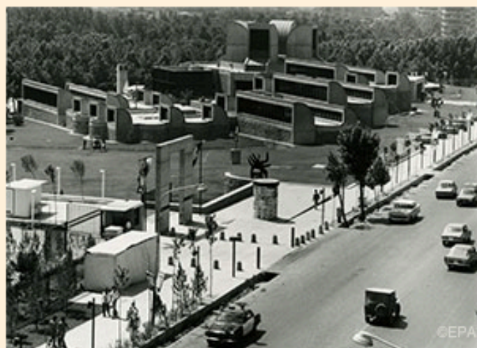
The museum in 1978

At the opening of TMoCA in 1977 Diba made an impassioned speech which included the line, "This Museum must be like a bulldozer . . . to clear the way for more open and adventurous artistic values." Sadly, barely two years later, Diba was in exile in Paris and the museum's collection placed in storage.