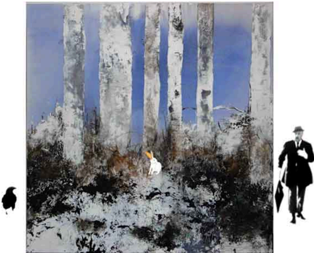
Farideh Lashai, I Come from the Land of Ideology (2010).

The later work tends towards Surrealism, which is probably understandable given that by the early 2000s Lashai was battling cancer and facing her mortality, but much more importantly because Surrealism so neatly combined and encompassed her lifelong passion for literature, poetry, and art. Personal issues and concerns once again tend to be a determining influence on the imagery, suggesting an introspective artist who made art and wrote literature primarily as a means of personal expression and not really as social or political commentary. To encounter her work is to enter her life and mind.