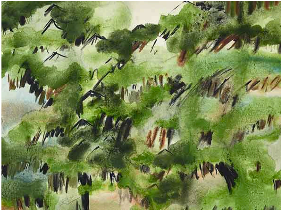
Farideh Lashai, Untitled (1977).