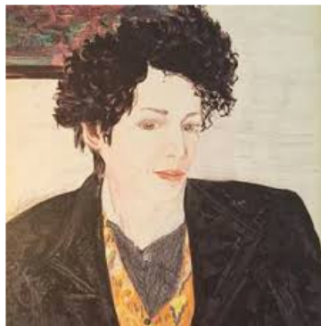
Farideh Lashai, Self Portrait , 1986

Lashai returns to realism at various times seemingly influenced by the vicissitudes of events in her life. I don't know enough about her life or Iranian history to match up specific works to actual events, but a bold, even rather severe self-portrait from 1986 suggests a moment of intense self-reflection but also self-identification as an artist and social outsider. The artist depicts herself looking straight at the viewer, her face sad, thoughtful, and defiant with one of her earlier paintings visible in the background. She occupies most of the frame and comes across as a strong personality, a force to be reckoned with.