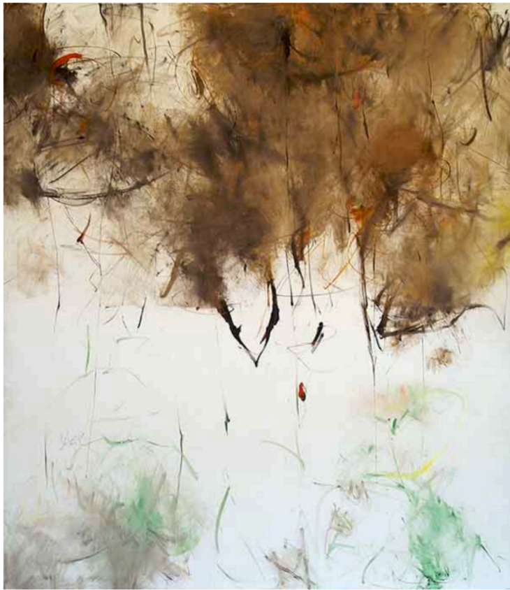
Farideh Lashai, Untitled (2008).

Lashai returns to realism at various times seemingly influenced by the vicissitudes of events in her life. I don't know enough about her life or Iranian history to match up specific works to actual events, but a bold, even rather severe self-portrait from 1986 suggests a moment of intense self-reflection but also self-identification as an artist and social outsider. The artist depicts herself looking straight at the viewer, her face sad, thoughtful, and defiant with one of her earlier paintings visible in the background. She occupies most of the frame and comes across as a strong personality, a force to be reckoned with.