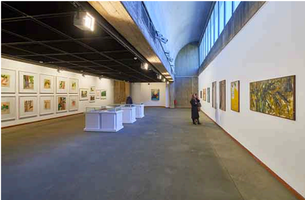
Farideh Lashai, Toward the Ineffable painting installation.

Benjamin Genocchio, Friday, December 11, 2015