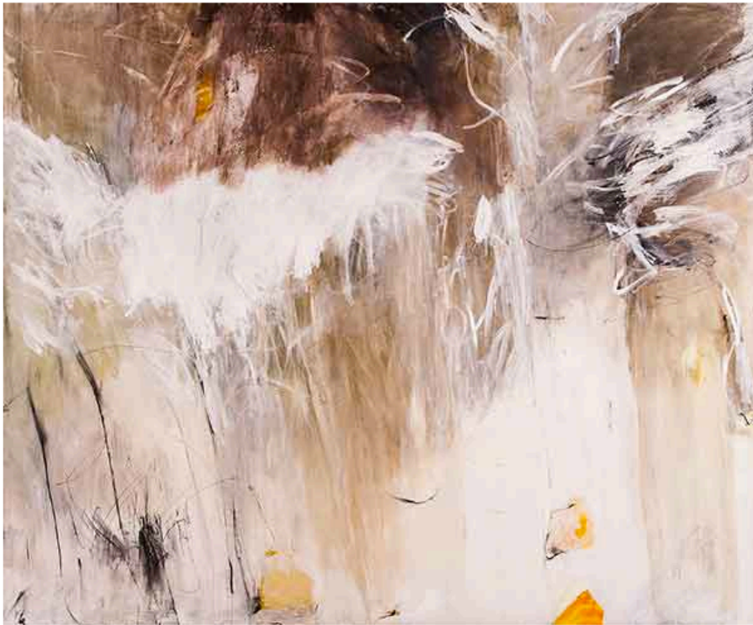
Farideh Lashai, Untitled (2005).