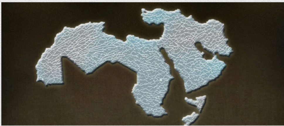
The Shattered Glass