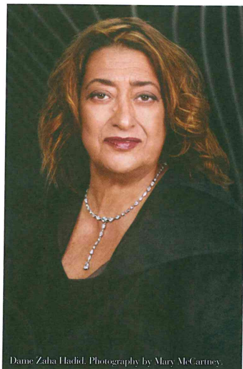
Dame Zaha Hadid.

On 21 September, Hadid was bestowed the Louise Blouin Foundation Award, recognising creative leadership and excellence for work that has had 'a positive social and political impact' locally and globally. The Award was presented at the 2015 Blouin Creative Leadership Summit in New York. Three days later, the Royal Institute of British Architects (RIBA) announced Dame Hadid would receive the 2016 Royal Gold Medal, marking her lifetime's achievements and also making her the first woman to be awarded the honour. "We now see more established female architects all the time," remarked Hadid, of the honour. "That doesn't mean it's easy. Sometimes the challenges are immense. There has been tremendous change over recent years and we will continue this progress."