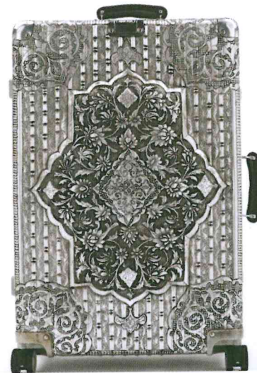
Wim Delvoye, Rimowa Classic Flight Multiwheel 971.63.00.4. 2014. Embossed Aluminium. 71 x 47 x 25.5 cm.