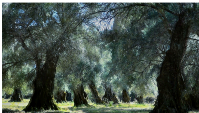
Shoja Azari and Shahram Karimi Dreamscape III , 2016 Leila Heller Gallery

Immediately noticeable are six large-scale “Dreamscapes”—serene and cheery scenes the artists located online—which subvert not only the idea of landscape as an artistic genre, but also its role in visual culture. Think, for instance, of all the rolling hills you’ve seen as desktop screensavers or tourism ads at a bus stop. In using found imagery from the Internet, the artists tap into society’s basic understanding of the natural world as something peaceful, tranquil, and under control.