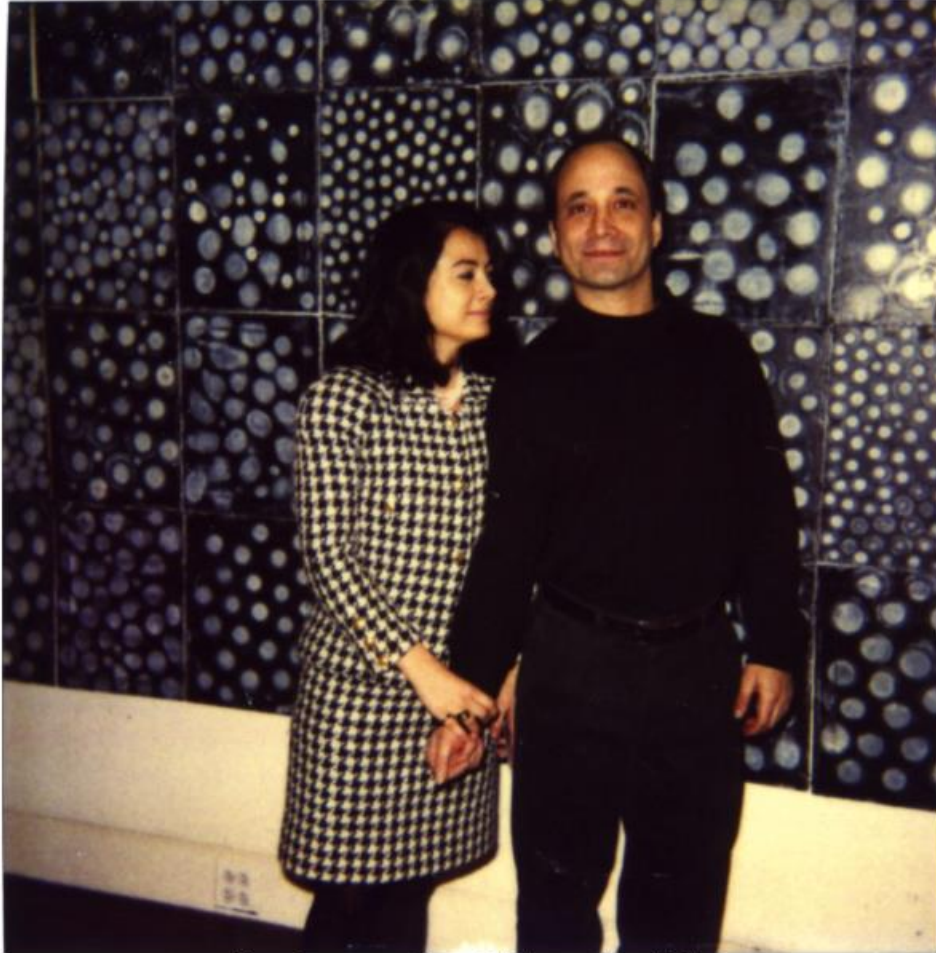
Mary Boone and Ross Bleckner circa 1991.

In 1995, Bleckner was the youngest artist ever to have a major solo show in the rotunda of New York's Guggenheim in the museum's nearly six decades of existence.