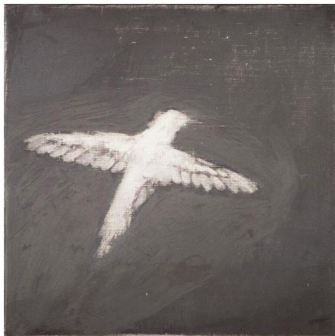
A detail from one of Ross Bleckner's bird paintings (2015).

These are Bleckner's most obviously personal works ever. "I don't like to reveal that side of me, but it comes out in your work anyway," he says, "which is always the interesting part."