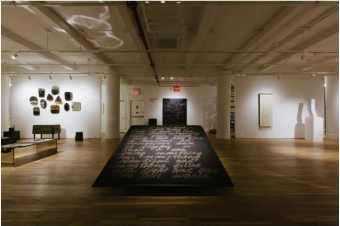
A rug from Ross Bleckner's recent "Prayer Rug" series on view in New York.