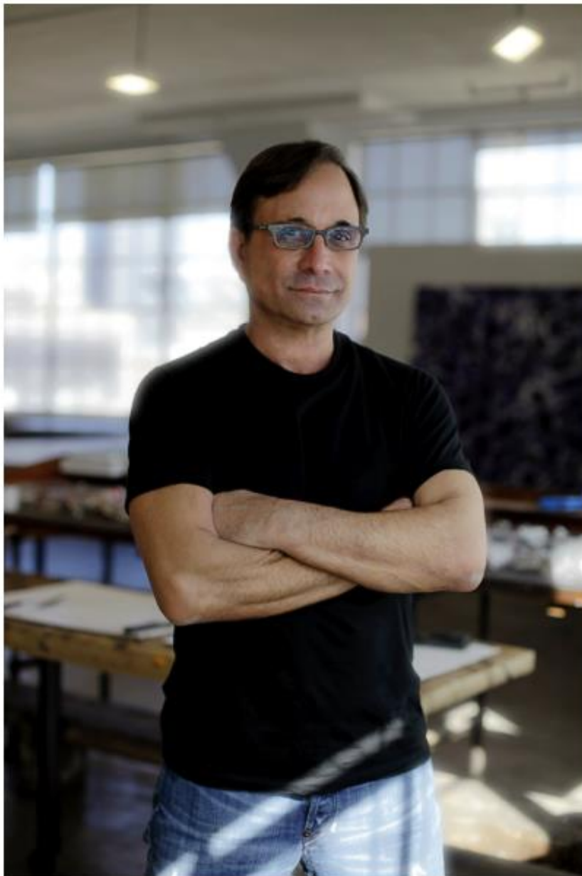
Ross Bleckner in his studio (2011).