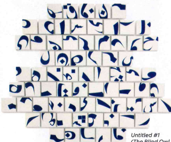
Untitled #1 (The Blind Owl Series), 2013, enamel on wood.