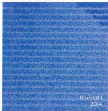
Bruised 1, 2014.