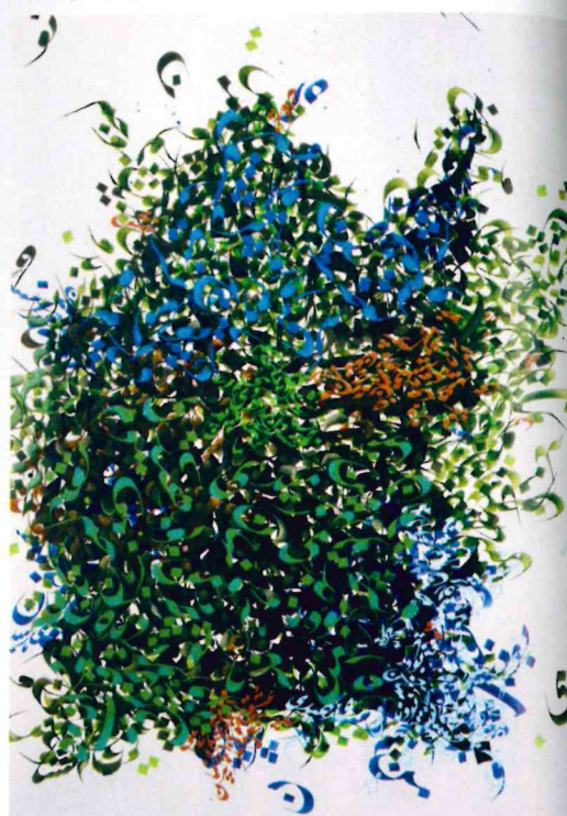
Forough 4, 2008.

the calligraphic swoops of a beloved quote. Jinchi used copper wire to sew it together. For her, the malleable, reflective metal is "like skin. It has a life of its own and changes color as it lives on," she explains.