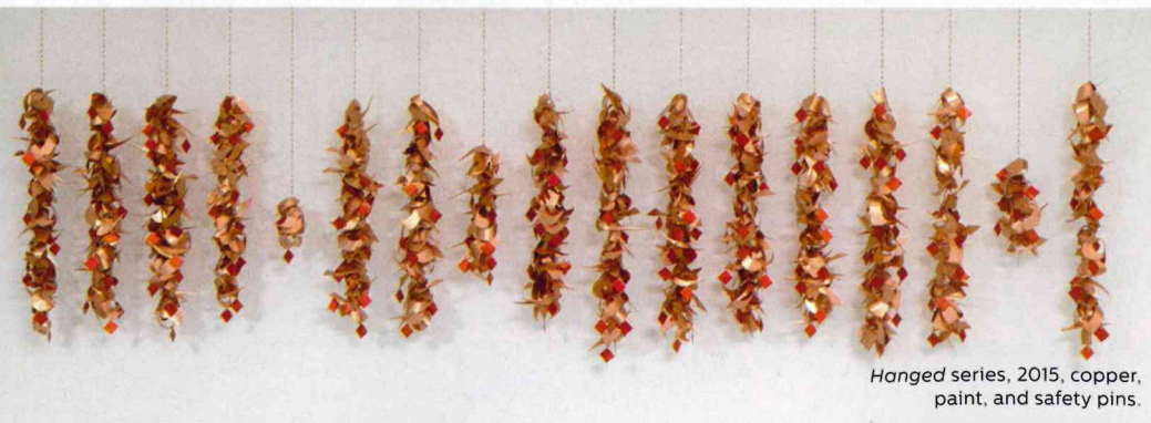
Hanged series, 2015, copper, paint, and safety pins.