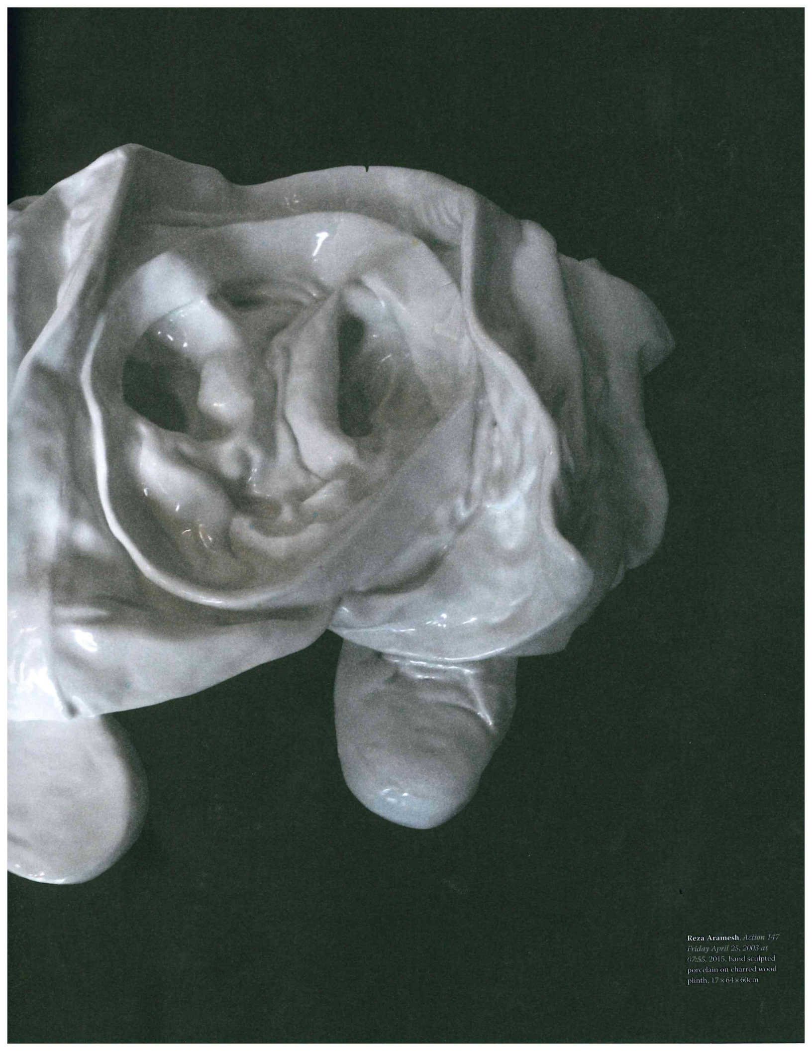
Reza Aramesh, Action 147 Friday April 25, 2003 at 07:55, 2015, hand sculpted porcelain on charred wood plinth, 17 × 61 × 60cm