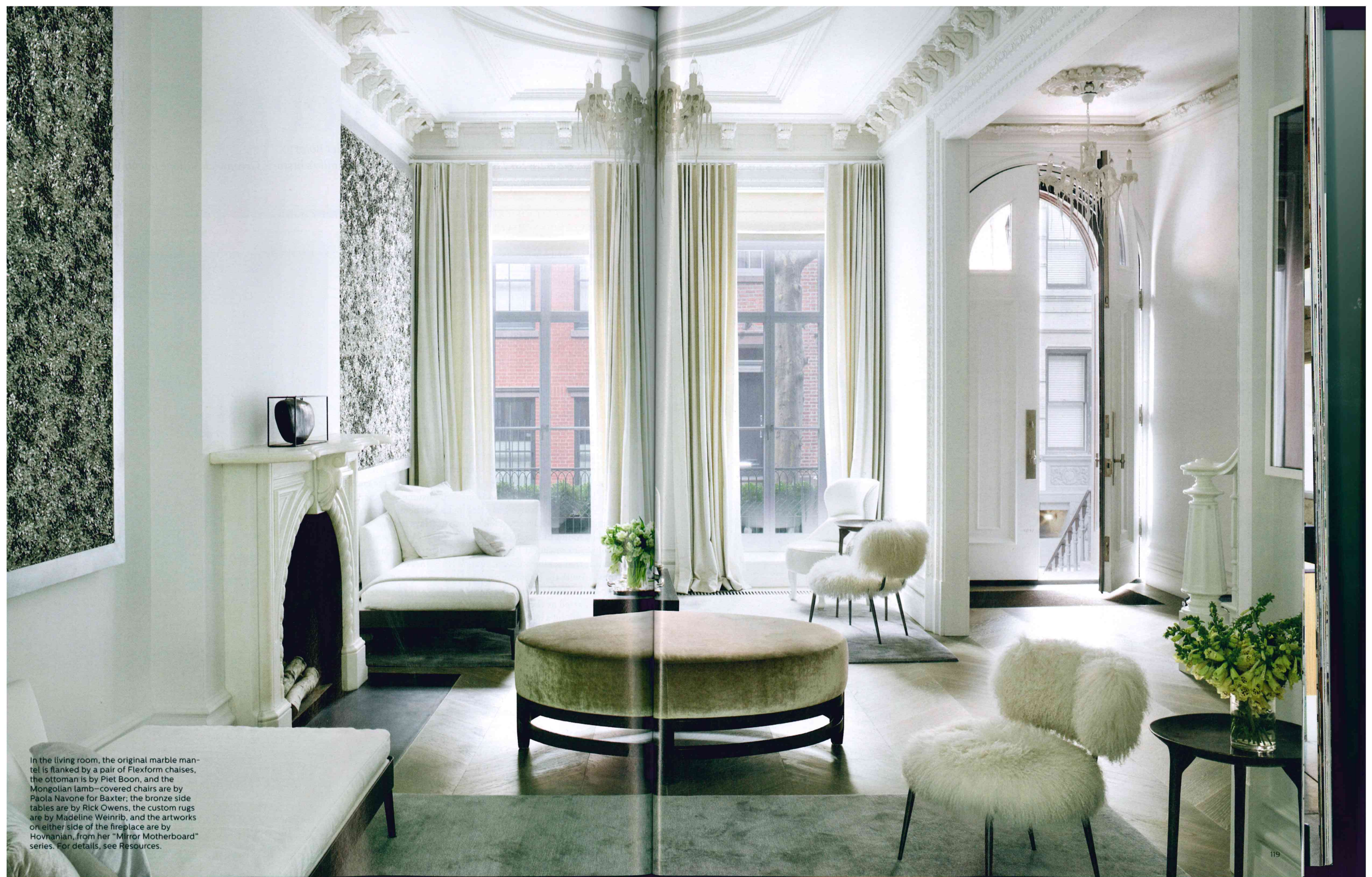
In the living room, the original marble mantel is flanked by a pair of Flexform chaises, the ottoman is by Piet Boon, and the Mongolian lamb-covered chairs are by Paola Navone for Baxter; the bronze side tables are by Rick Owens, the custom rugs are by Madeline Weinrib, and the artworks on either side of the fireplace are by Hovnanian, from her "Mirror Motherboard" series. For details, see Resources.