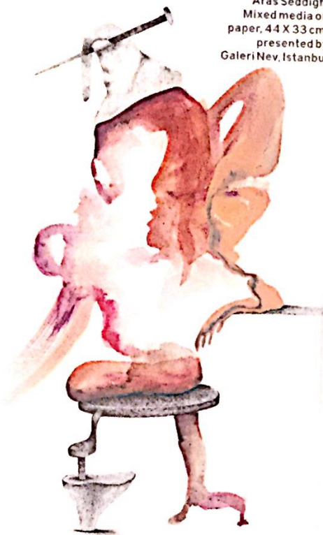
Untitled, 2015, by Aras Seddigh, Mixed media on paper, 44 X 33 cm, presented by Galeri Nev, Istanbul