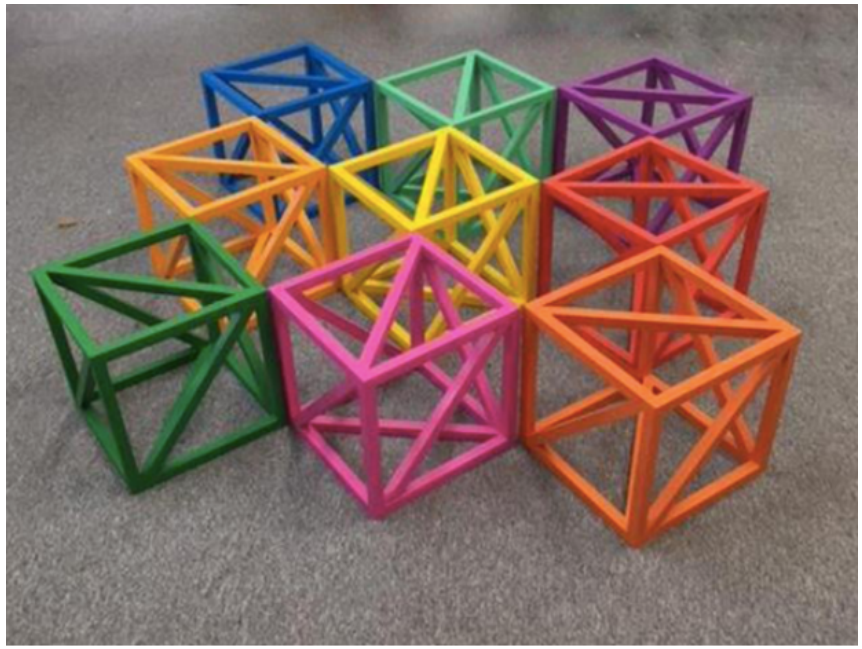
Rasheed Araeen, Chandni Raat, 2018, Wood and paint, 73 x 86 x 5 in.

Dubai can also be called the art capital of South Asia, if not of Asia or the world. Artists who cannot travel to their neighbouring country can meet on neutral ground in Dubai. Art Dubai has been happening for the past 11 years, and this year, too, the 12<sup>th</sup> edition was held from March 21-24. It included 105 galleries from 48 countries, some participating for the first time like Kazakhstan and Ethiopia.