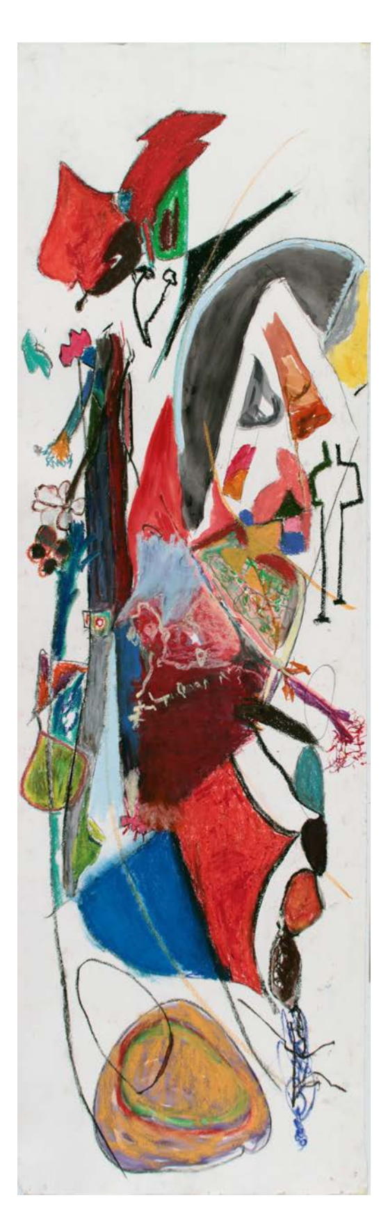
Constructed Imagination , 2023 Oil and Mixed Media on Paper 132.08 x 42.55 cm. / 52 x 16.75 in.