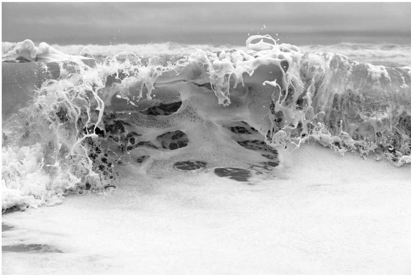
Hurricane LX 2009 Archival pigment print 61 x 83.8 cm (framed) Edition 9 of 12