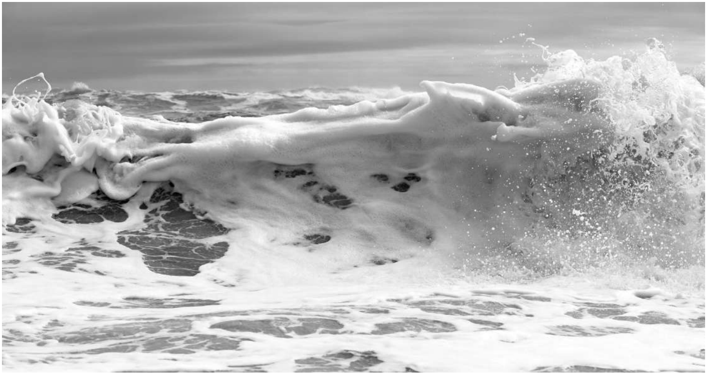
Hurricane LVIII 2009 Archival pigment print 121.9 x 208.3 cm (framed) Edition 3 of 5