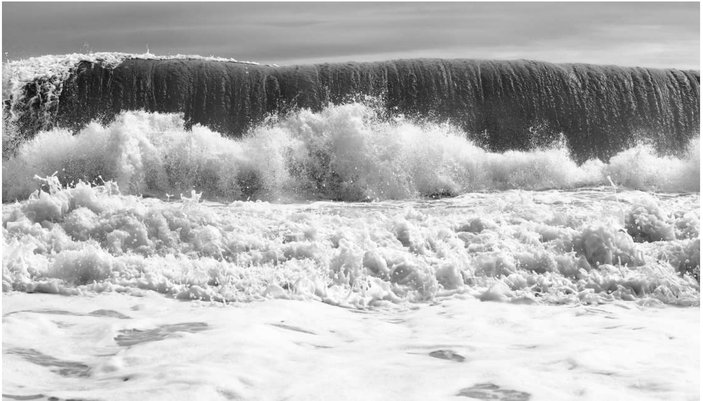
Hurricane LXXXII 2009 Archival pigment print 121.9 x 208.3 cm (framed) Edition 4 of 5