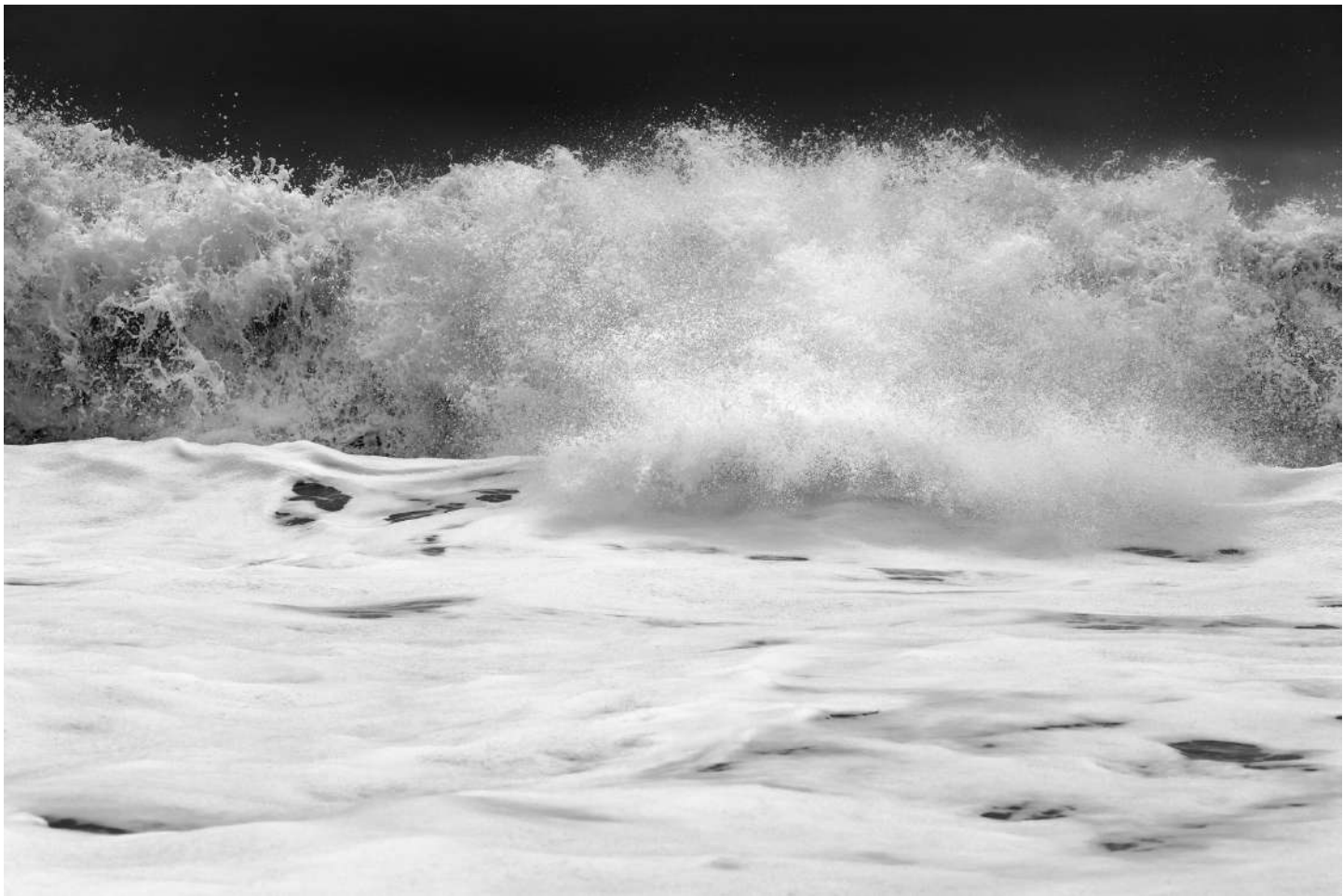
Hurricane LXXX (variant A) 2017 Archival pigment print 61 x 83.8 cm (framed) Edition of 1 of 12