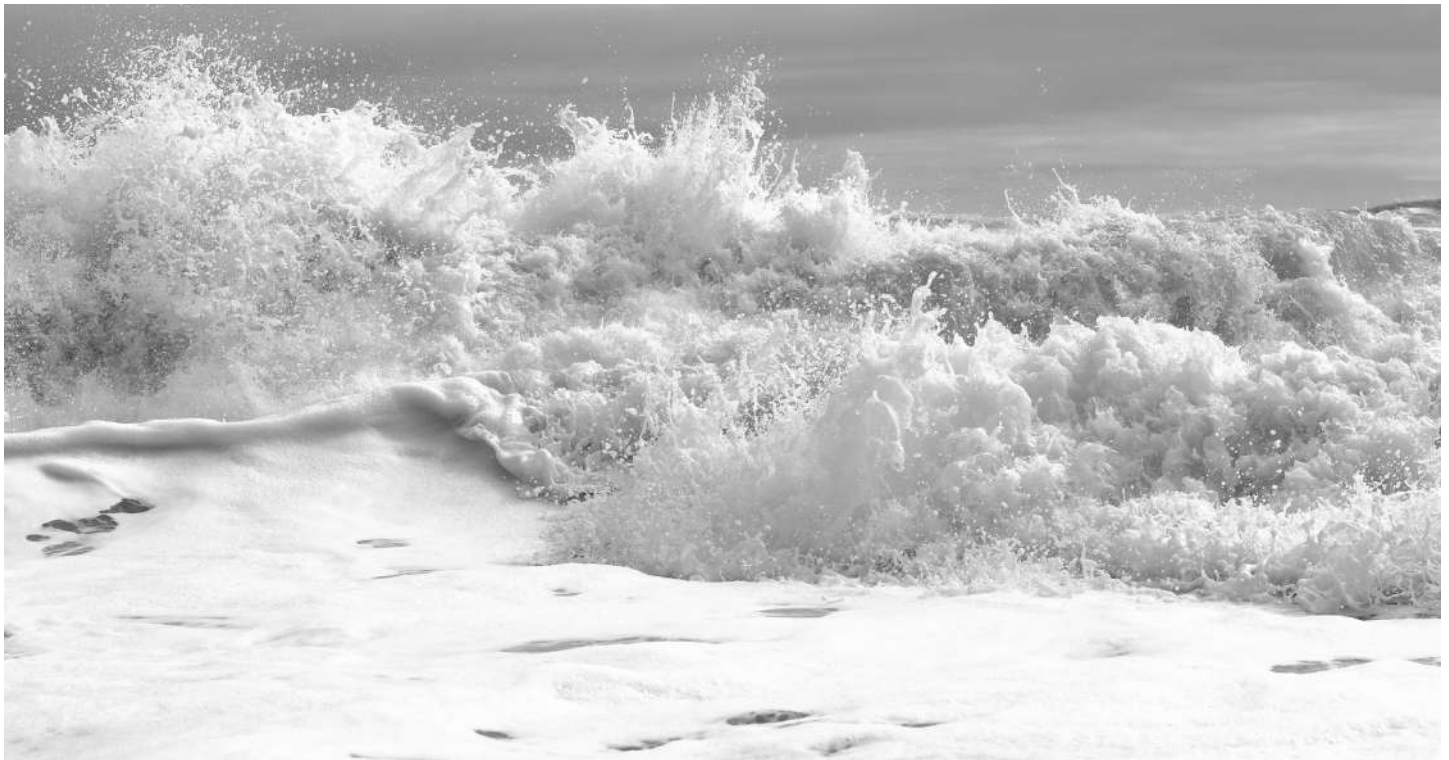
Hurricane LXIII 2013 Archival pigment print 185.4 x 327.7 cm (framed) Edition 1 of 3