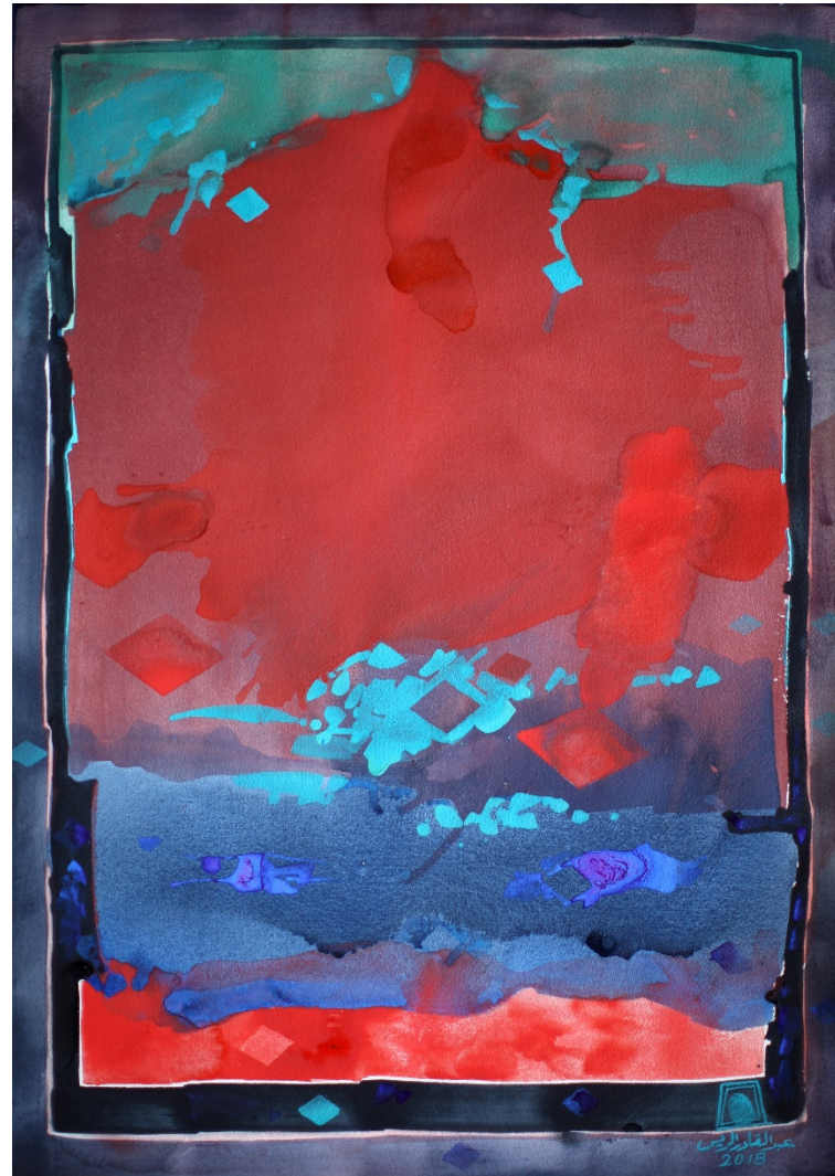
Abstract, 2018 Watercolor on Paper 105 x 75 cm