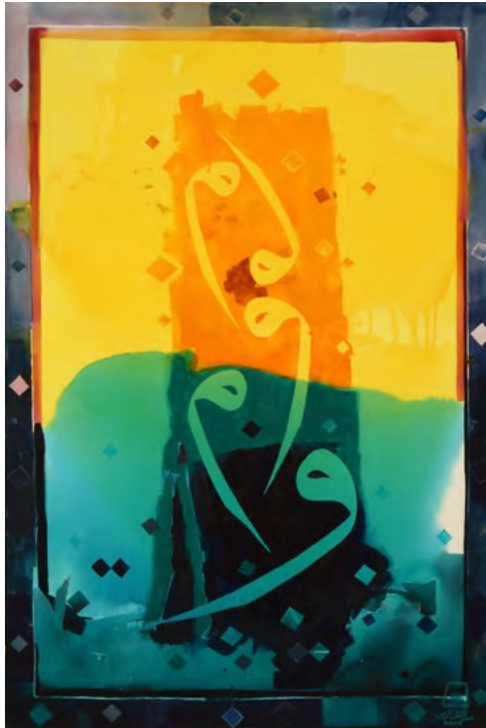
Untitled Watercolor on Paper 155 x 105 cm