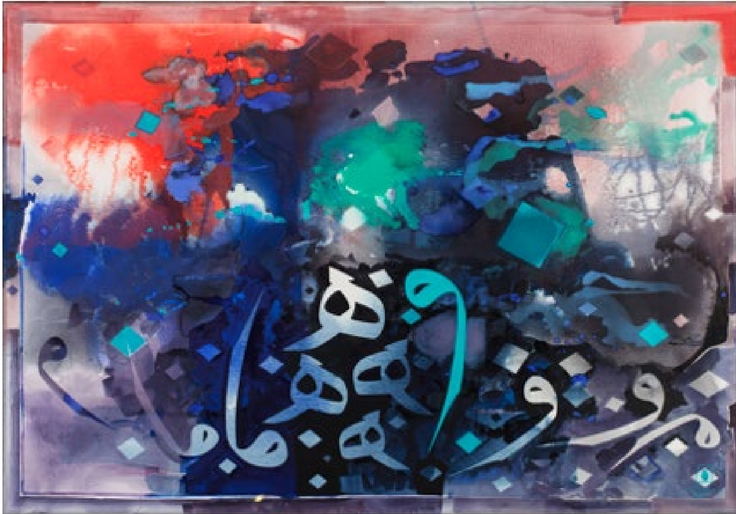
Serenity Series, 2017 Watercolor on Paper 157 x 207 cm