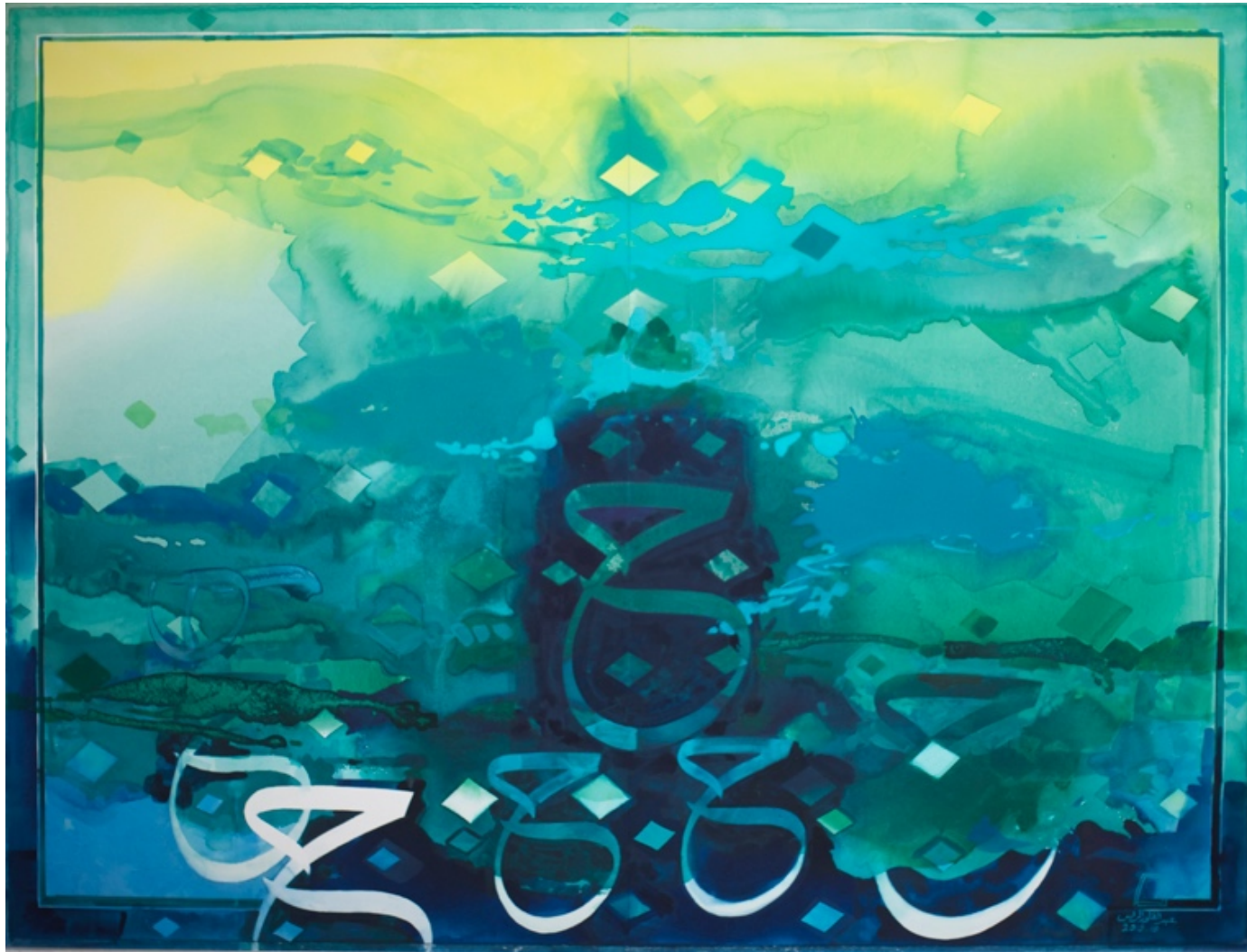
The Power of Letter , 2019 Watercolor on Paper 157 x 207 cm