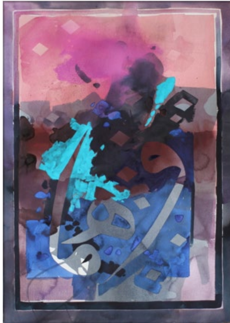
Serenity Series, 2019 Watercolor on Paper 105 x 75 cm