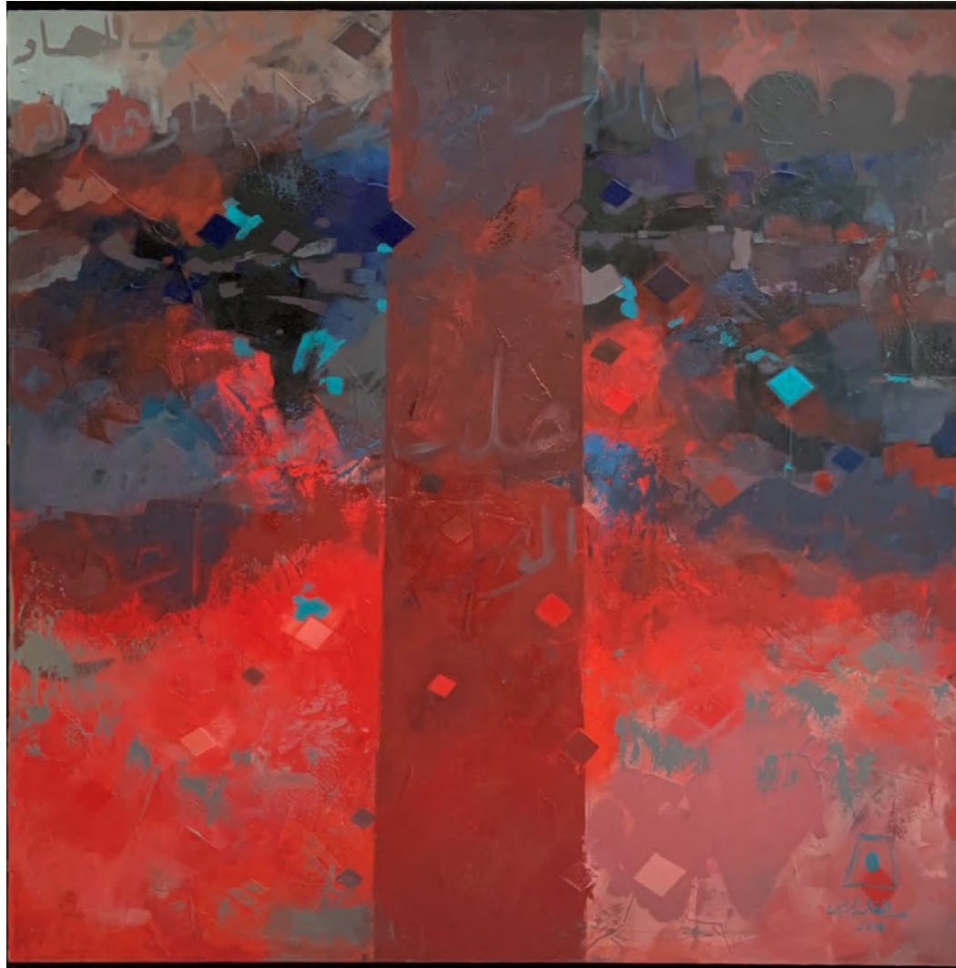
Untitled Oil on Canvas 200 x 200 cm