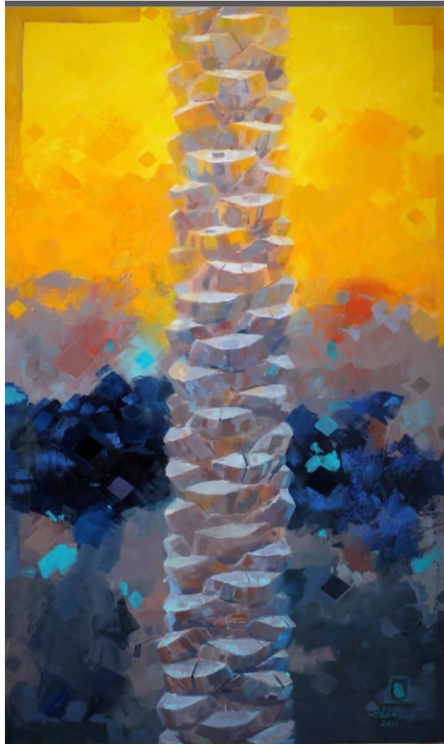
Untitled Oil on Canvas 150 x 100 cm