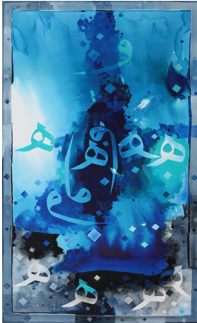
Serenity Series, 2010 Watercolor on Paper 257 x 159 cm