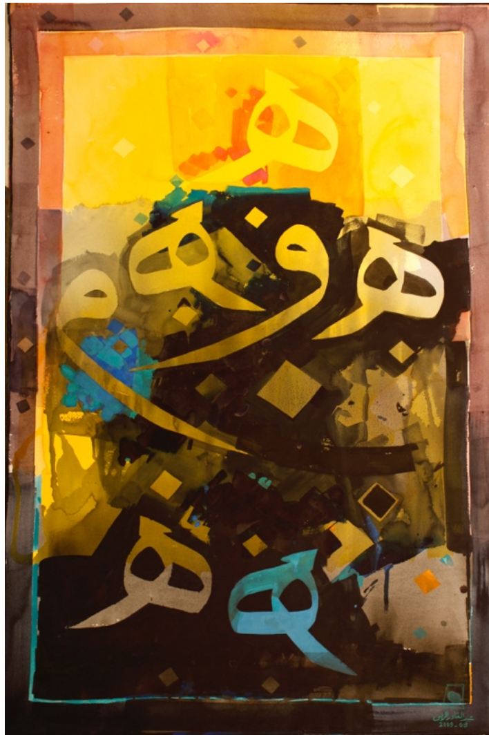
Serenity Series, 2008-2009 Watercolor on Paper 155 x 105 cm