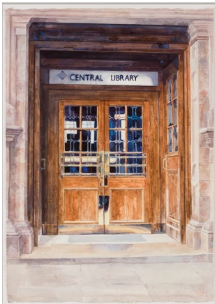
Central Library, 2004 - 2005 Watercolor on Paper 105 x 75 cm