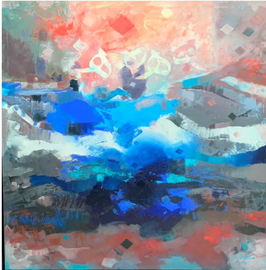
Untitled Oil on Canvas 200 x 200 cm