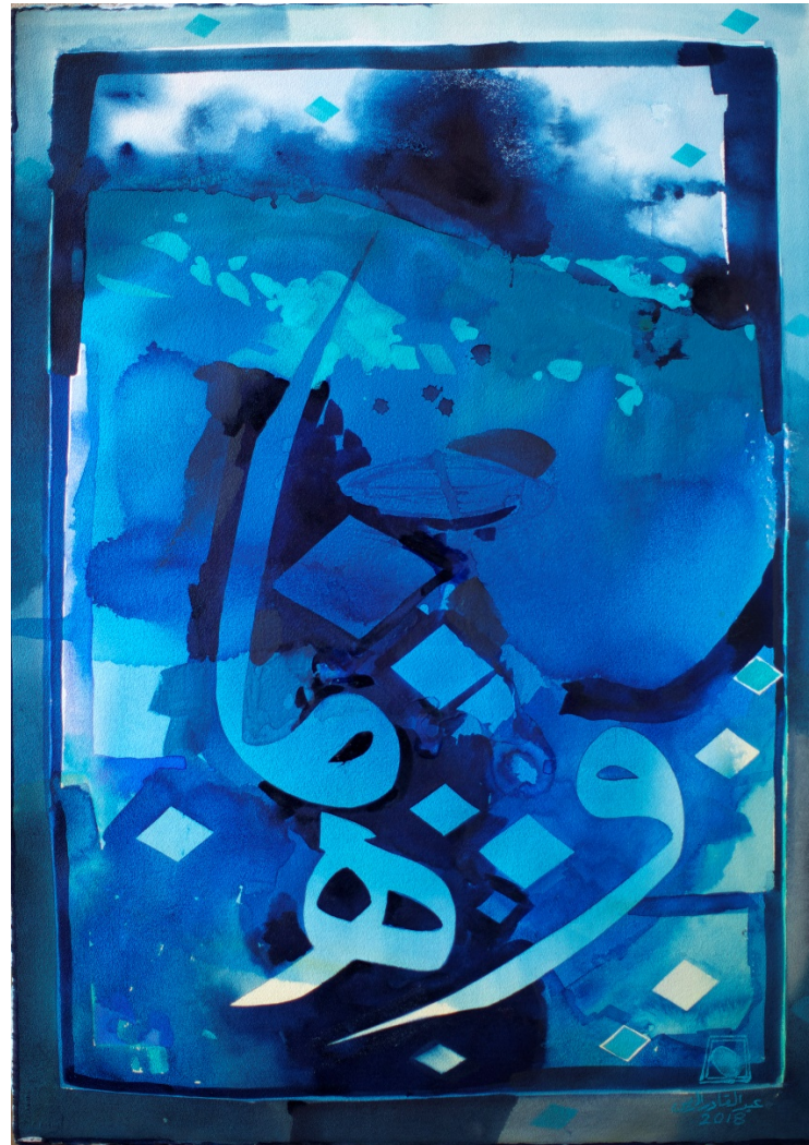
Serenity Series, 2018 Watercolor on Paper 105 x 75 cm