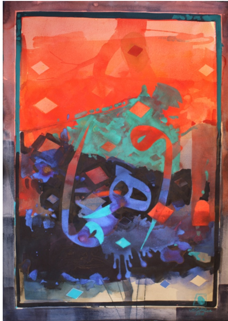
Serenity Series, 2018 Watercolor on Paper 105 x 75 cm