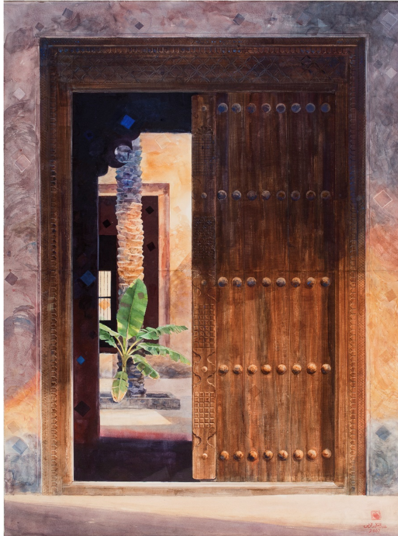
Yesteryear Series, 2007 Watercolor on Paper 207 x 157 cm