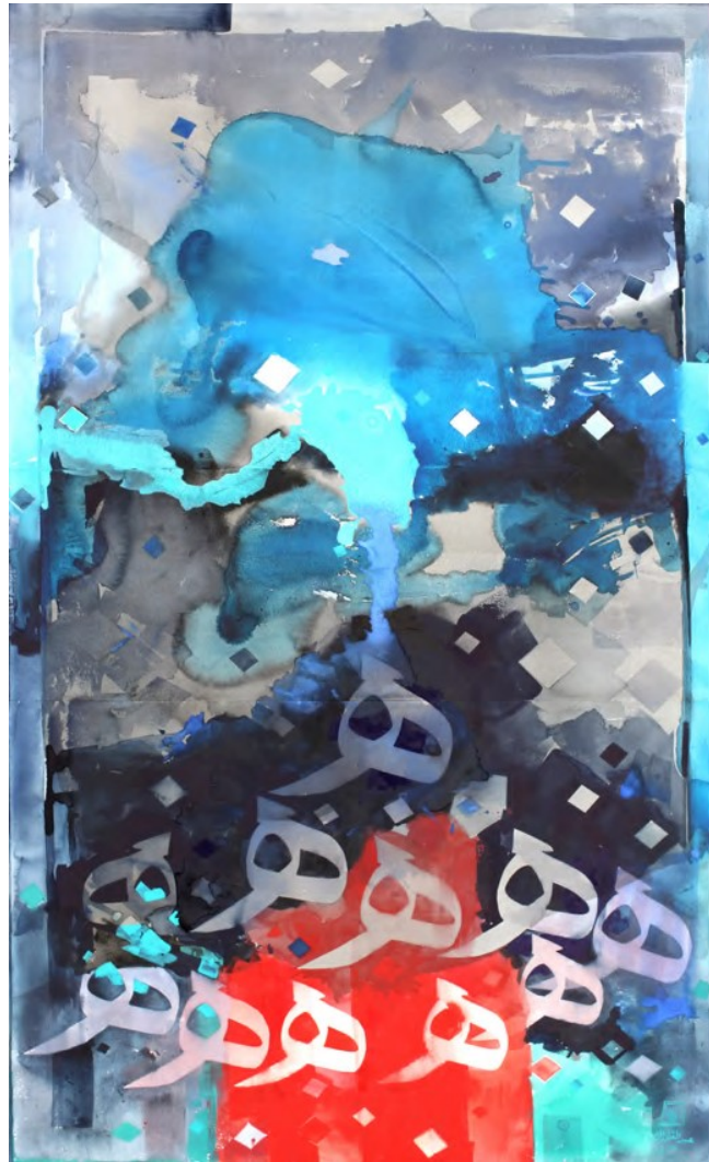
Untitled Watercolor on Paper 257 x 157 cm