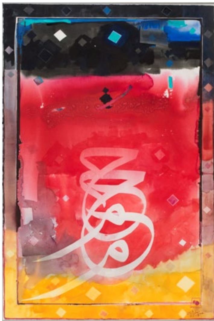
The Power of Letter, 2008 Watercolor on Paper 155 x 105 cm