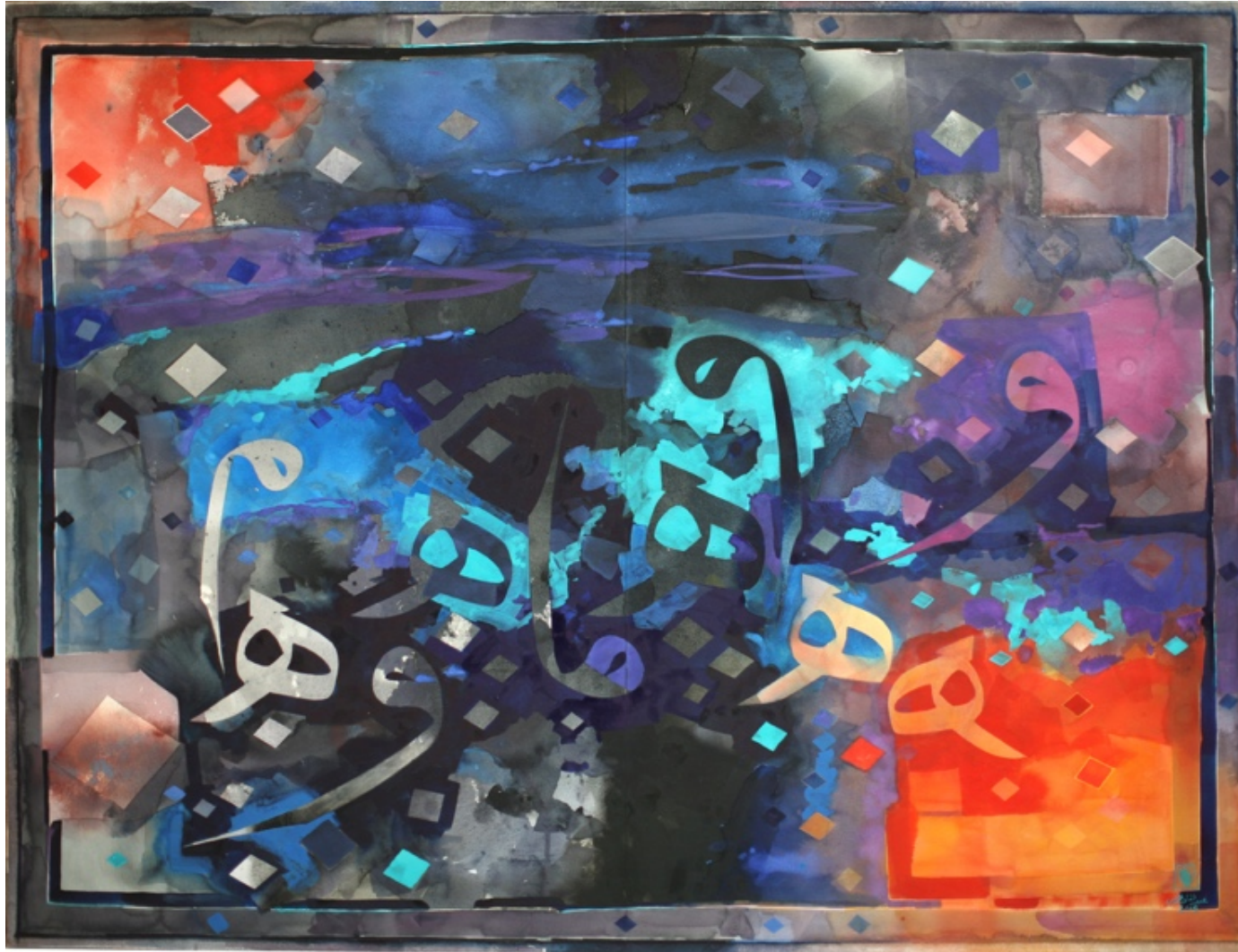
Serenity Series, 2015 Watercolor on Paper 157 x 207 cm