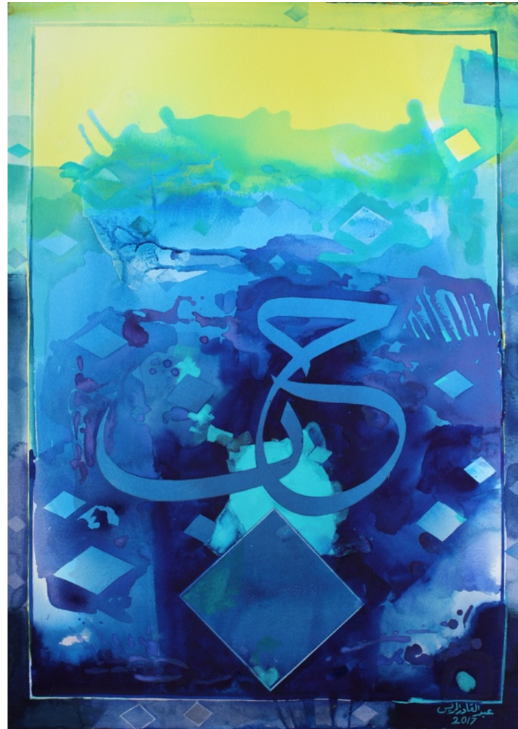
Calligraphy Series, 2017 Watercolor on Paper 105 x 75 cm