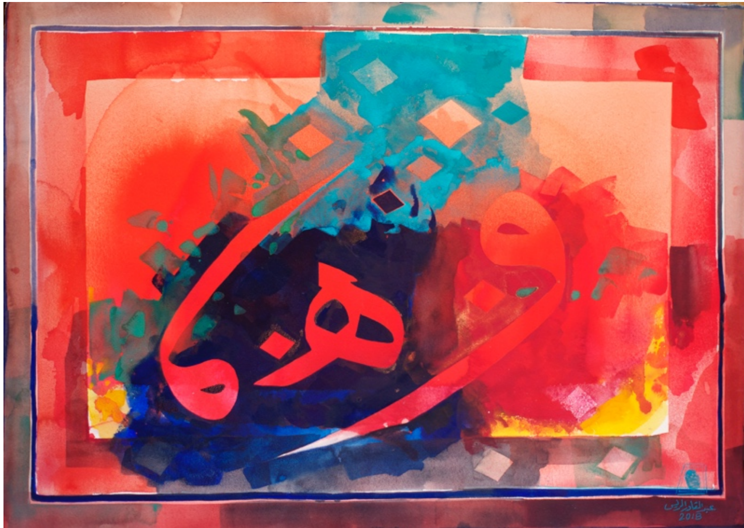
Serenity Series, 2018 Watercolor on Paper 75 x 105 cm