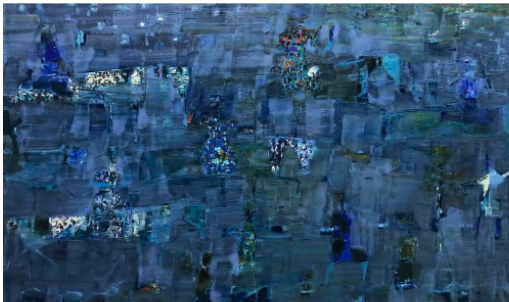
Indigo Hunt , 2019 Oil on Canvas 120 x 200 cm, 47.24 x 78.74 in