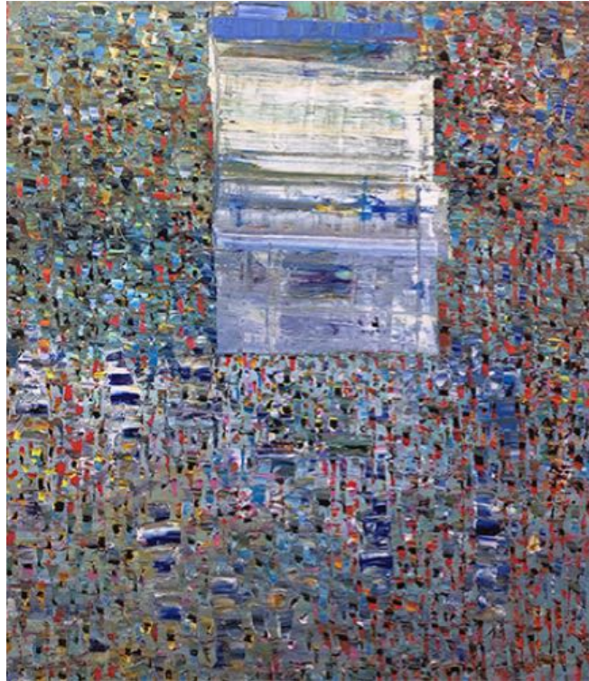
Garden Party, 2019 Oil on Canvas 160 x 140 cm, 62.99 x 55.11 in