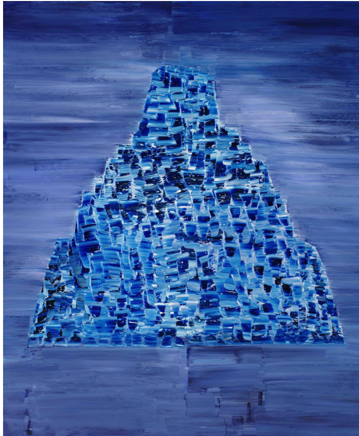
Honore Blue , 2019 Oil on Canvas 183 x 152 cm, 72 x 59.84 in