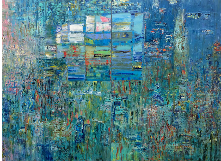
Spring Garden Party, 2019 Diptych Oil on Canvas 200 x 240 cm, 78.74 x 94.491 in