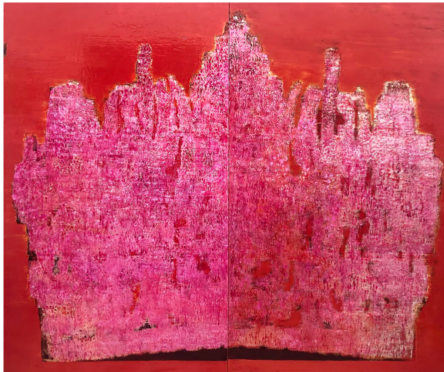
Crown Pink, 2019 Diptych Oil on Canvas 200 x 240 cm, 78.74 x 94.491 in