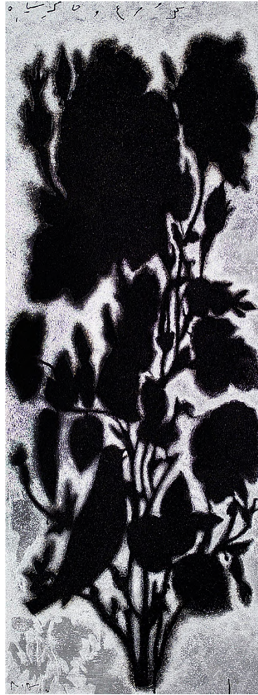
Rose and Nightingale , 2019 Oil on Canvas 243 x 76 cm, 95.67 x 29.92 in