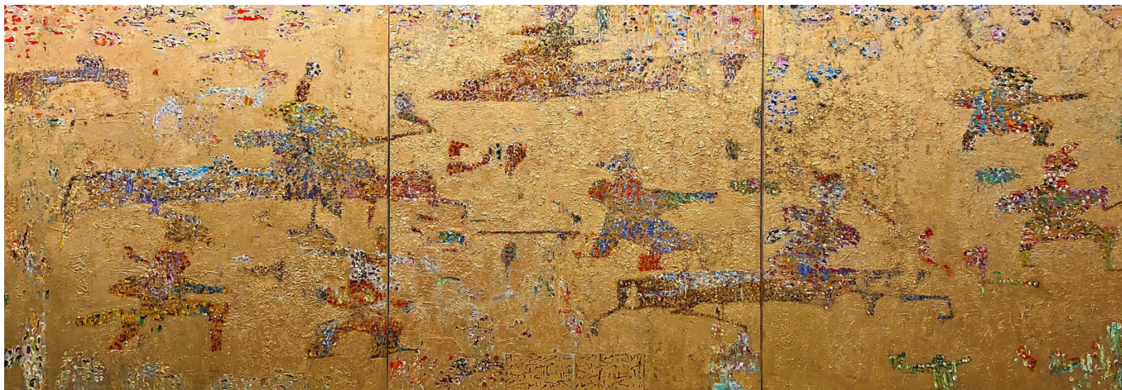
Gold Hunt, 2019 Triptych Oil and Gold Paste on Canvas 178 x 534 cm, 70.08 x 210.24 in