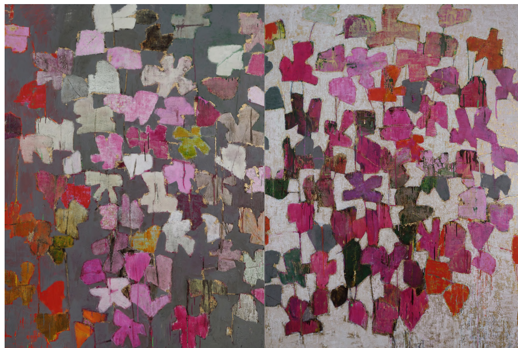
Day & Night, 2019 Diptych Oil on Canvas 200 x 300 cm, 78.74 x 118.11 in