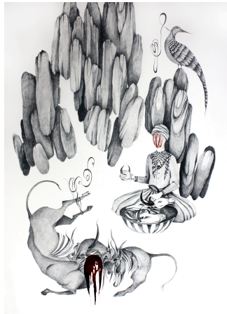
Shiva Ahmadi Untitled 2 , 2014 Graphite, Pencil on Arches Paper 36 x 28.5 in (framed) / 91.4 x 72.4 cm

Leila Heller Gallery at Art International Istanbul September 26 –28, 2014 Booth C4