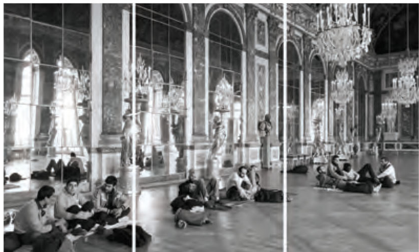
Action 121 by Reza Aramesh.

Leila Heller Gallery is located in the heart of New York's gallery district and promotes a cutting-edge programme of contemporary international emerging and mid-career artists. The gallery has gained recognition for fostering the careers of artists working across a multitude of disciplines and mediums.