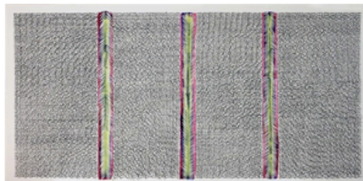
Hadieh Shafie Grid/Cut 2 , 2014 Price on Request