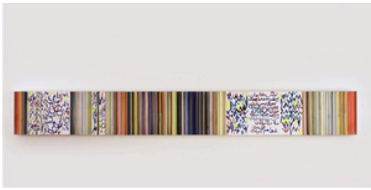
Hadieh Shafie Forugh 3, 2014 Price on Request