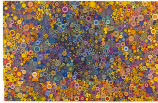
Hadieh Shafie 9 Colors, 2015 Price on Request