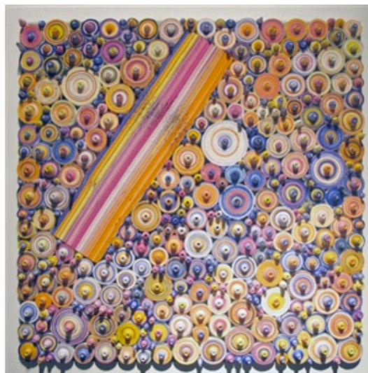
Hadieh Shafie Spike 9 , 2015 Price on Request