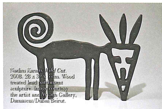
Nadim Karam. Wild Cat . 2008. 28 x 39 x 8 cm. Wood treated lead sculpture.

Tashkeel has commissioned Lebanese filmmaker Mahmoud Kaabour of the Teta Alf Marra fame to create a documentary on the partnership between the Delfina Foundation, Tashkeel, Dubai Culture and Arts Authority and A.i.R Dubai. The documentary will see Kaabour follow the seven artists in residence in 2013, and will be shown at this year's Art Dubai.