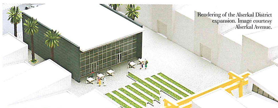
Rendering of the Alserkal District expansion.