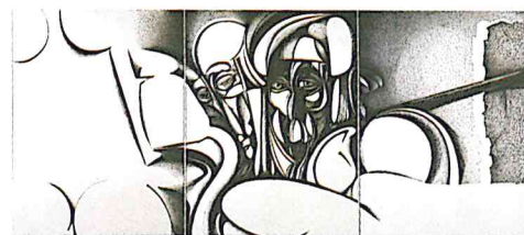
Ibrahim Salahi. The Opening of Khartoum . 1989. Indian ink on paper. 135 x 64 cm.

Showcasing 100 works by one of the key figures in Arab and African Modernism, the Tate Modern will host a major exhibition of Sudanese artist Ibrahim El-Salahi's works from 3 July to 22 September.