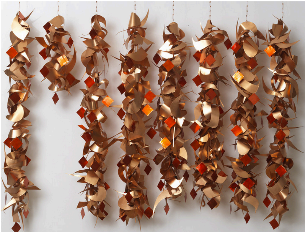
Jinchi Pouran, Hanged , detail, 2015, copper, 7w in

17 Sep — 24 Oct 2015 at Leila Heller Gallery in New York, United States