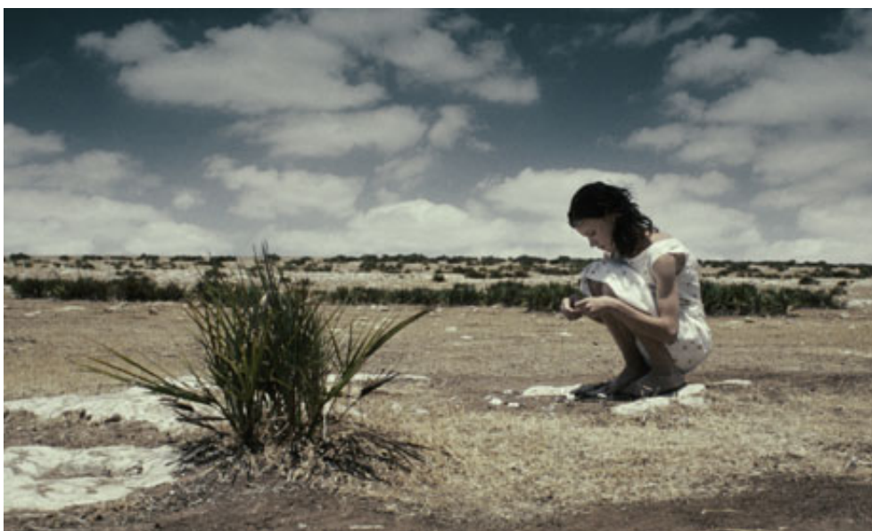
Scene from Women Without Men , Shirin Neshat's poetic film about the 1953 Iranian coup.