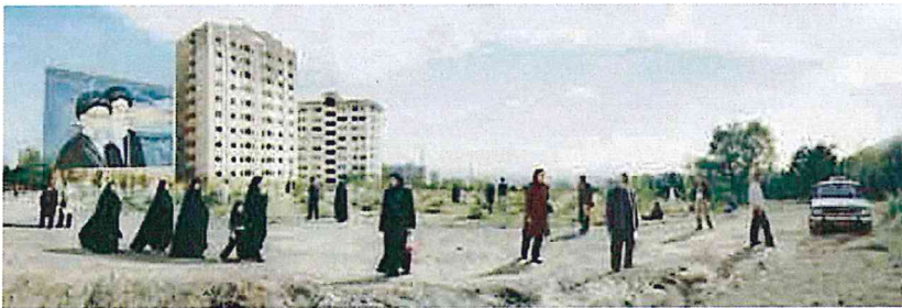
Tehran 2006, 2006 / C-type light jet print / 40 x 119 in / 101 x 302 cm / Edition of 5, 2 Ap © Mitra Tabrizian