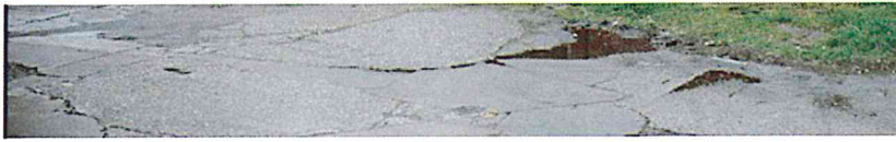
Leicestershire 2012, 2012 / C-type photographic print / 61 x 48 in / 155 x 122 cm / Edition of 5, 2 Aps © Mitra Tabrizian

In the brochure essay, Mahlouji writes, "When figures appear in groups, Tabrizian's meticulous compositional juxtapositions and directorial interventions ensure an even more acute sense of dissociation and dislocation. Where expectation is congruency and relatedness, actors remain hermitically solitary. Despite co-habiting a particular and shared fragment of space, the protagonists remain resolutely detached, disunited and scattered."