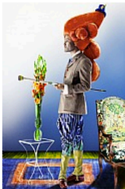
Iké Udé Sartorial Anarchy #5 , 2013

View : Current Exhibitions Past Exhibitions