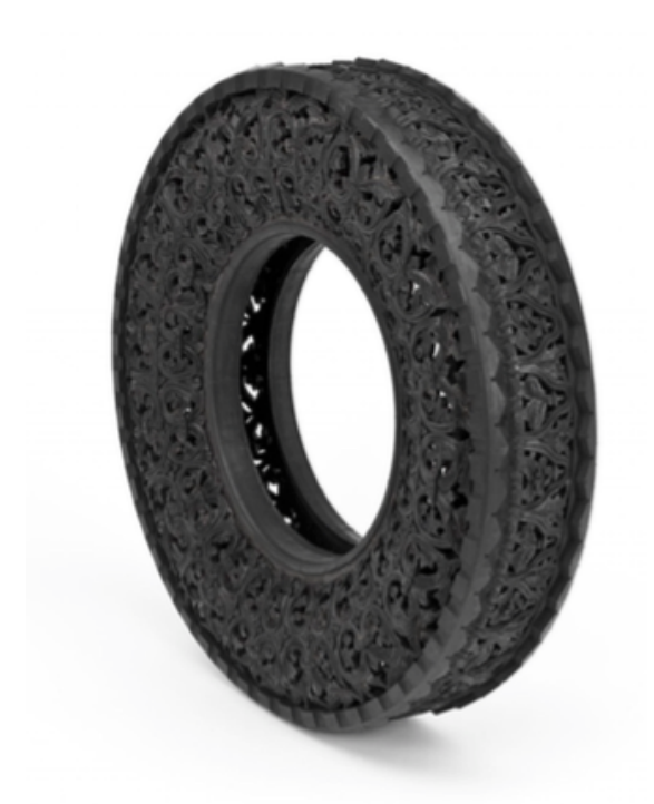
Hand Carved Tire