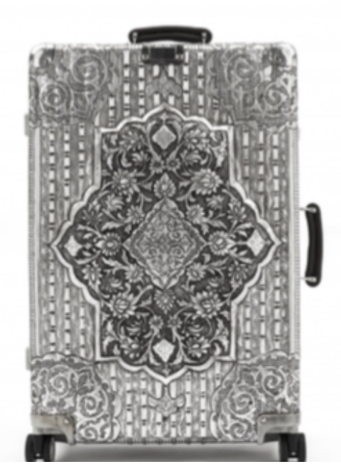
Rimowa Classic Flight Multiweel, Embossed Aluminum