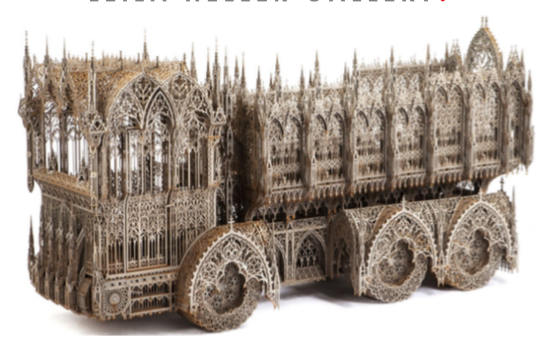
Dump Truck, Laser-cut Corten Steel