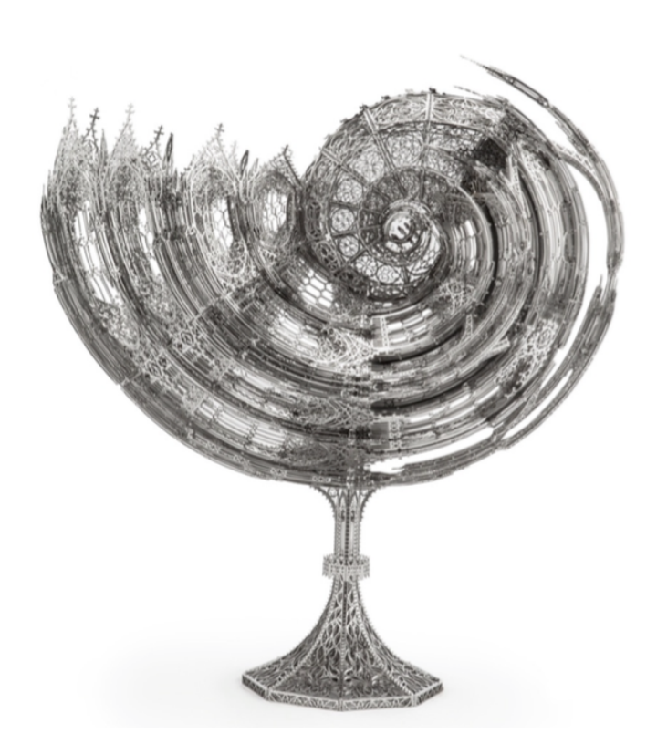
Gothic Nautilus Shell, Laser-cut Stainless Steel