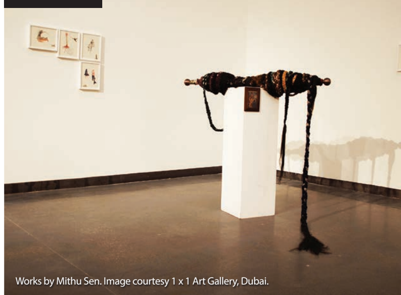
Works by Mithu Sen.