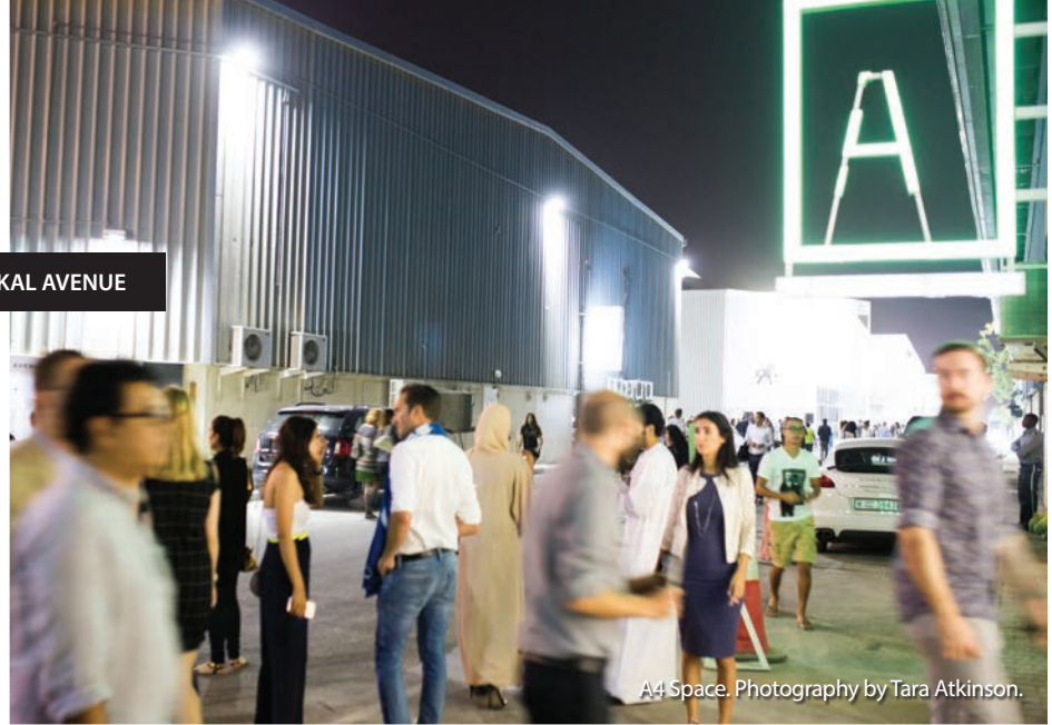
A4 Space.