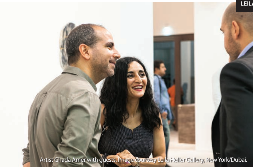
Artist Ghada Amer with guests.