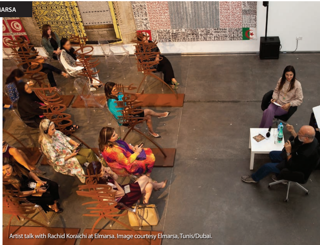
Artist talk with Rachid Koraichi at Elmarsa.