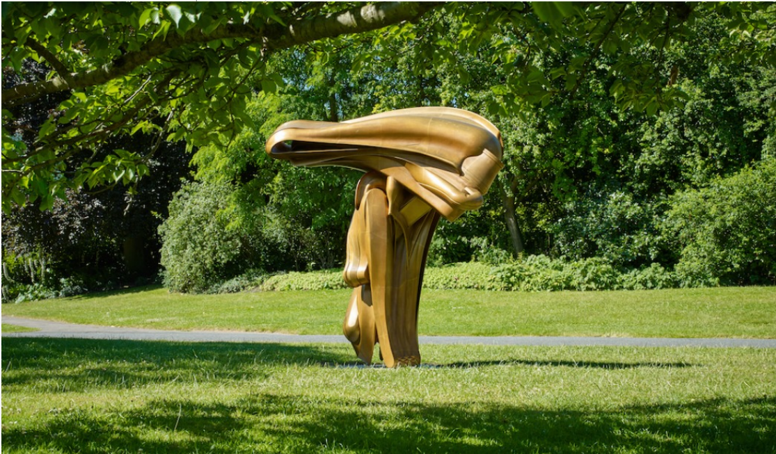
Tony Cragg, Stroke, 2014, presented by Holtermann Fine Art. Frieze Sculpture 2017.

Ahead of Frieze London and Frieze Masters, which in 2017 both take place from October 5-8, Frieze has launched the first-ever summer edition of its Frieze Sculpture Park in London, having started previous editions in October to coincide with the opening of the two fairs.