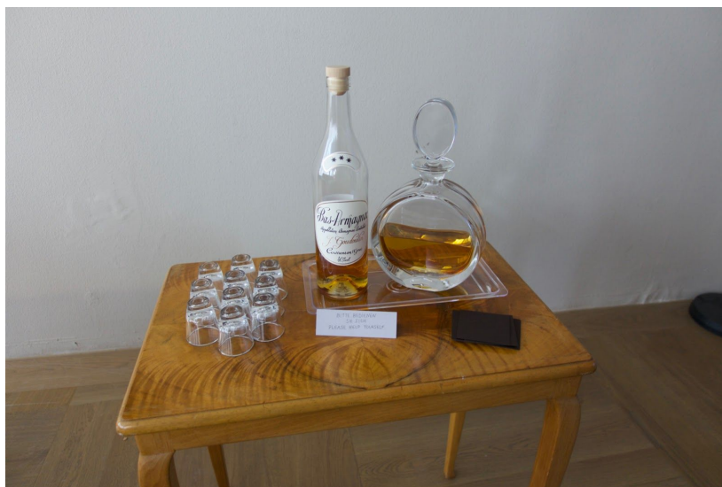
«Please use»: A glass of Armagnac for the art installation «The secret life of things is open» by Wu Tsang in the Club de Bâle.

Continue to go down the Rhine. With a trip into the Elfdausigjumperstube, where strange things happen. A zombie cat is to be tamed with plush toys after a group of Dr. Jekylls in laboratory experiments in Mister Hydes. Or so. Specifically, it is the double performance "The Green Room & Science Lab" by Marvin Daye Chetwynd.