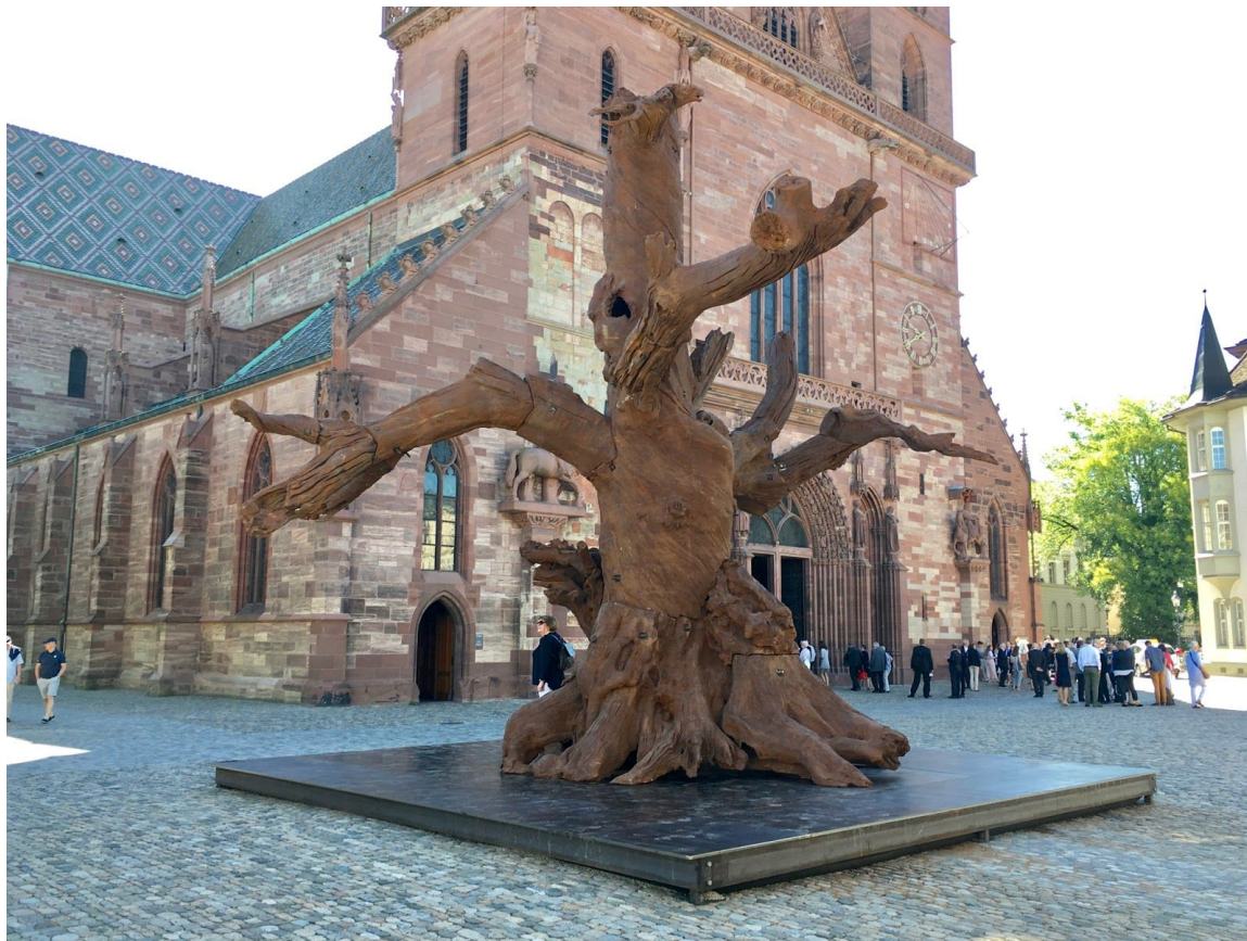
Dead tree, powerful and also not again: «Iron Tree» of Ai Weiwei on the Münsterplatz.

only to hand-picked VIPs. But there are alternatives. There are many places in Basel, where you can be surprised by the art week without an entry on a guestlist, without registration and even without paying for art.