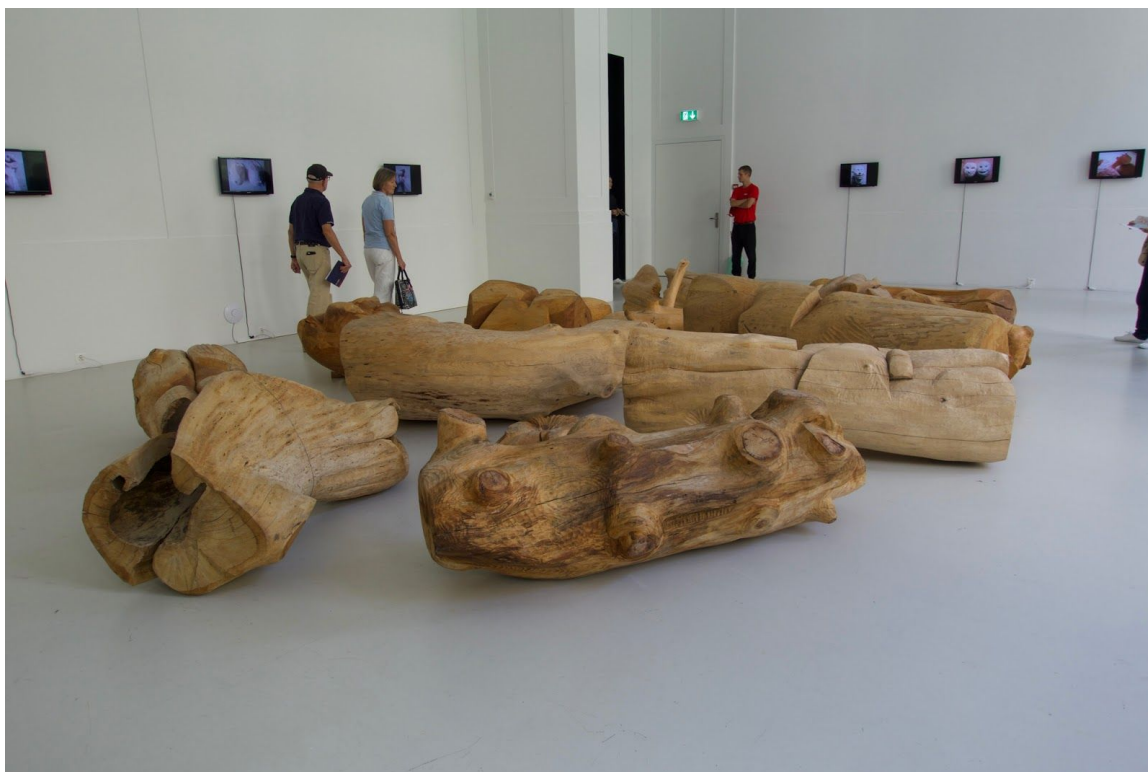
"Battlefield / Age" by Miriam Cahn in the Museum of Cultures.