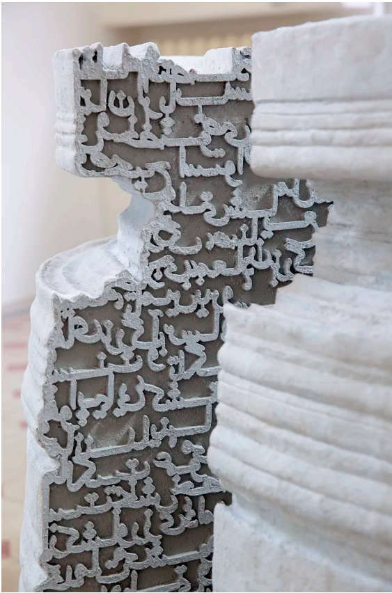
Detail of Nazgol Ansarinia's 'Article 44, Pillars' (2016) and the full sculpture below © Courtesy the artist, Collezione Righi, Bologna, Galleria Raffaella Cortese, Milan, and Green Art Gallery, Dubai