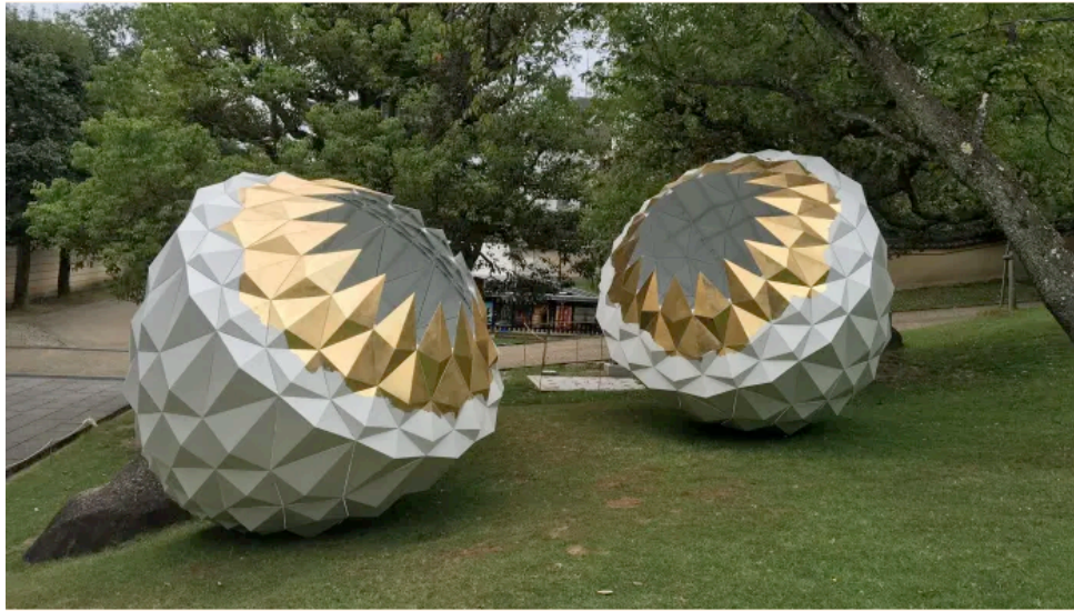
Sahand Hesamiyan's 'Forough' (2016)

An exhibition of artists from the country at Palazzo Pisani reverberates with the city's historic role as east-west meeting point