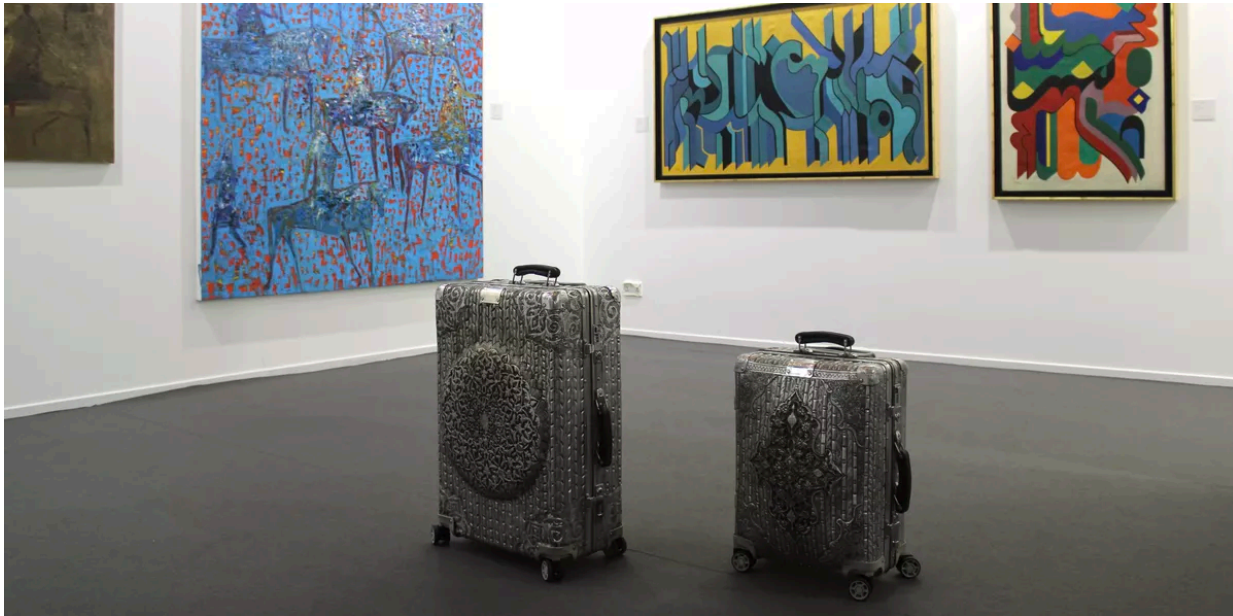
Installation view of Leila Heller Gallery's booth at Art Dubai 2022.

Returning to the fair with an eclectic mix of artworks, Leila Heller Gallery places traditional and conceptual art side by side, from overflowing calligraphic canvases to ornamented luggage, hinting at the notion of globalization. Originally from Belgium, Wim Delvoye has two decorated aluminum suitcases, entitled Rimowa Classic Flight Multiwheel , manifesting his known practice of embellishing mundane items with intricate carving, some of it inspired by Persian patterning.