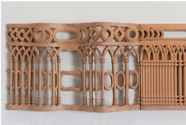
Asma Belhamar: Solid Void