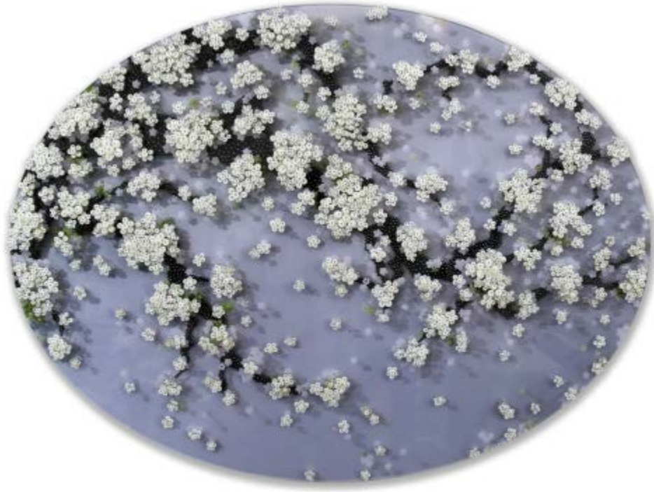
Ran Hwang, After Ago_PWL , 2021. Buttons, beads, pins on DIASEC. 33 2/5 × 45 1/5 × 1 9/10 in. | 84.8 × 114.8 × 4.8 cm.

and crystals. In her art, she contemplates life, death, and rebirth and reflects on causes of terror and the effects of violence on individuals.