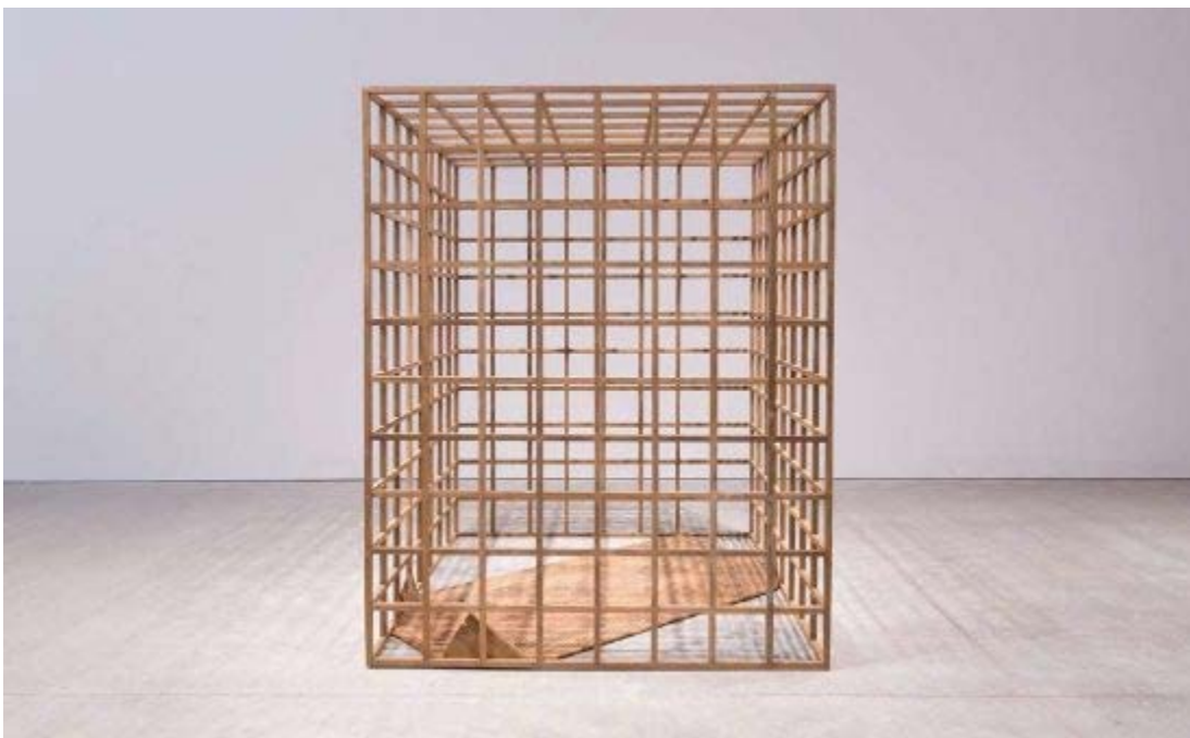
Sudarshan Shetty, Untitled, 2017. Recycled teak wood. 72 x 72 x 90 in. 80 x 40 x 12 in.

Sudarshan Shetty (b. 1961, Mangalore, India) is a visual artist who resides in Mumbai. He is mostly known for his large sculptural installations and multi-media art pieces. Experimenting with numerous materials and mediums, Shetty uses everyday objects in his artworks to open up new possibilities of meaning.