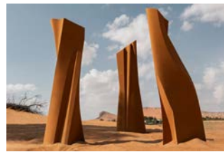
Welcome Home Exhibition at ME Hotel