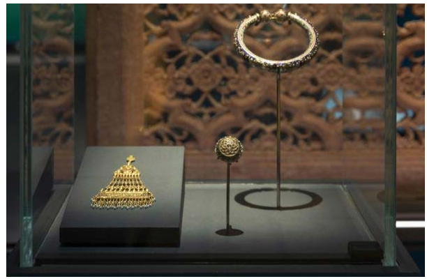
Bollywood Superstars: A Short Story of Indian Cinema