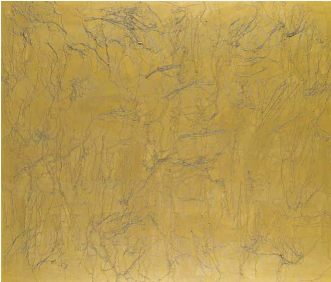
Ghada Amer, Golden Stripes , 2005. Acrylic and thread on canvas. 59 × 70 in. | 149.9 × 177.8 cm.

Shirin Neshat (b. 1957, Qazvin, Imperial State of Iran) is an Iranian visual artist residing in New York; she works in film, video installations, and photography. Neshat explores the relationship between women and the religious and cultural value systems of Islam.