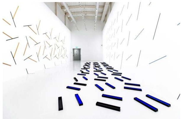
Mehdi Moutashar's Solo Show Introspection as Resistance