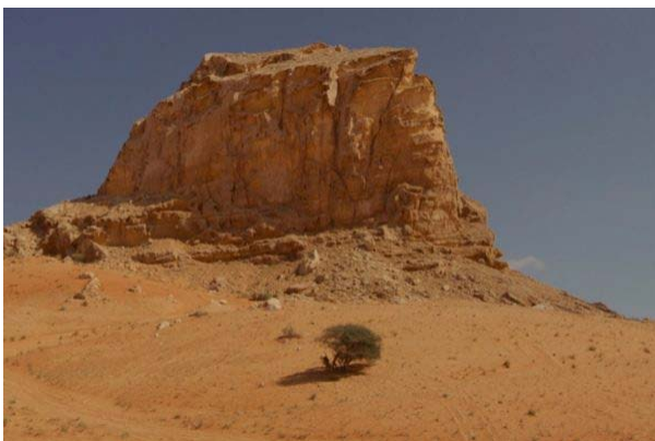
Artist's Garden: Samur by Zheng Bo