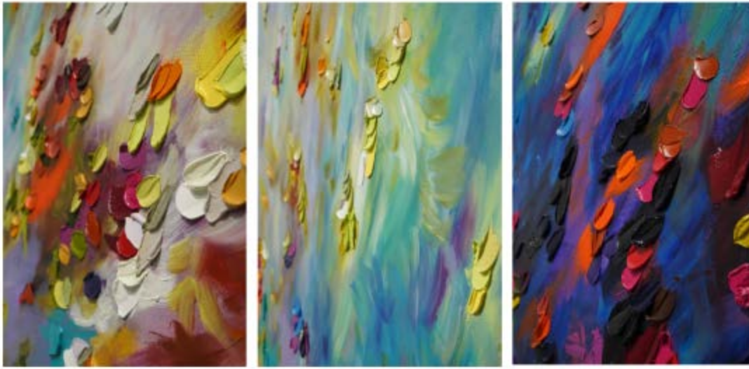
Ana D'Castro, Momentum series: "... na passagem...", 2021. "...passage...". Triptych. Oil on canvas. 600 X 200 cm.

Reza Aramesh (b. 1970, Teheran, Iran) is a visual artist who lives in London, the UK; he works in photography, sculpture, video, and performance. In his art pieces, he studies how conflicts and violence are reflected in the mass media around the world and reconstructs the related scenes.