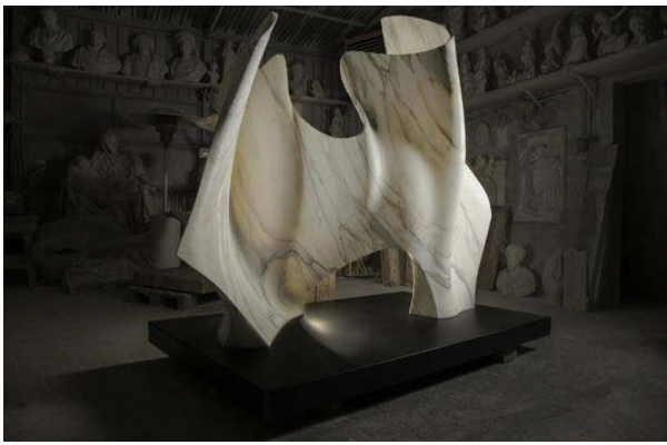
Roots and Reflections: A Journey through Time and Nature