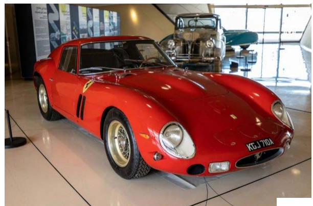
Qatar Auto Museum