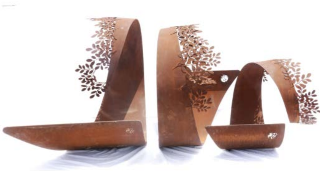
Azza Al Qubaisi, Between The Dunes (Dunes with dates) , 2022. Mild Steel with Dates leaves. 61 2/5 × 114 1/5 × 49 3/5 in | 156 × 290 × 126 cm.

Azza Al Qubaisi (b. 1978, Abu Dhabi, the UAE) is an Emirati jewellery artist, product designer, and sculptor famous for exploring and experimenting with metal and natural materials. Inspired by her heritage, she creates her art pieces using gold, silver, wood, rubber tyres, palm trees, and oud incense.