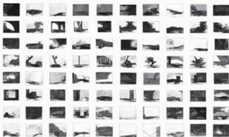
Farideh Lashai When I Count, There are Only You...But When I Look, There is Only a Shadow , 2012–2013 Price on Request