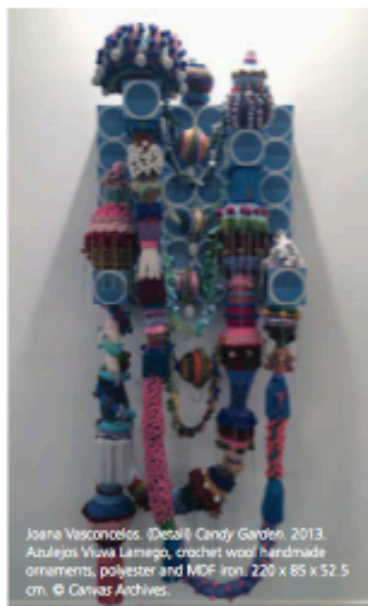
Joana Vasconcelos, (Detail) Candy Garden, 2013. Azulejos, Viva Lamego, crochet wool handmade ornaments, polyester and MDF iron. 220 x 85 x 52.5 cm.