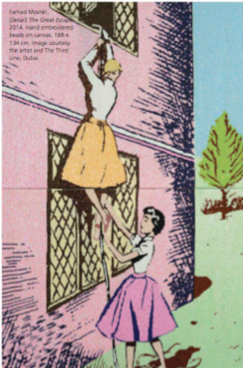
Farhad Moshiri. (Detail) The Great Escape 2014. Hand-embroidered beads on canvas. 188 x 134 cm.

19 MARCH 2014 | ISSUE 2 | ART DUBAI EDITION