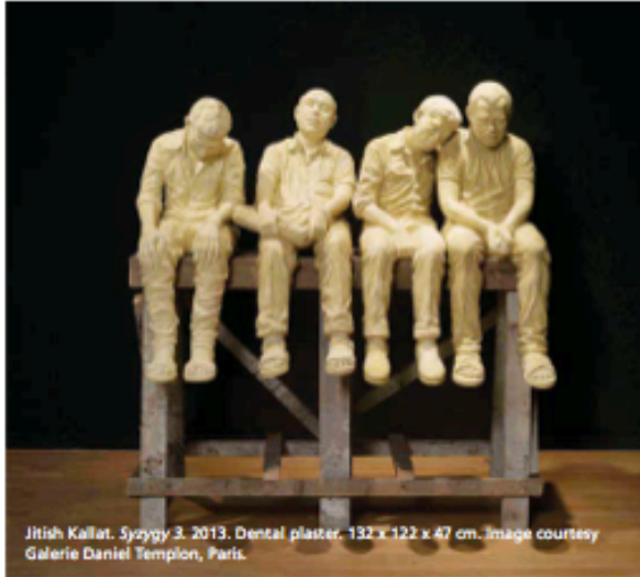
Jitish Kallat. Syzygy 3 . 2013. Dental plaster. 132 x 122 x 47 cm.