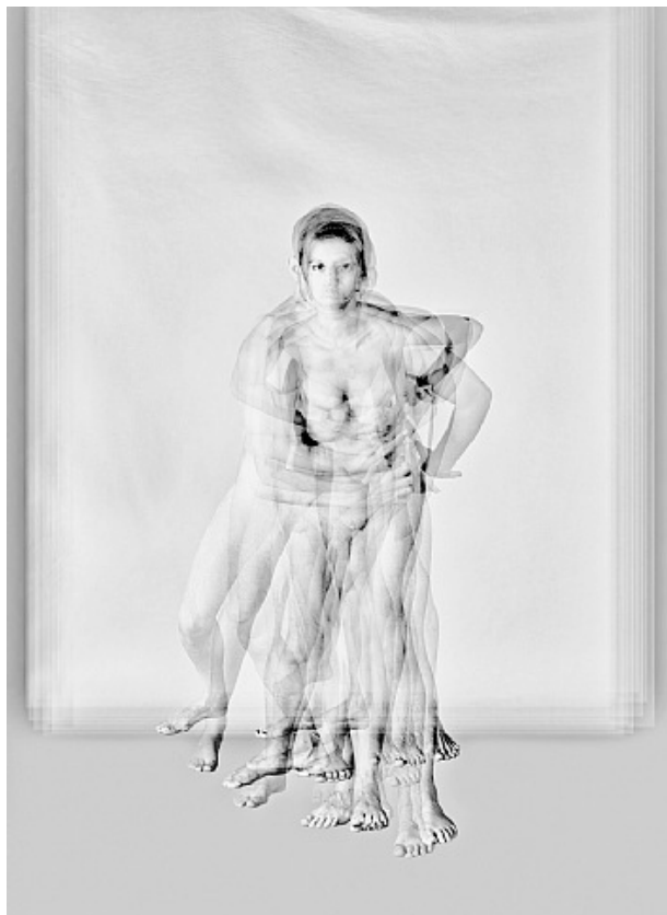
• Ahmet Elhan, Fragile 003 , 2013, chromogenic print, Galeri Zilberman, Istanbul, Turkey