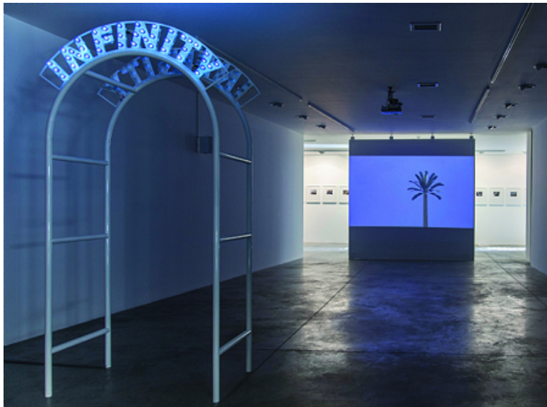
• Basim Magdy, Time Hole , 2012, steel, enamel, E14 TV blue light bulbs and electric wiring, artSümer, Istanbul, Turkey