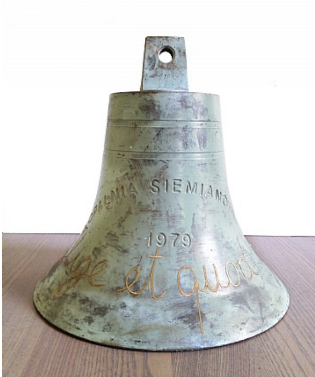
• Giovanni Ozzola, Untitled , 2013, bell with handwritten text, Gazelli Art House, London, UK