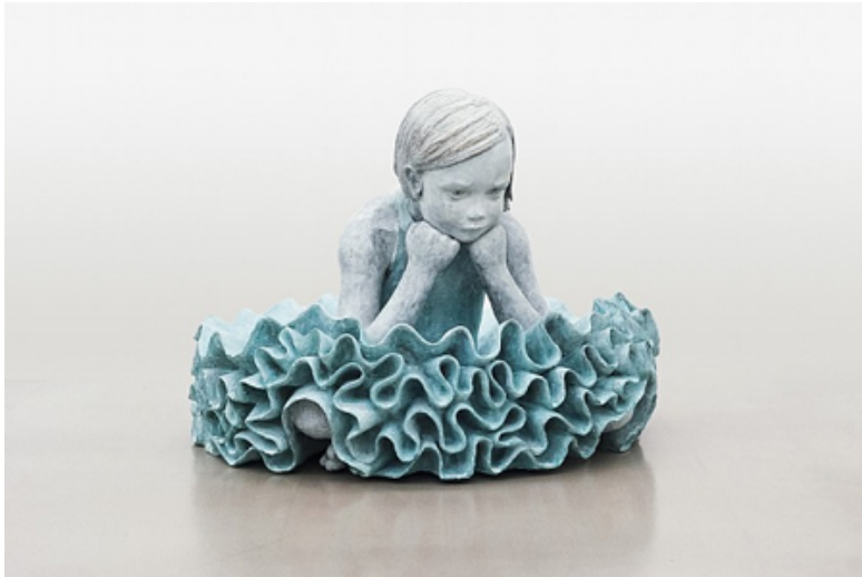
• Assa Kauppi, In Search of a Winner , 2013, patinated bronze, Galleri Andersson/Sandström, Stockholm, Sweden