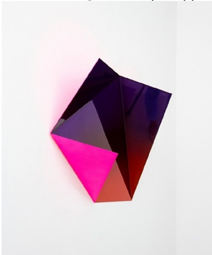
• Rana Begum, No. 438—Fold , 2013, paint on mirror finish steel, BISCHOFF/WEISS, London, UK