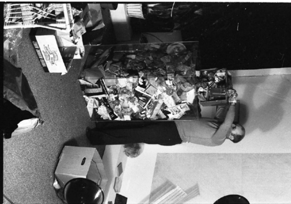
Archival photograph of Bernar Venet collaborating in the creation of La Poubelle de Bernar Venet , 1971