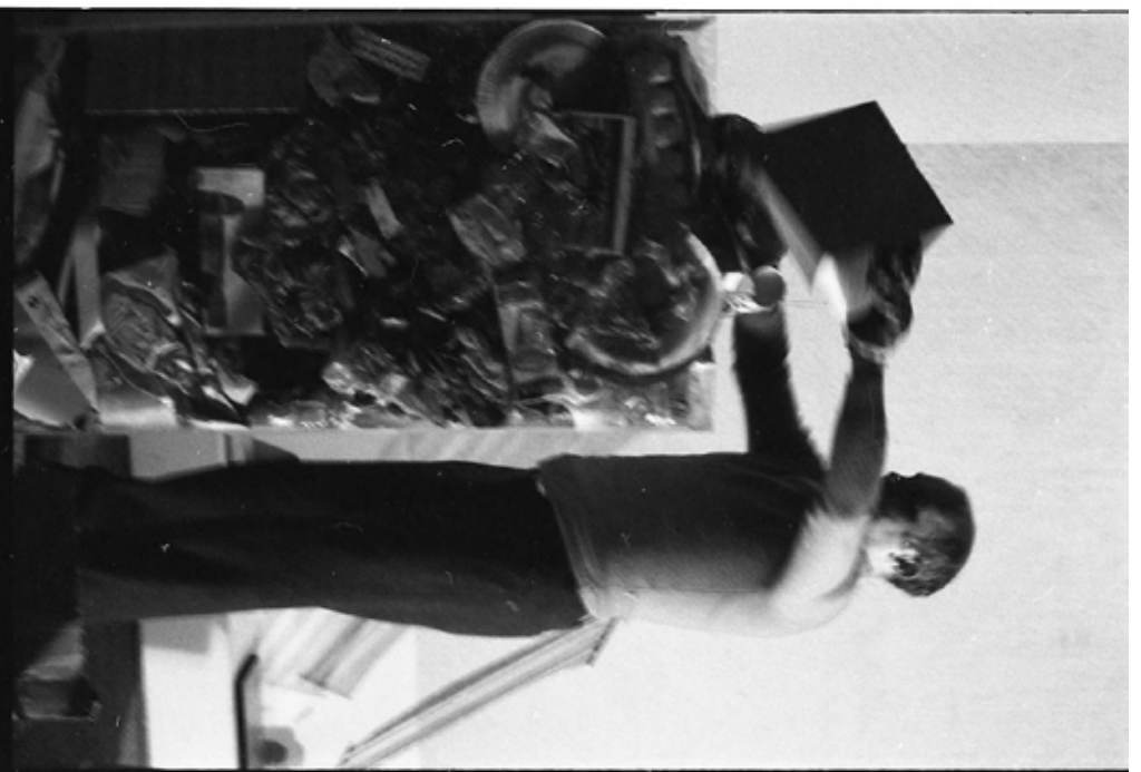
Archival photograph of Bernar Venet collaborating in the creation of La Poubelle de Bernar Venet , 1971