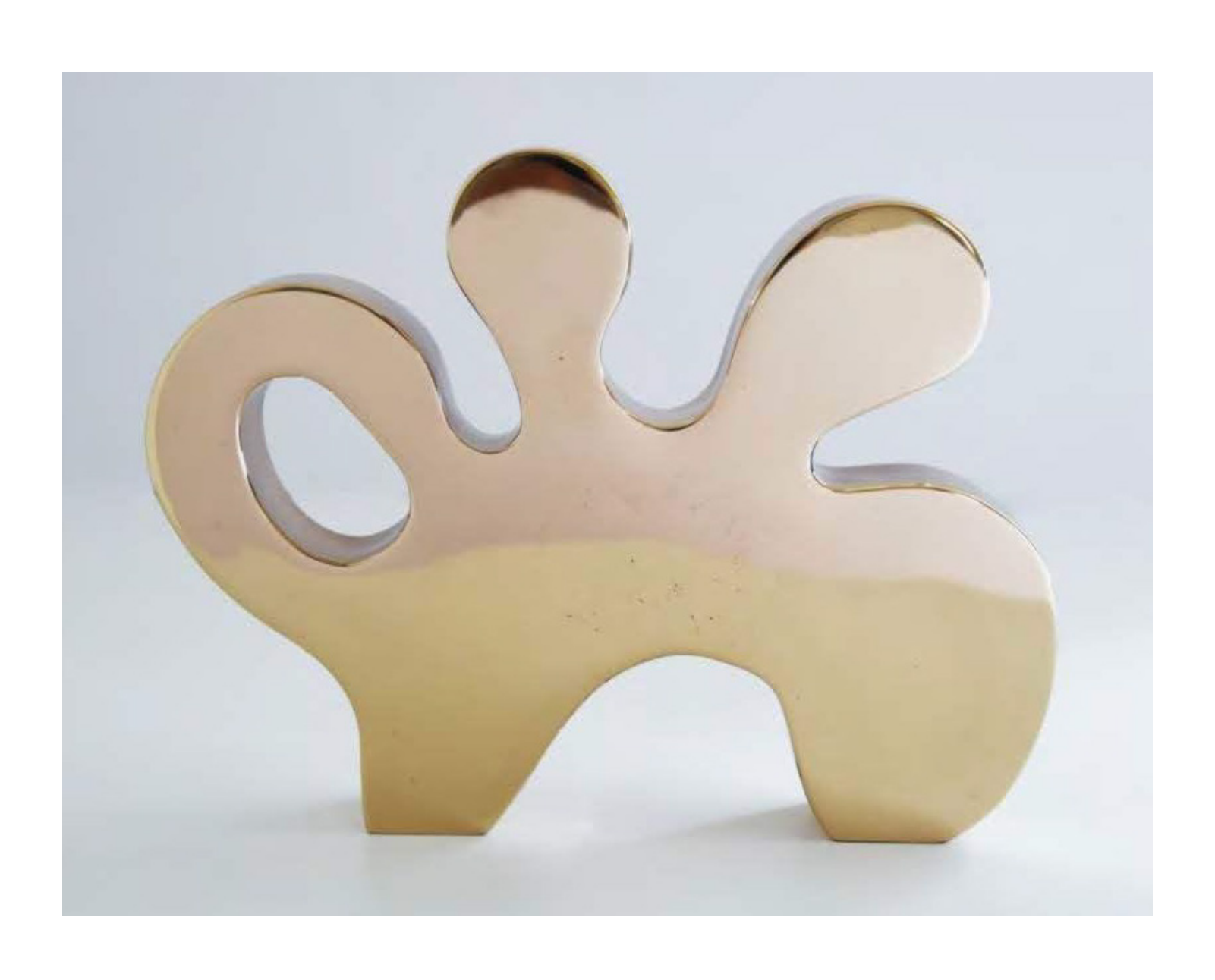
Puzzle II Polished Bronze 12 x 16 x 2 in