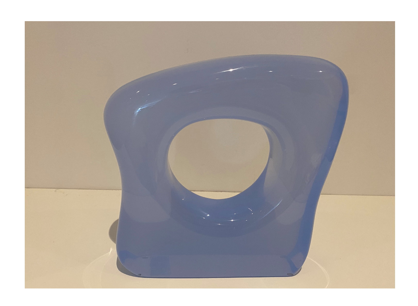
Bone Form I French Blue Lucite 10.5 x 10 x 3 in