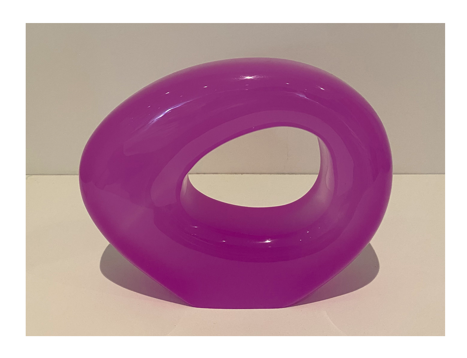
Eye II Fuschia Lucite 8.5 x 10.5 x 3 in