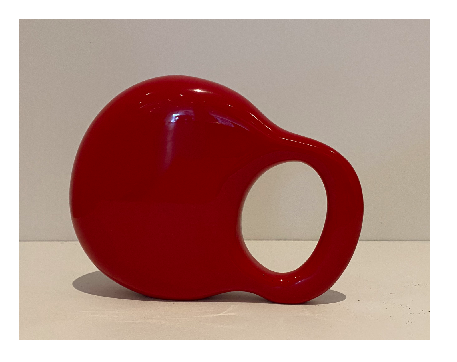
Ghost Gold Leaf over Wood 10 x 12.5 x 3 in