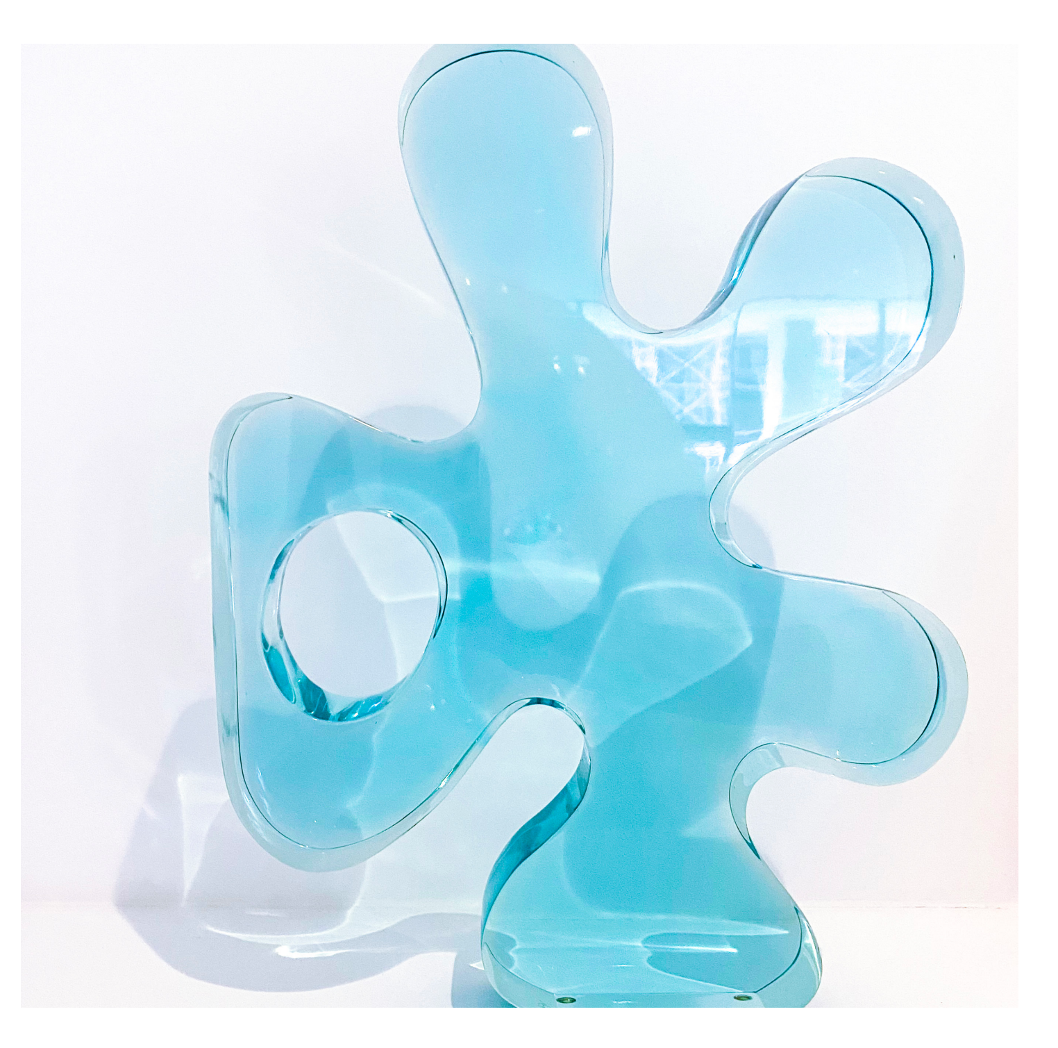
Puzzle I Willow Green 14.5 x 11 x 1.8 in