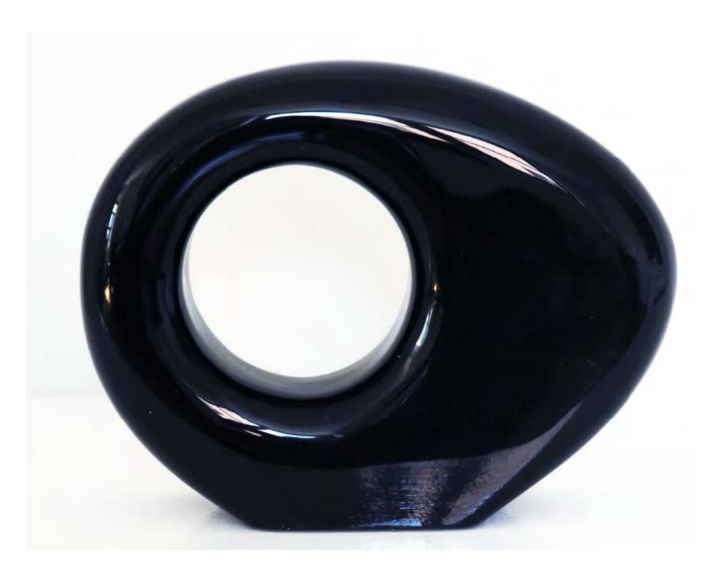
Eggplomb Black Lucite 9 x 5 x 3 in