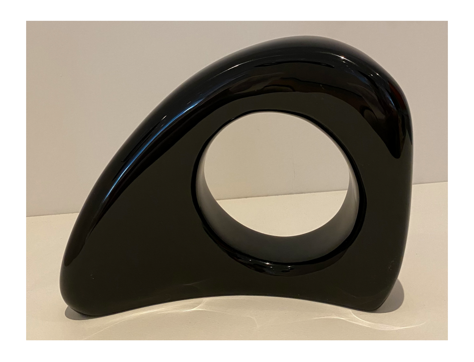
Ghost Black Lucite 6.5 x 7.5 x 2 in