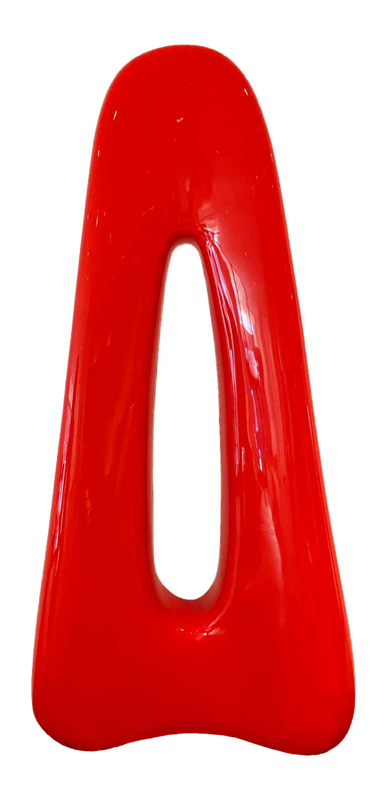
They, 2020 Red Enamel on Fiberglass 80 x 30 x 15 in