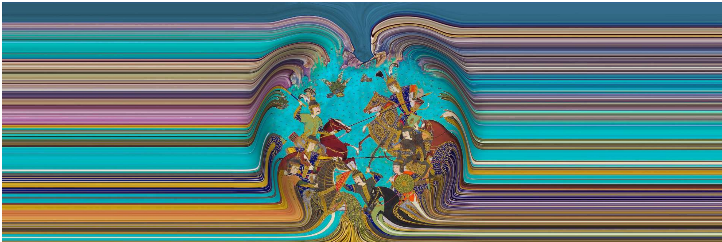
The Fifth Joust of the Rooks Ruhham Versus Barma (Book of Kings) of Shah Tahmasp 2022 Oil on canvas 150 X 450 cm