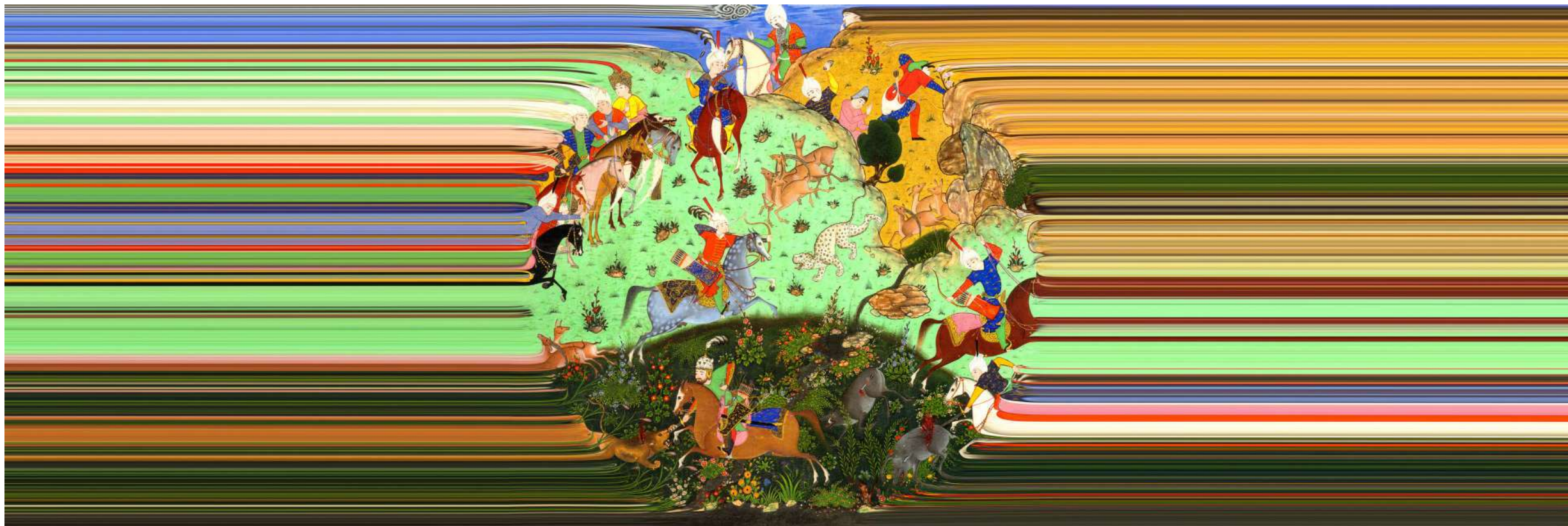
Rustam and the Seven Champions of Iran Hunt in Turan 2022 Oil on canvas 150 X 450 cm