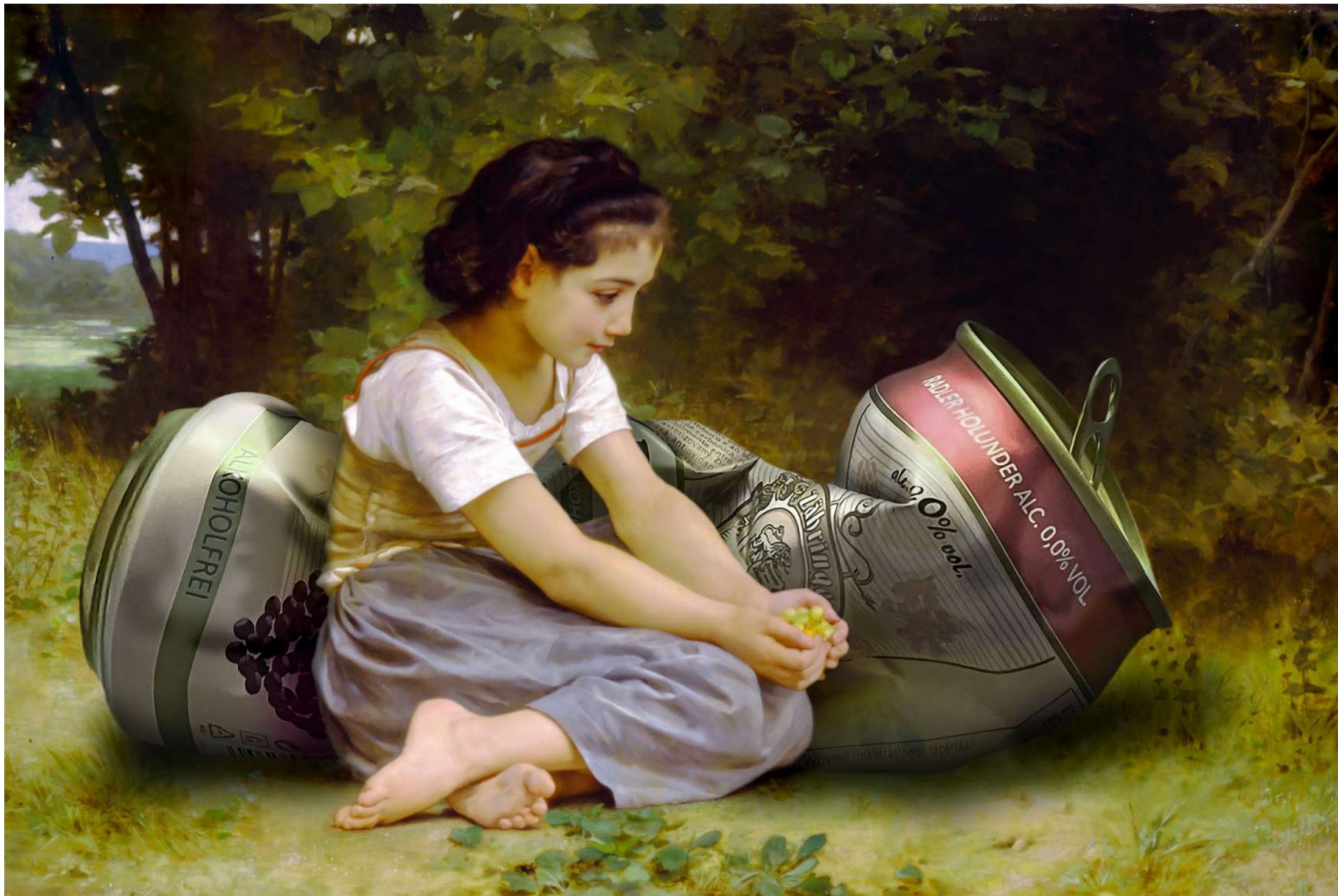
The Nut Gatherers 2022 Oil on canvas 150 X 120 cm