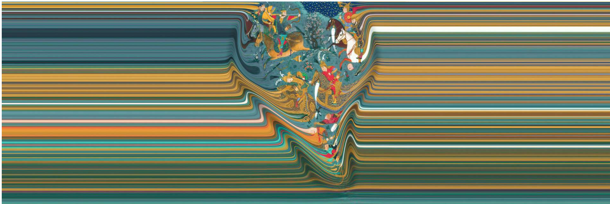
Bizhan Slays Nasiban and Stems the Turanin Night 2 2022 Oil on canvas 150 X 450 cm