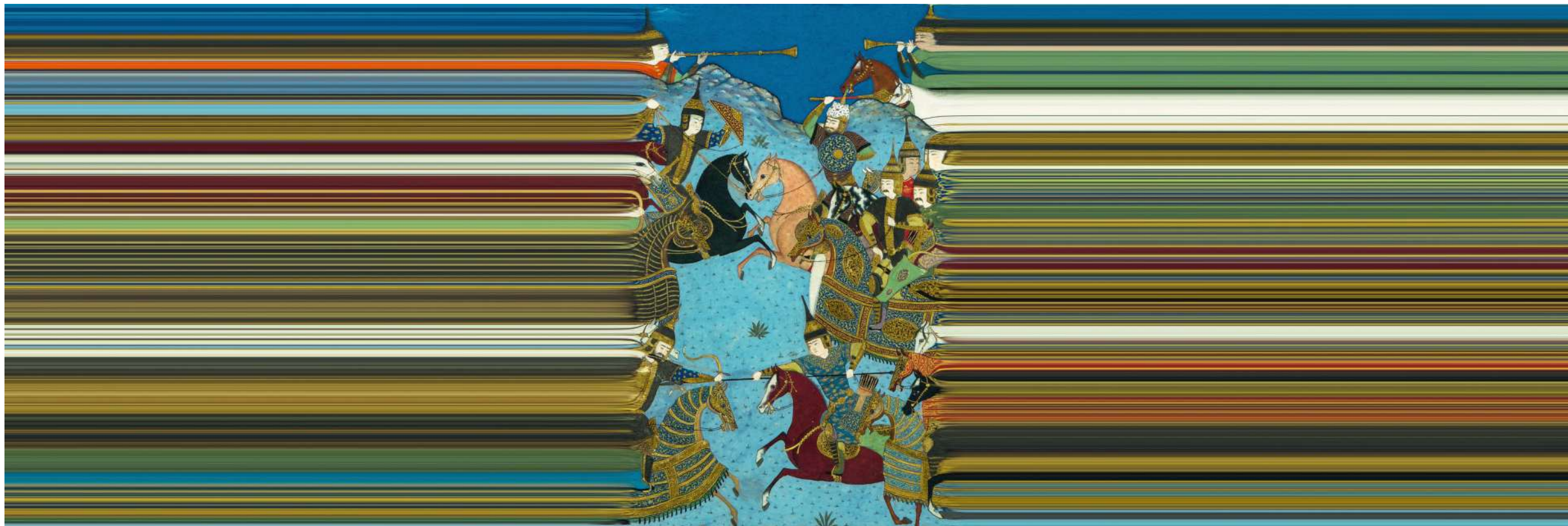
The Night Battle of Kay Khusran and Afrasiyab 2022 Oil on canvas 150 X 450 cm