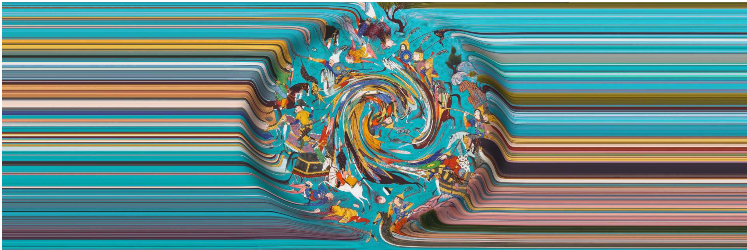
The Iranian on Mount Hamavan Attack by night 2022 Oil on canvas 150 X 450 cm