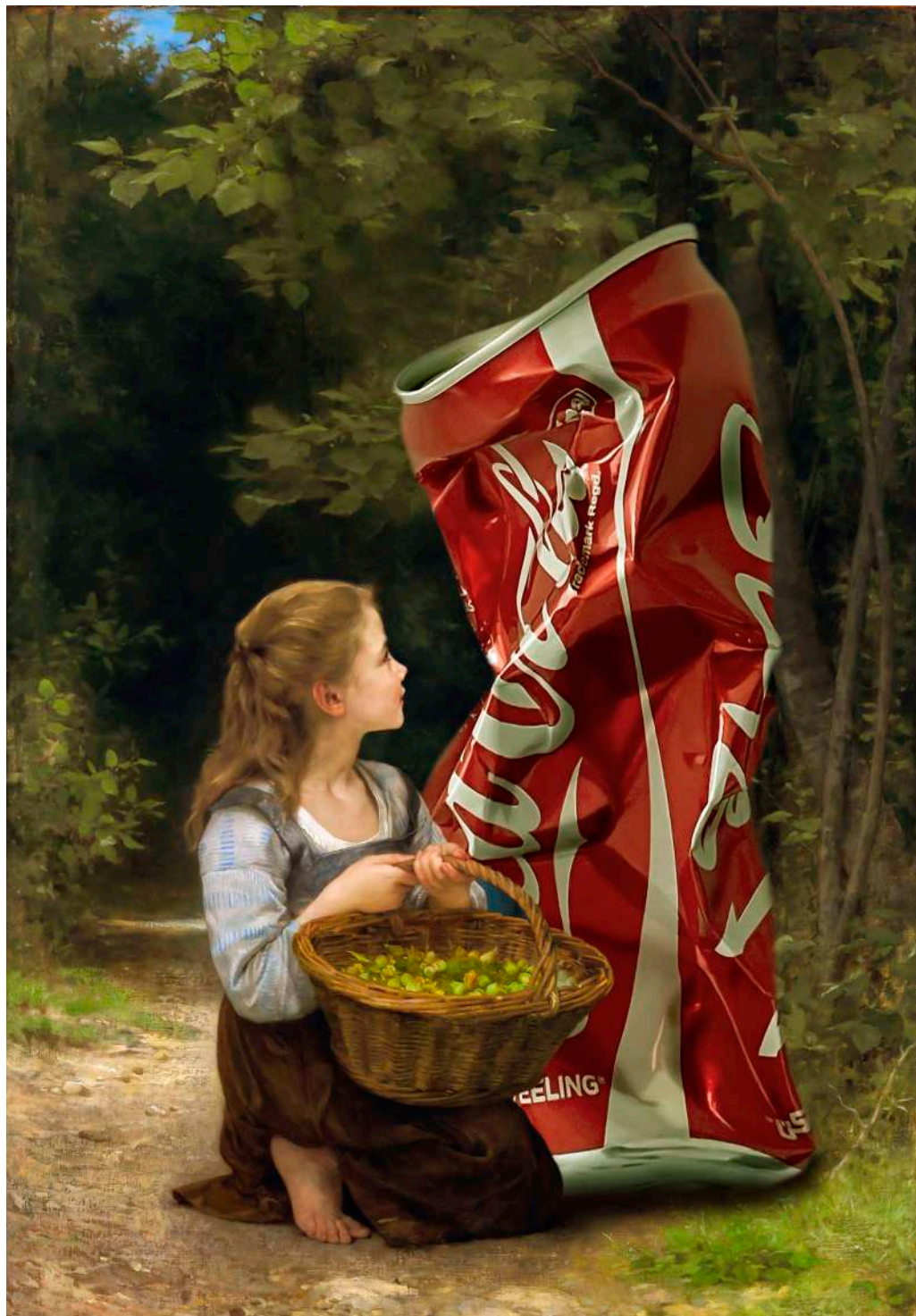
Recolte de noisettes 2022 Oil on canvas 180 X 125 cm