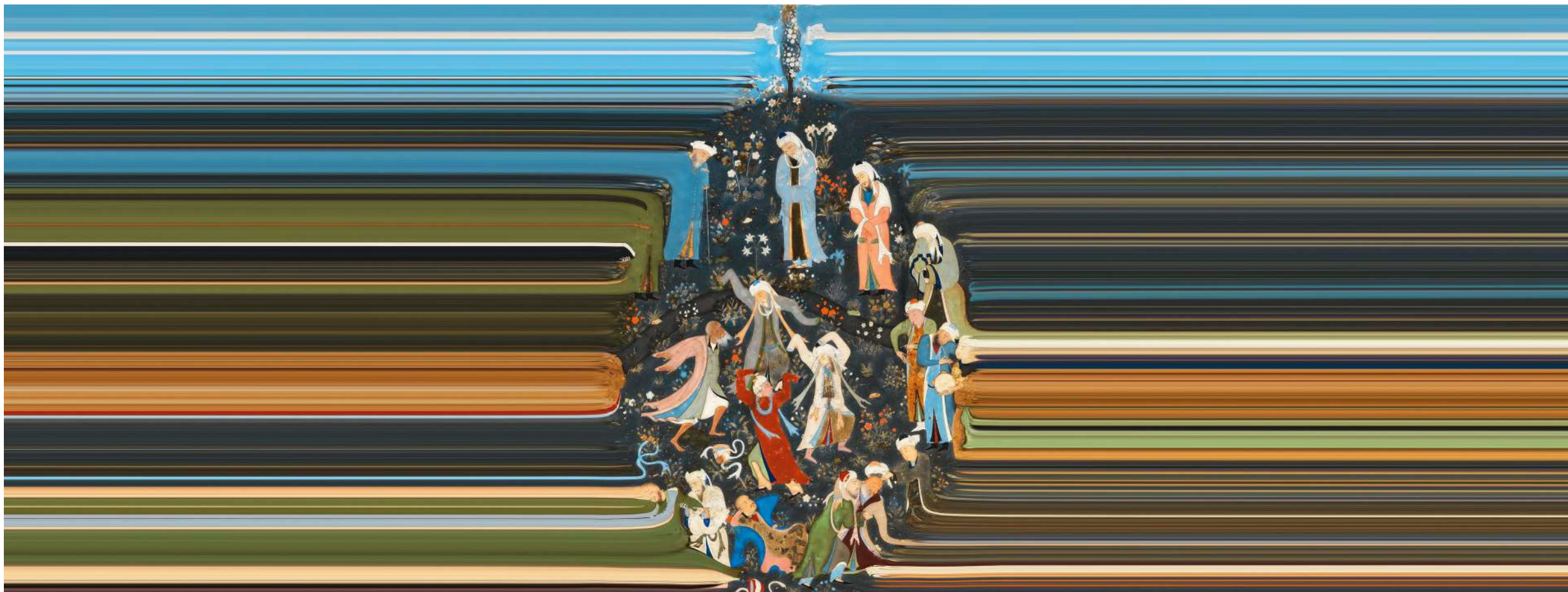
Dance of Sufi 2022 Oil on canvas 150 X 450 cm