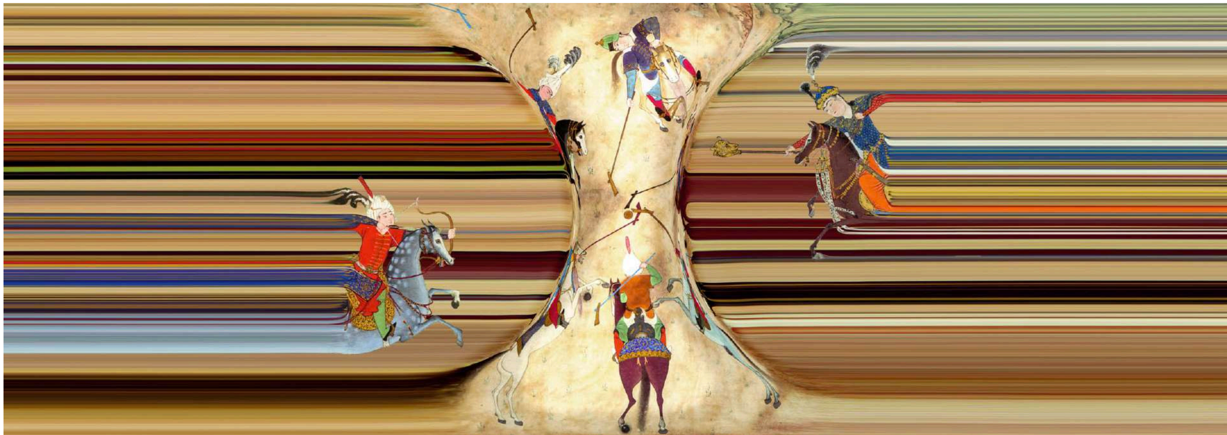
Polo players 2022 Oil on canvas 150 X 350 cm