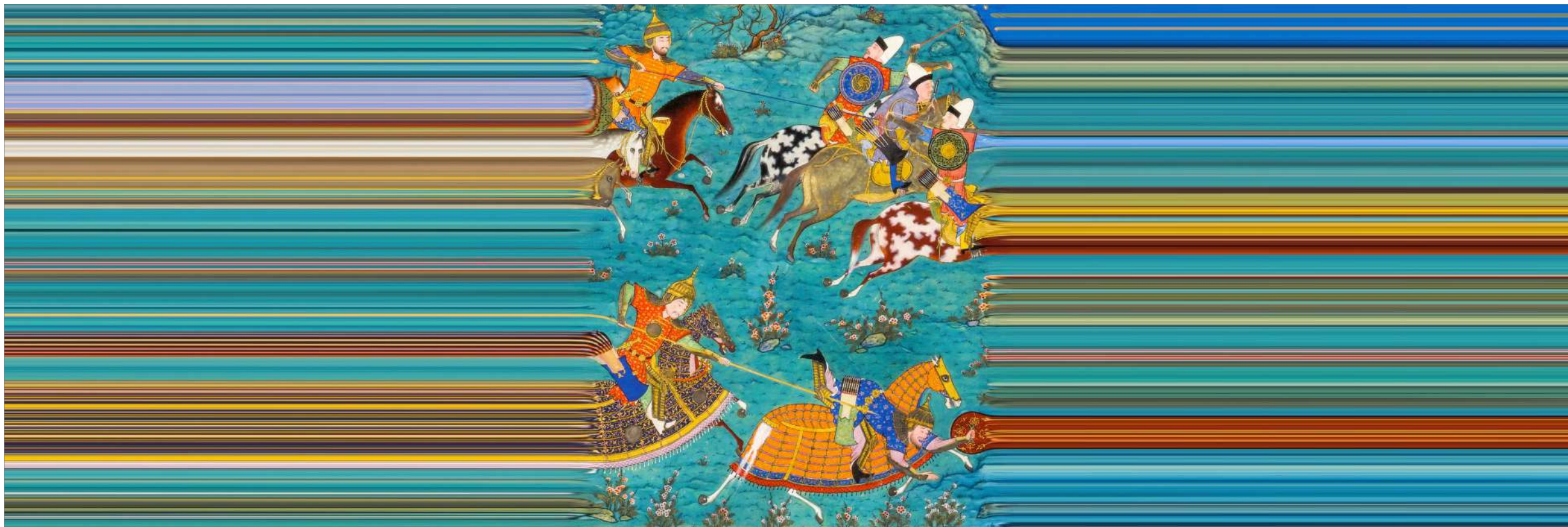
Qaran Slays Barman 2022 Oil on canvas 150 X 350 cm