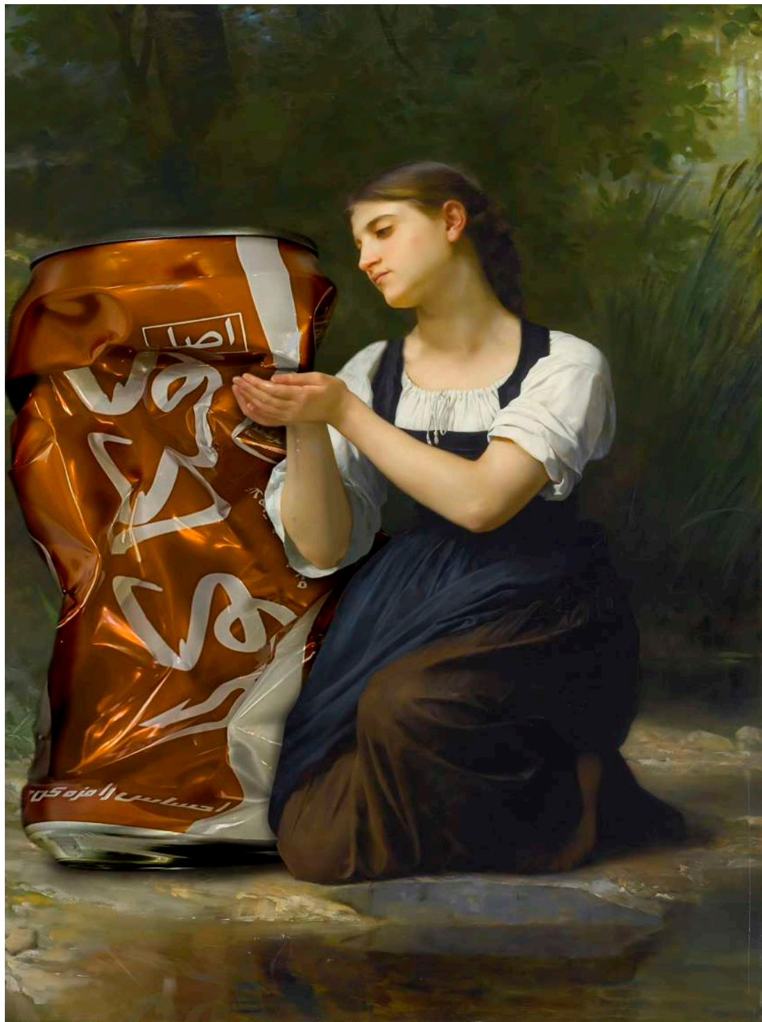
Recolte de noisettes 2022 Oil on canvas 180 X 125 cm