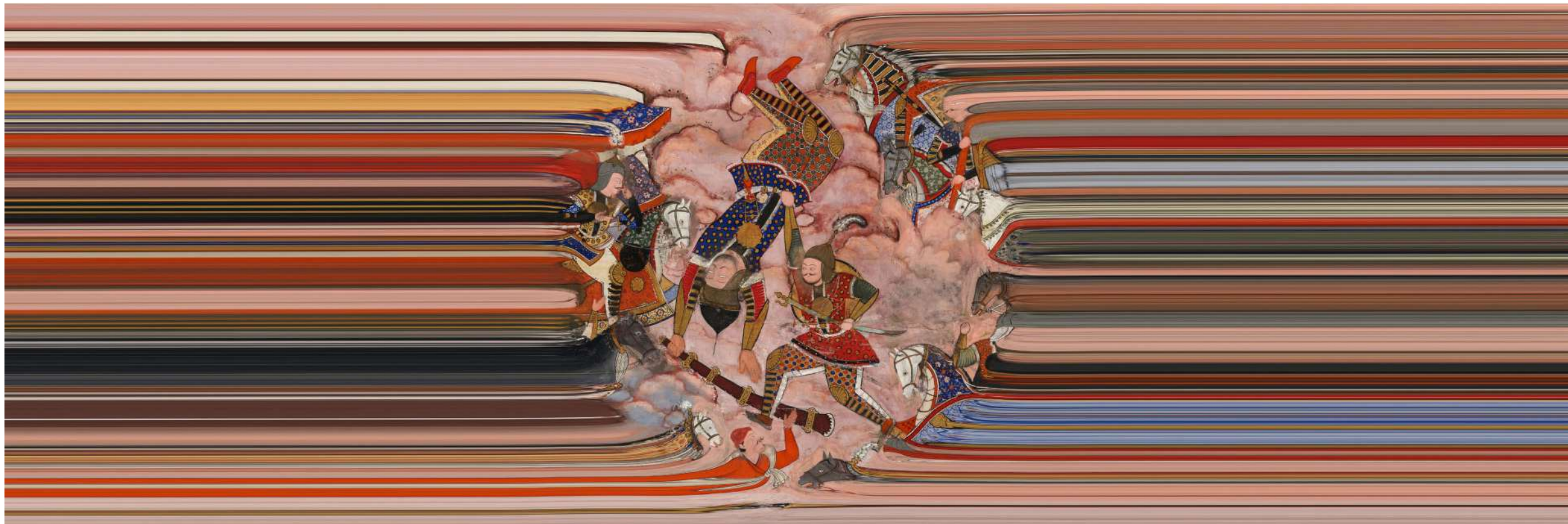
The Battle of Mazandaran 2022 Oil on canvas 150 X 350 cm