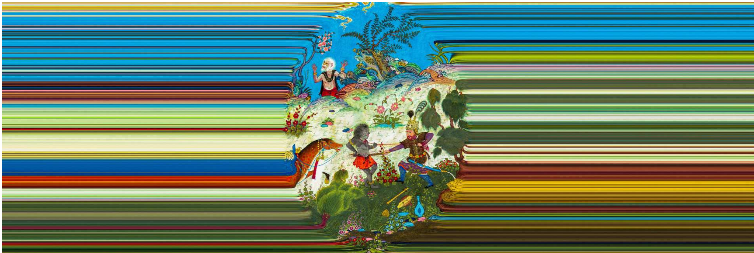
Rustam's Fourth Cours, He cleaves a Witch 2022 Oil on canvas 150 X 350 cm