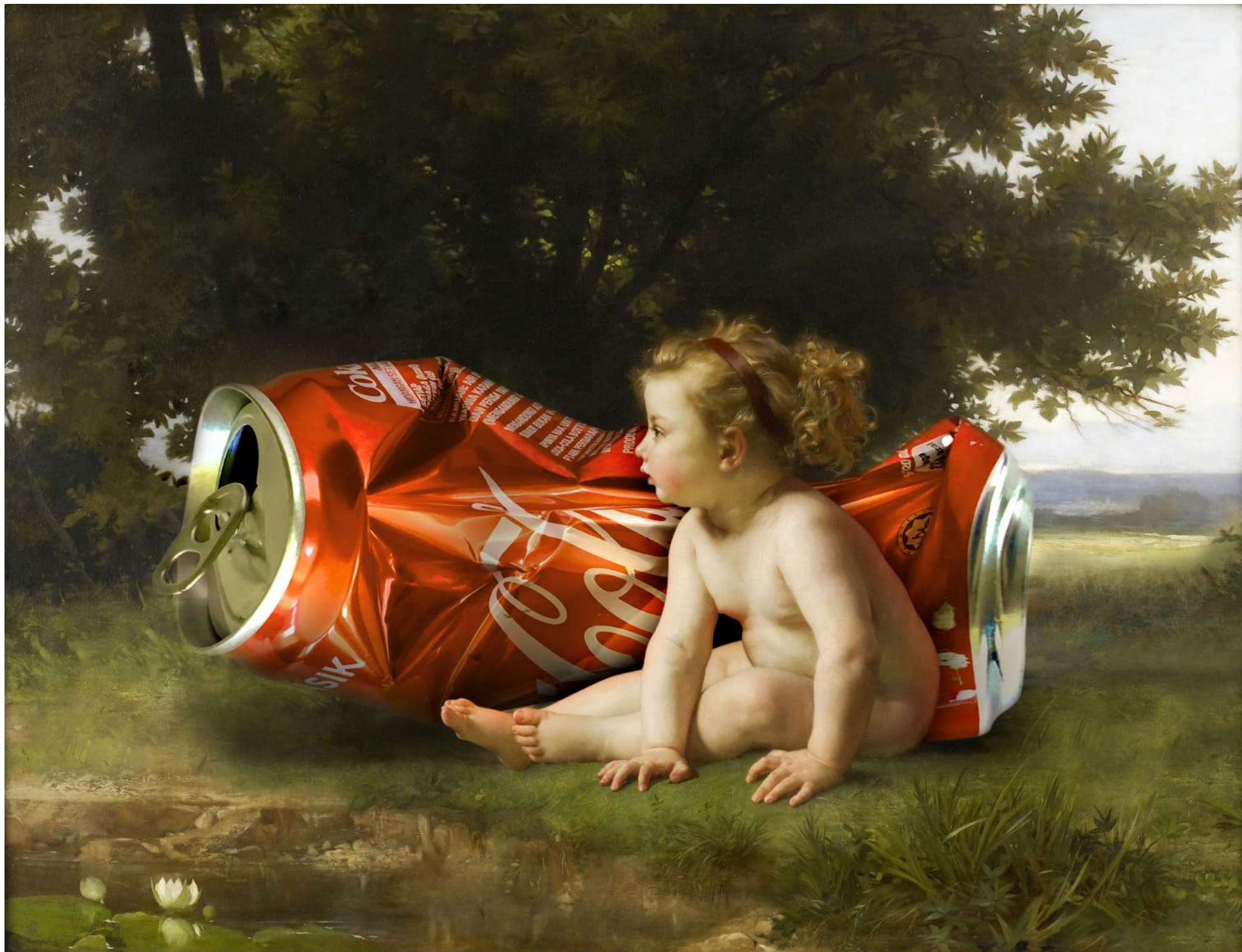
Temptation 2022 Oil on canvas 150 X 134 cm