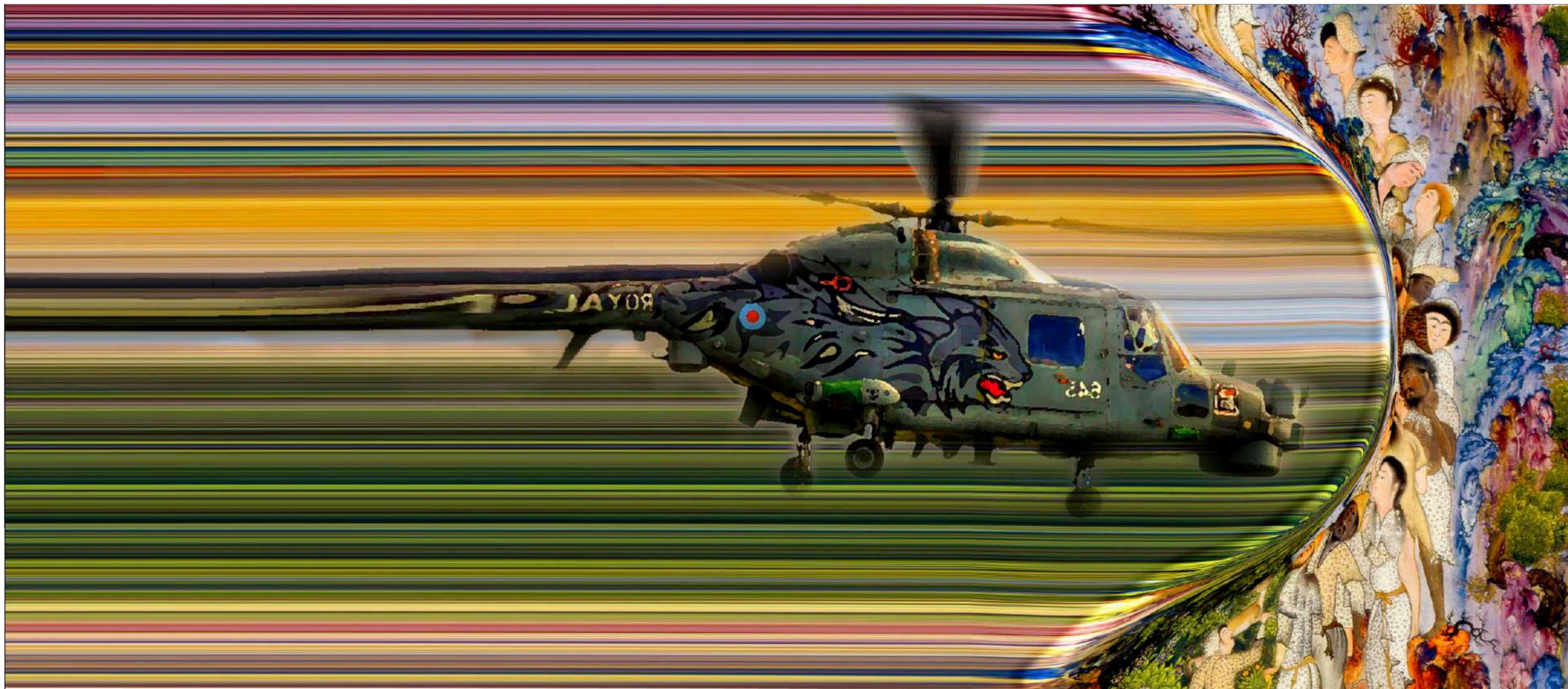
Towards Peace 2022 Oil on canvas 150 X 350 cm