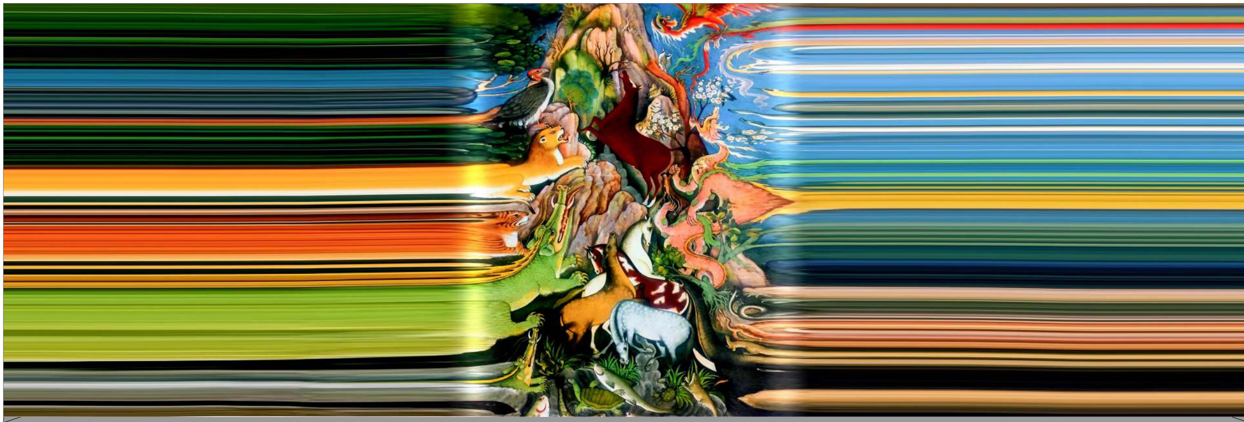
The Canticle of Birds 2022 Oil on canvas 150 X 450 cm