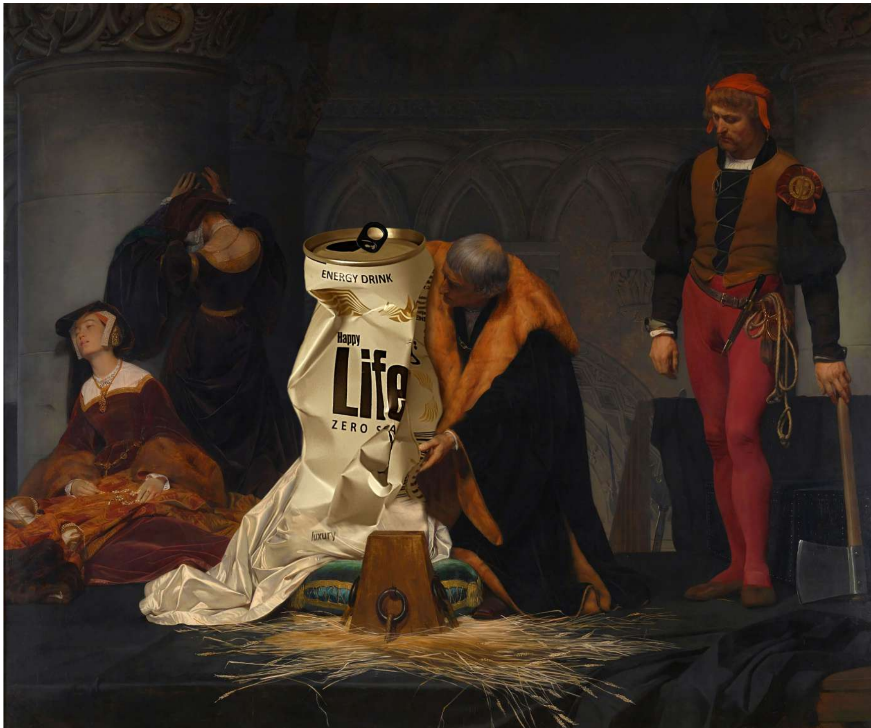
Ejecución de Lady Jane Grey 2022 Oil on canvas 170 X 200 cm