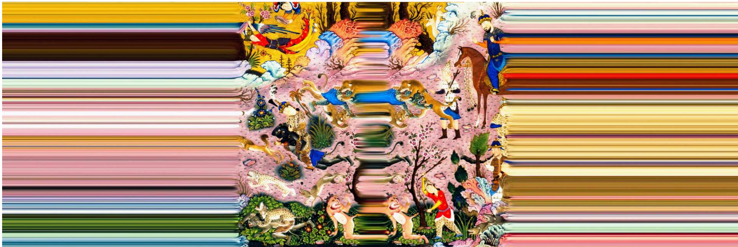
Hushang Slays Black Div 2022 Oil on canvas 150 X 450 cm