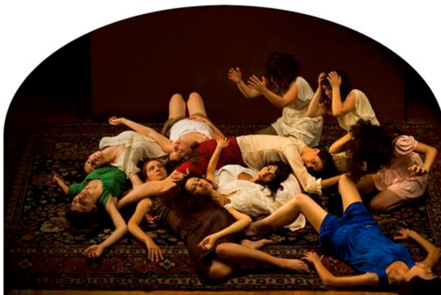
Nazif Topçuoğlu, Lamentations , 2007 Lambda print, 45.3 x 68.1 in / 115 x 173 cm

Symposium at Sotheby's, Thursday, June 3, 5:30 to 7:30 p.m.