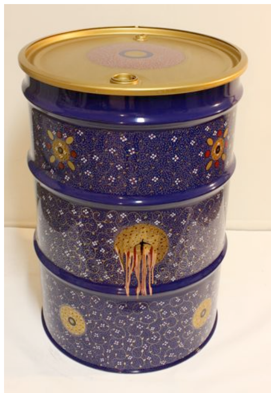
Oil Barrel #9 , 2009. Oil on steel, 24½ x 34½ x 23½ in. (59.7 x 87.6 x 59.7 cm)

In Hocus Pocus , 2009, a large mixed media painting, Ahmadi creates a lyrical yet riotous action-packed universe populated by elephants, camels, monkeys, snakes and birds. Another smaller painting, Green Veil #1 , 2009, depicts a woman enveloped in a green patterned fabric with a sense of serenity that seems to be misplaced. One of the large oil barrels is painted a royal blue with Persian motifs and a gold medallion with a tiny figure that appears to be standing amidst streams of blood.