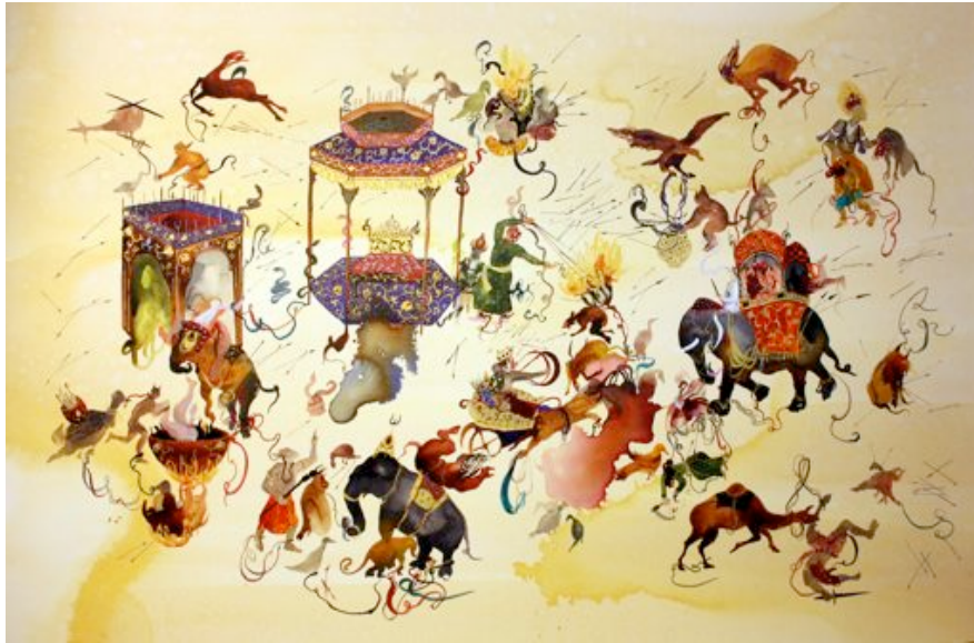
Hocus-Pocus , 2009. Mixed media on aqua board, 40 x 60 in. (101.6 x 152.4 cm)

New York, NY – An exhibition of new paintings and sculpture by Shiva Ahmadi will be on view from February 4 through 27, 2010, at Leila Taghinia-Milani Heller (LTMH) Gallery. Ahmadi has created a dynamic visual language inspired by Persian miniatures and Islamic art and architecture that she uses to explore social and political issues affecting both the Middle East and the West.