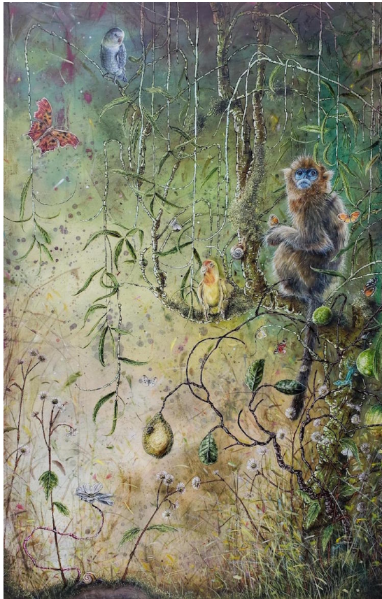
"under the willows"