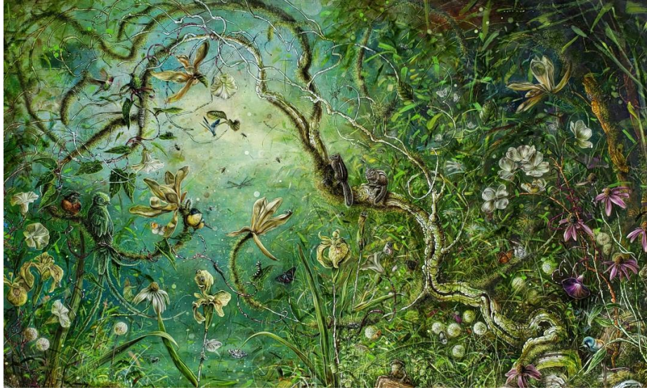
"a gardens revolution"