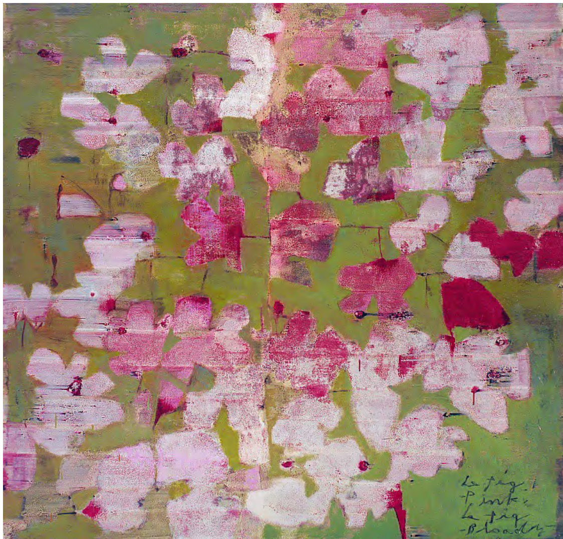
Reza Derakshani Le Fig Pink Le Fig Green , 2016 Oil and Tar on Canvas 66.14 x 70.08 in, 168 x 178 cm $ 70,000.00