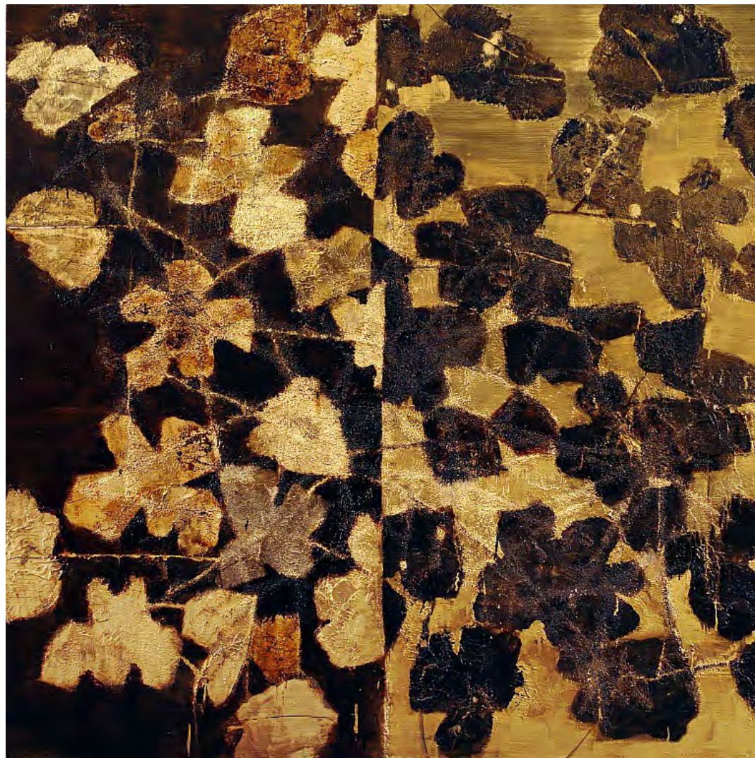
Reza Derakshani Every Gold Day and the Dark Night, 2018 Oil and Tar on Canvas 70.08 x 70.08 in, 178 x 178 cm $ 80,000.00