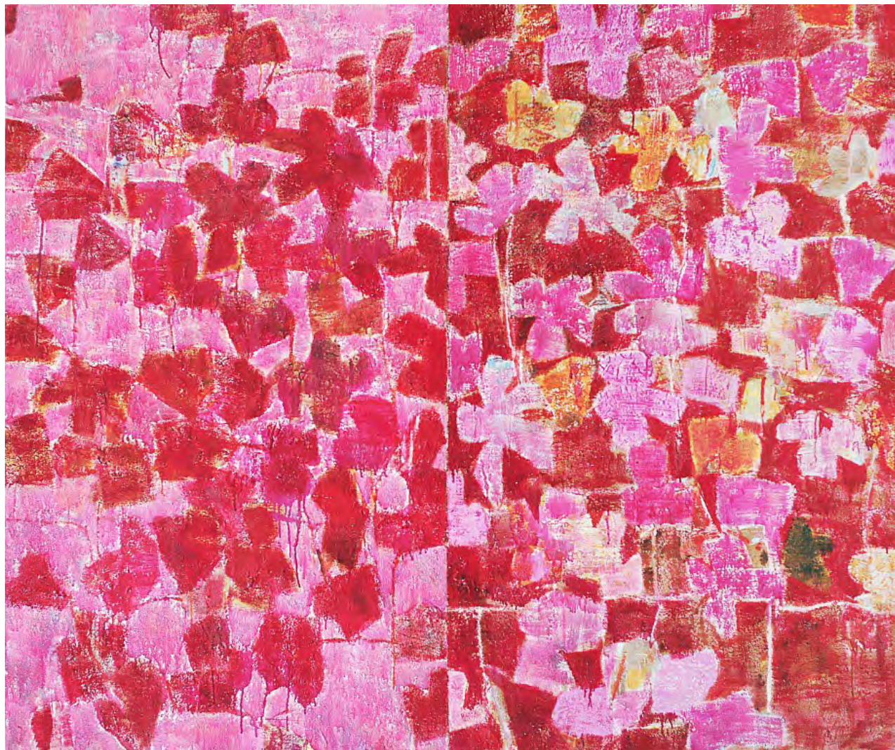
Reza Derakshani Pink Days and Nites , 2016 Oil on Canvas 60.24 x 72.05 in, 153 x 183 cm $ 65,000.00