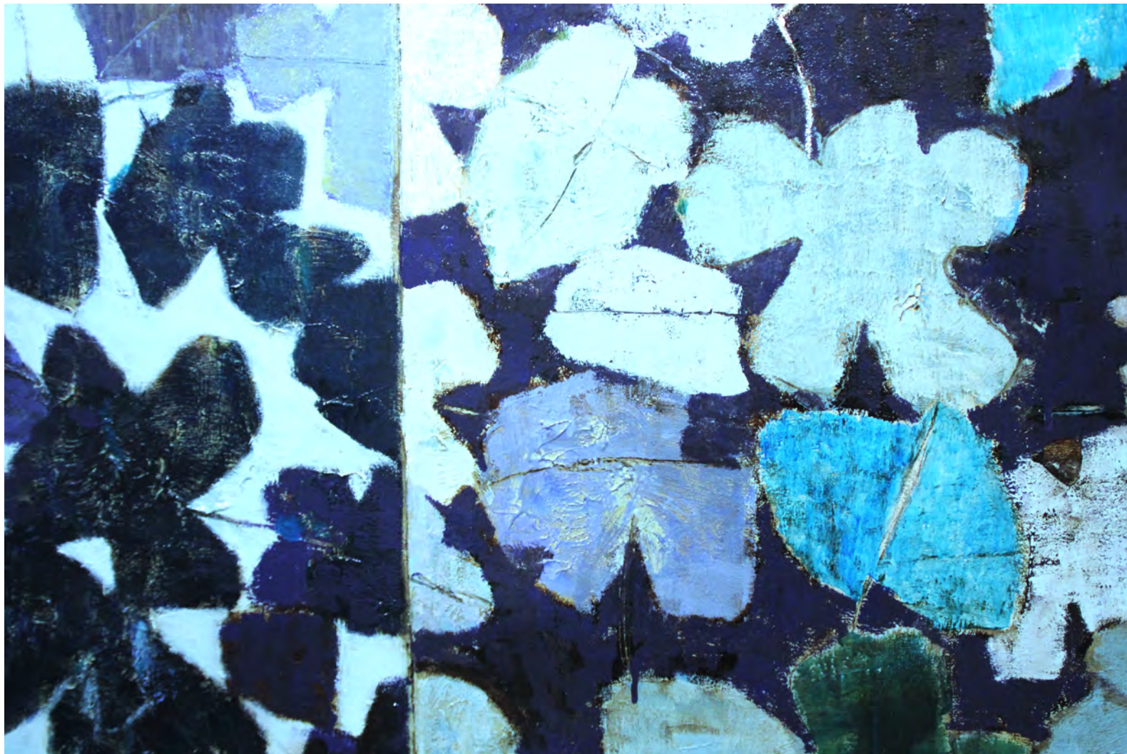
Detail shot of Every Blue Day Night