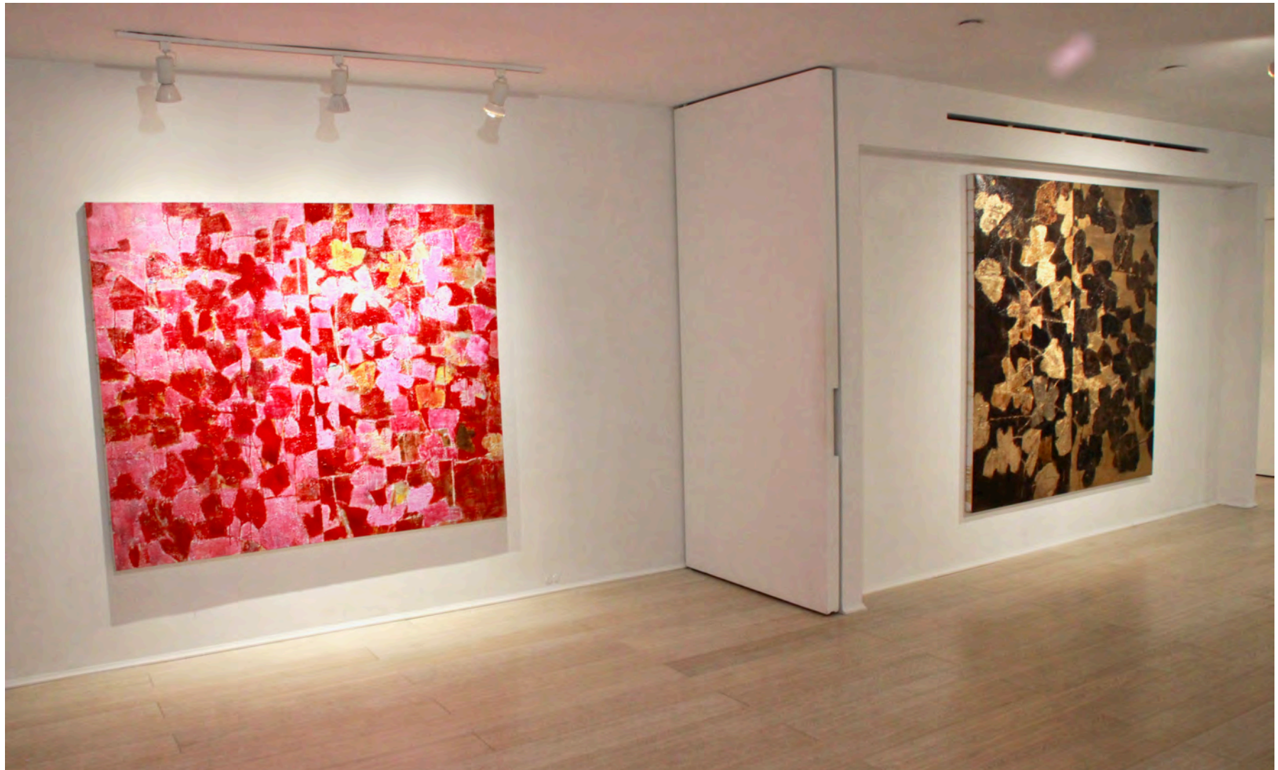
Installation View The Shadow of a Fig Tree Quiets My Soul