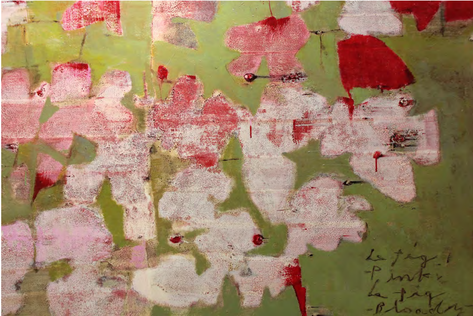
Detail shot of Le Fig Pink Le Fig Green