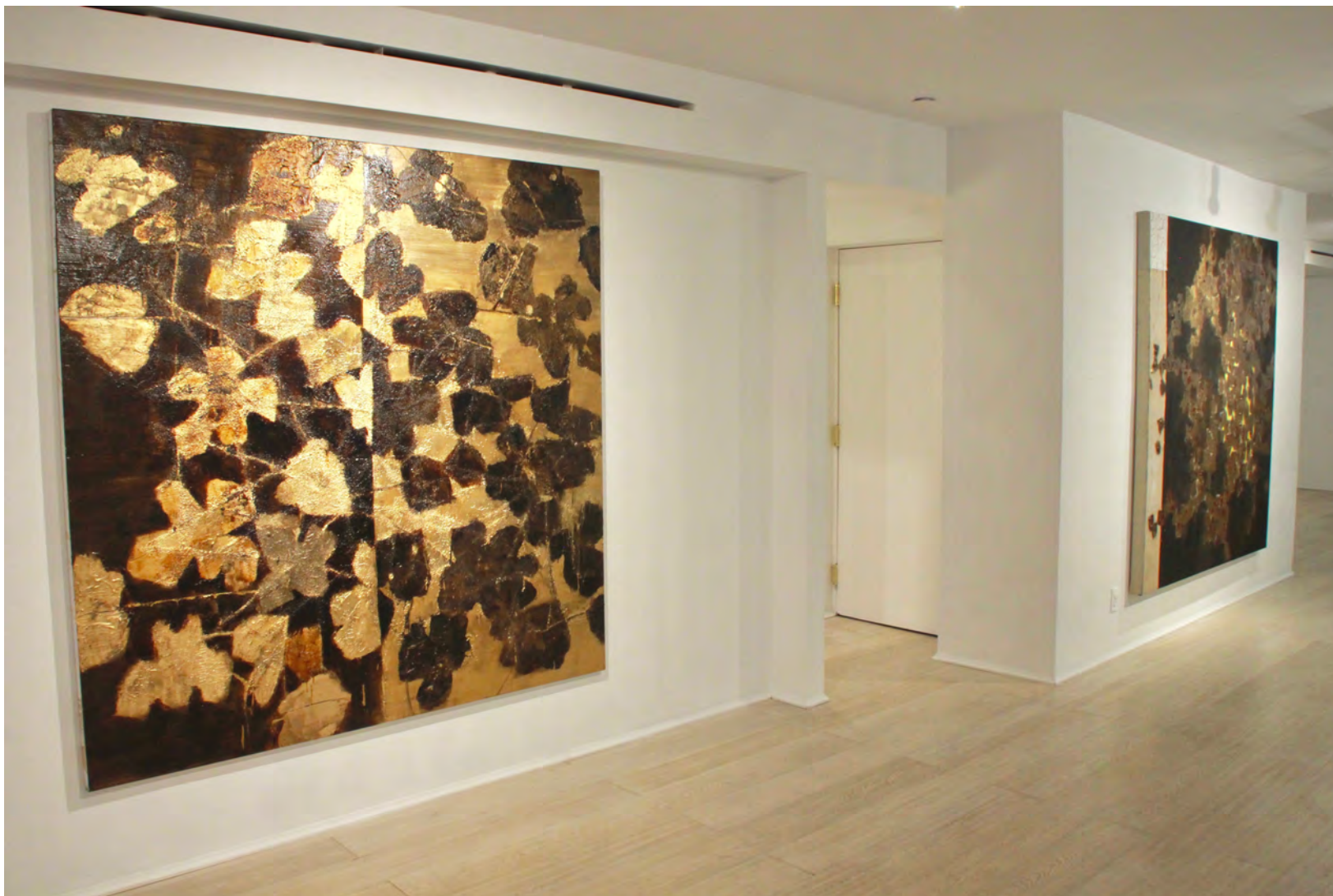
Installation View The Shadow of a Fig Tree Quiets My Soul