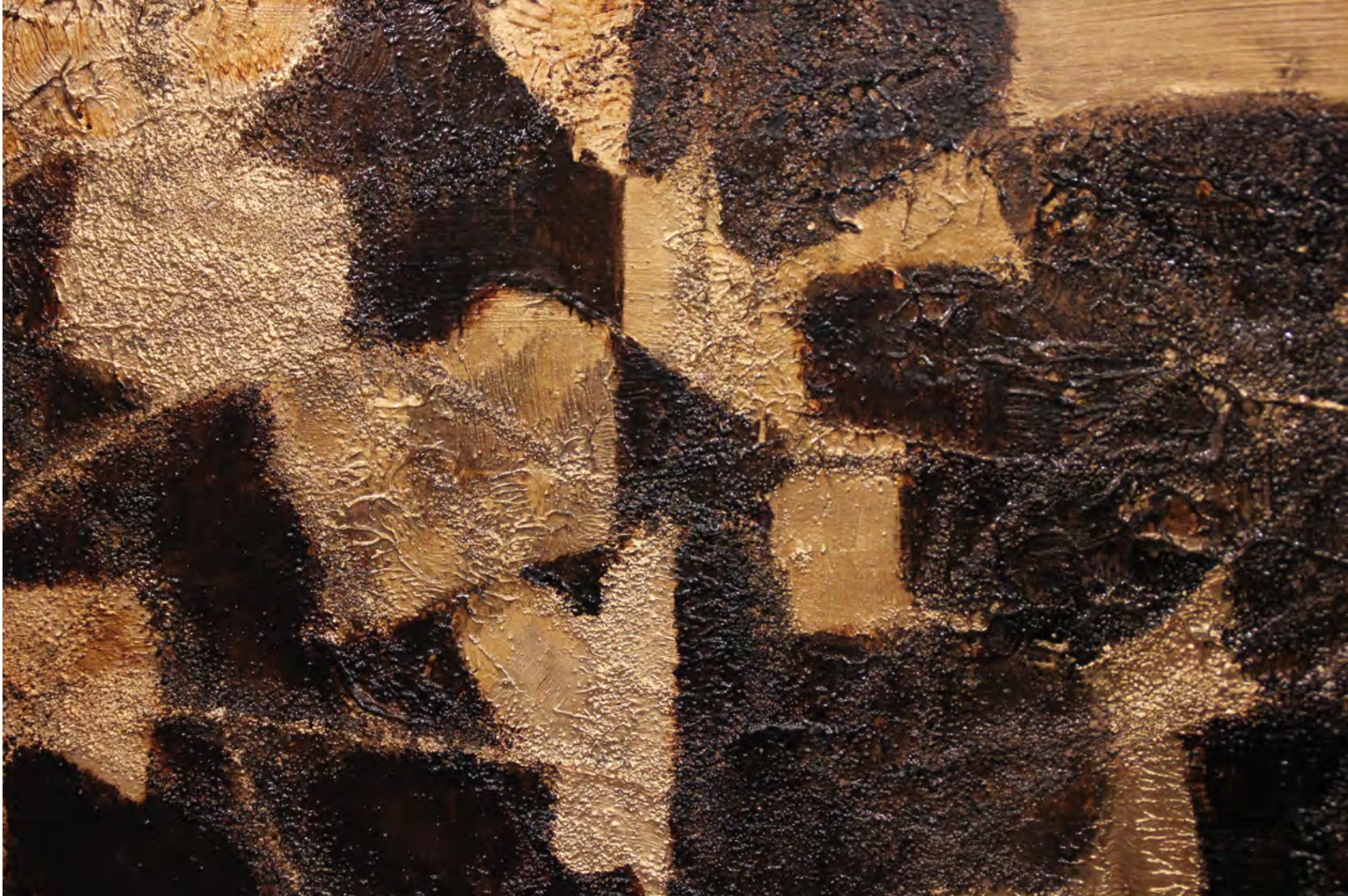
Detail shot of Every Gold Day and the Dark Night