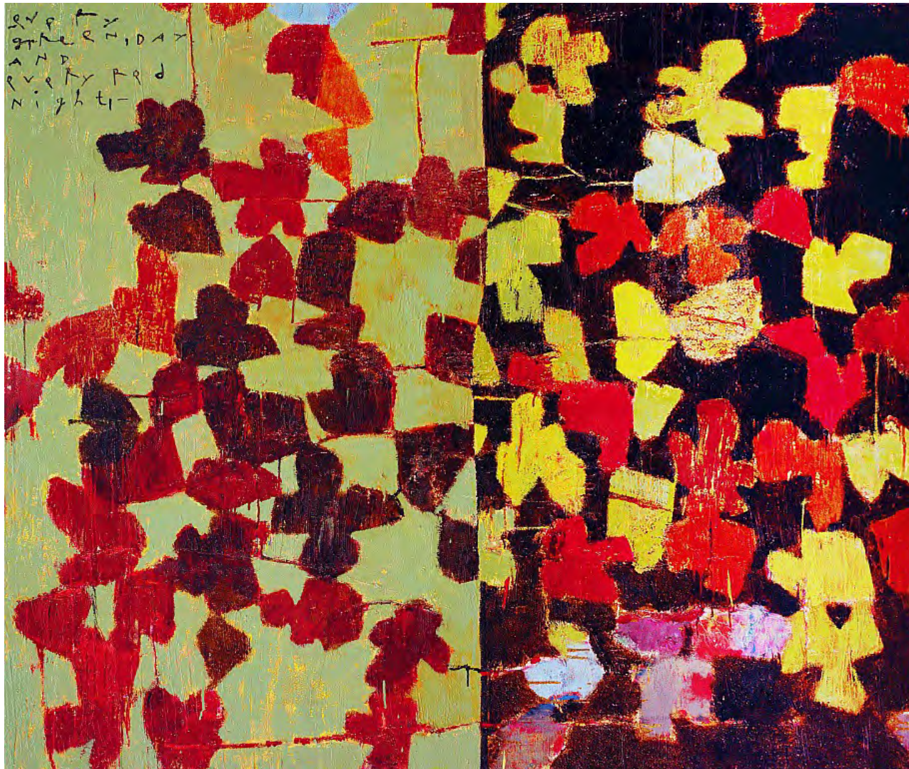
Reza Derakshani Every Green Day and Every Red Night , 2010 Oil and Tar on Canvas 59.84 x 72.05 in, 152 x 183 cm $ 65,000.00