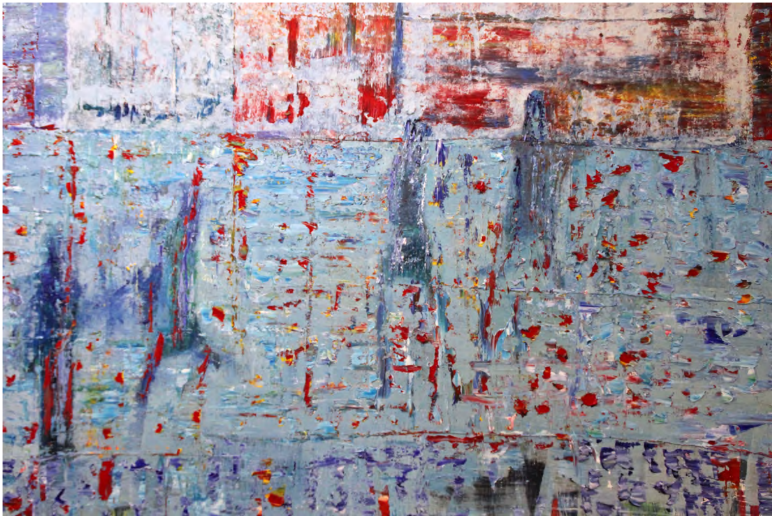
Detail Morning Party