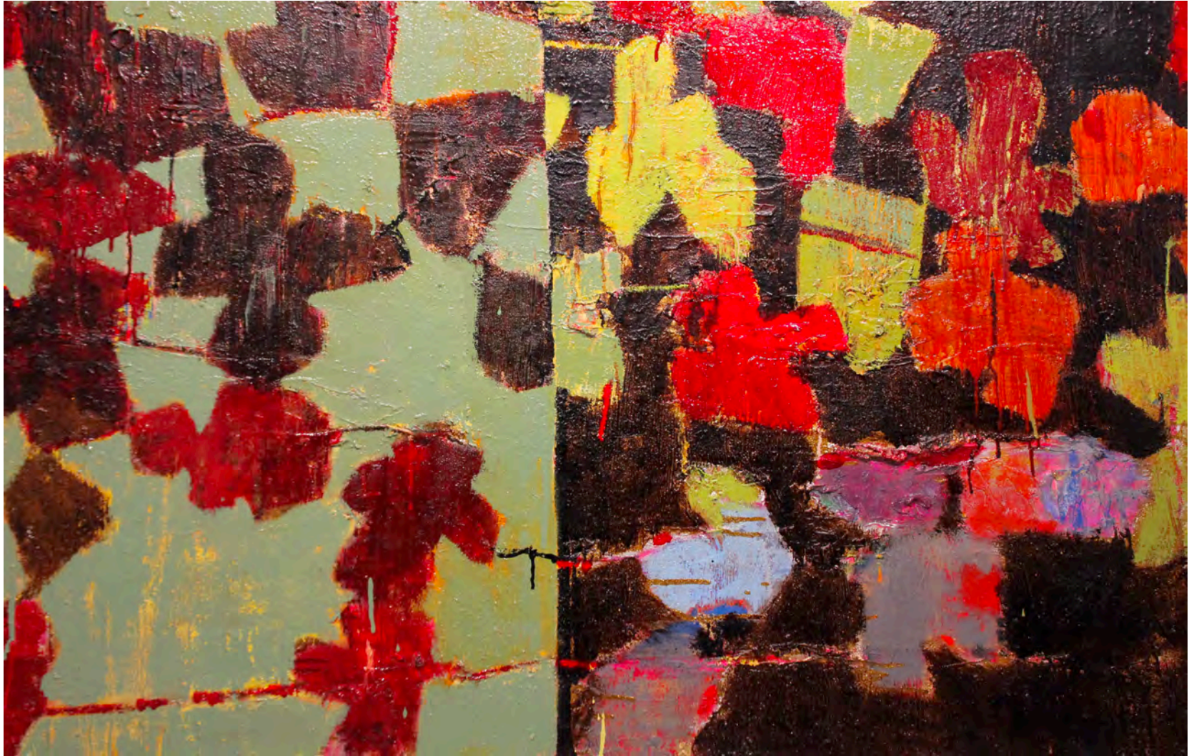
Detail shot of Every Green Day and Every Red Night