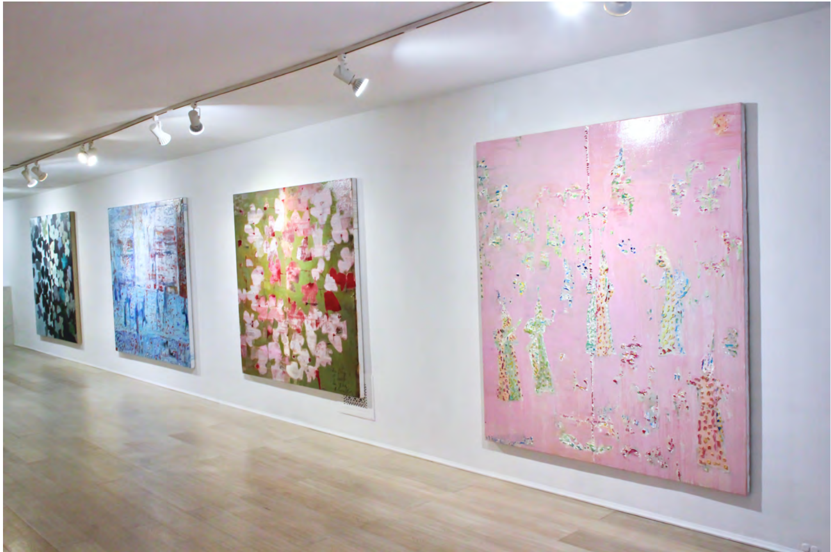
Installation View The Shadow of a Fig Tree Quiets My Soul