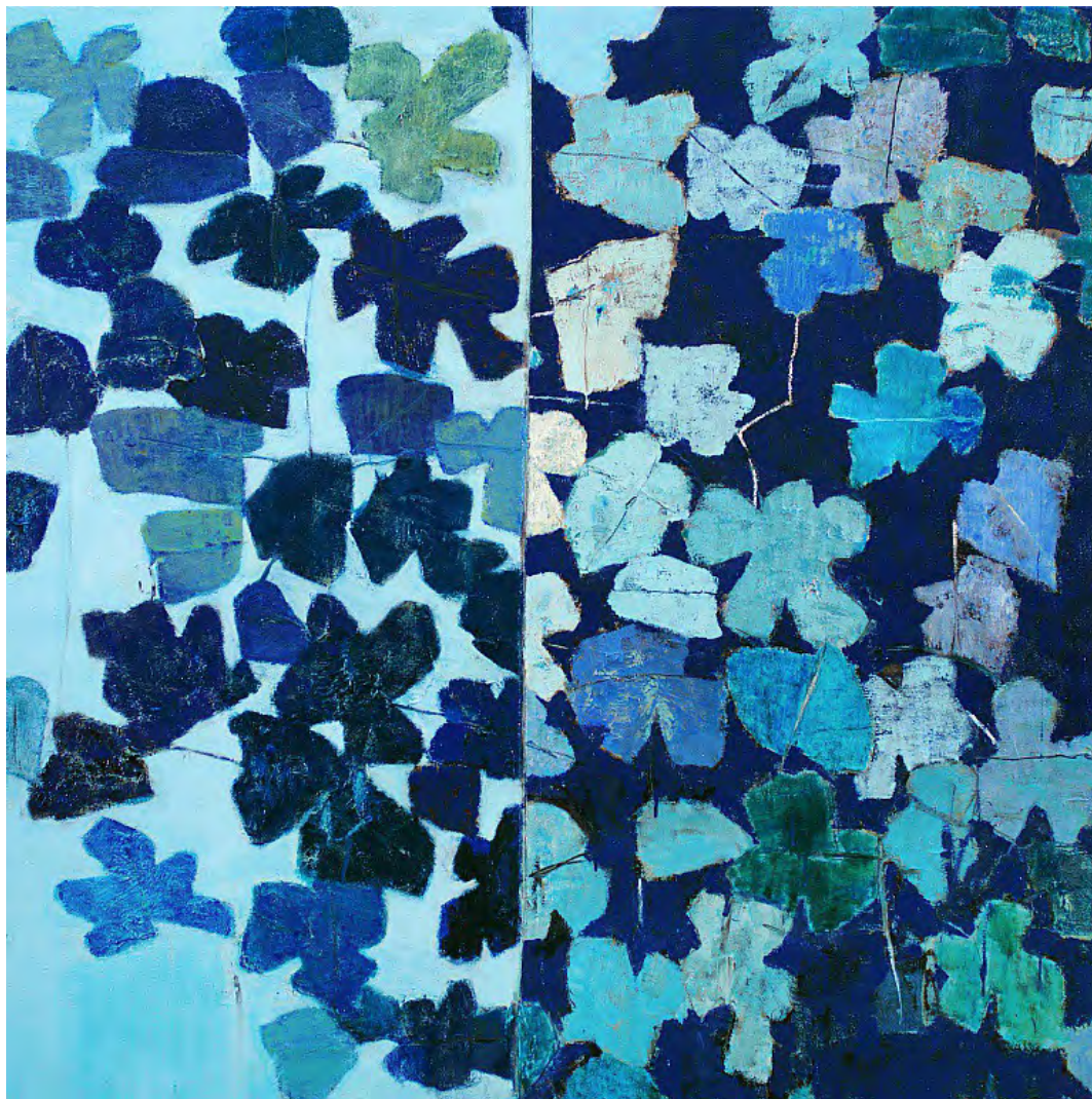
Reza Derakshani Every Blue Day Night , 2010 Oil and Tar on Canvas 70.08h x 70.08w in 178h x 178w cm $ 70,000.00