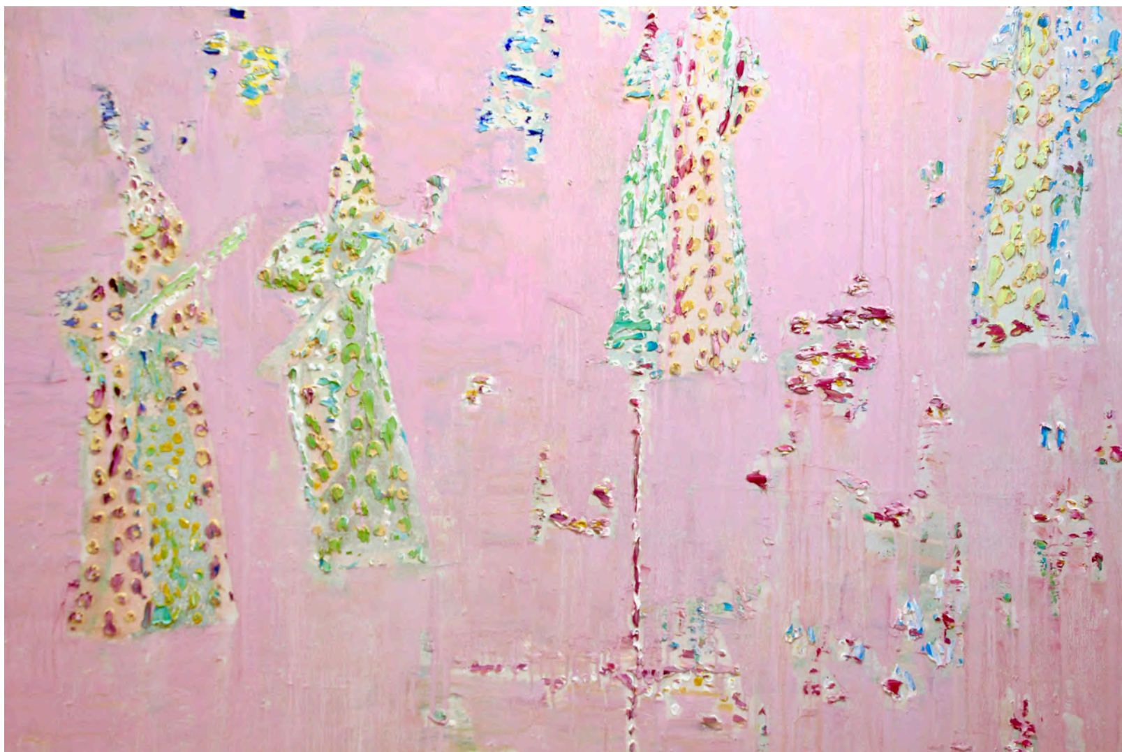
Detail shot of Pink Party