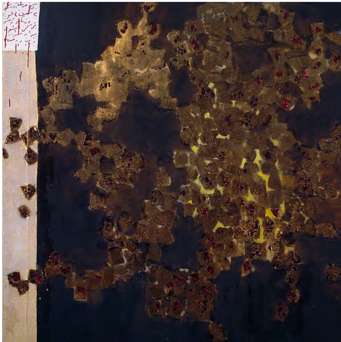
Reza Derakshani They Drink Secretly , 2018 Oil and Gold Paste on Canvas 70.08 x 70.08 in, 178 x 178 cm $ 80,000.00