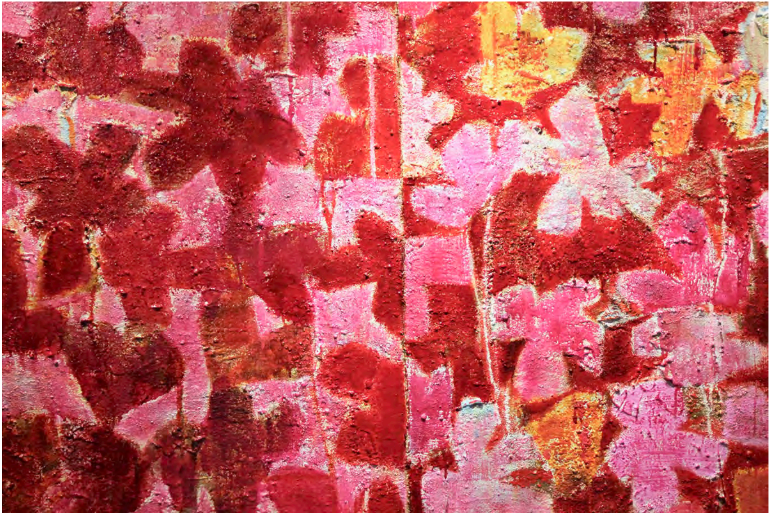
Detail Pink Days and Nites