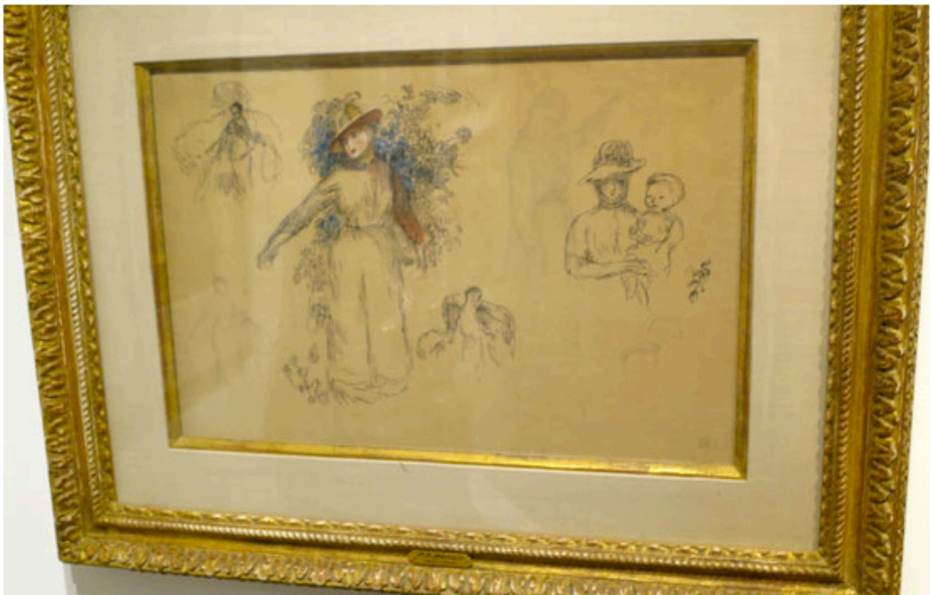
An early Renoir sketch of a portrait of a lady in her garden.

The show runs through August 29th and if you like portraiture, this delivers . I loved it, although I've got to go back and spend some time taking it all in.