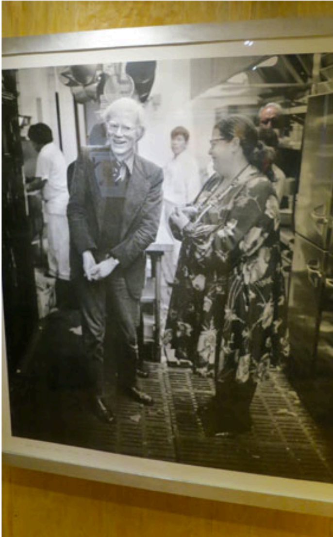
Andy Warhol in the kitchen of Elaine's restaurant with Elaine.