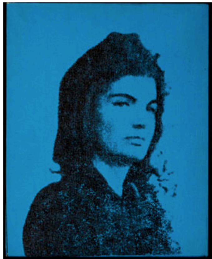
Warhol's Blue Jackie , 1964