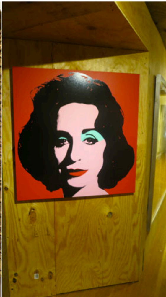
Mary Cassatt and a Warhol Elizabeth Taylor.