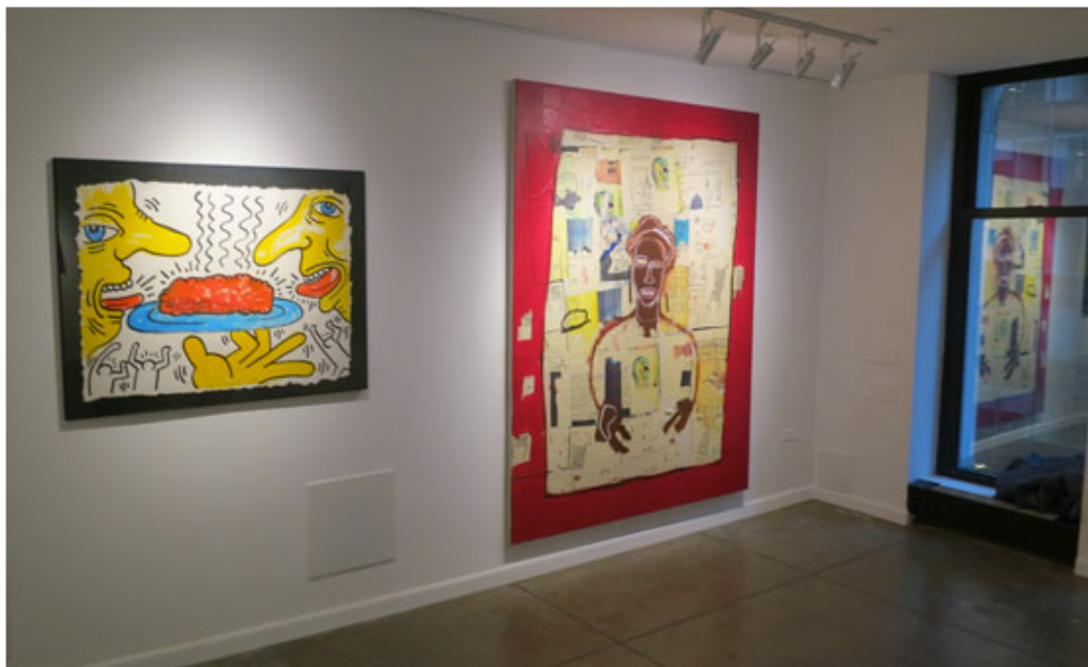
The show runs through August 29th. Don't miss it ...