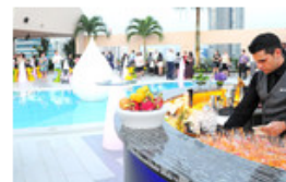
Urban oasis: Four Seasons Hotel S'pore's new rooftop pool venue »