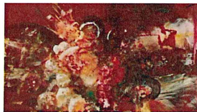
VIEW SLIDESHOW Ran Hwang: Two Love Tree , 2012, buttons, beads and pins on wooden panel, 47 by 70 inches.; Catherine Howe: Proserpina (Frenchie) , 2012, oil and beeswax on linen, 40 by 30 inches.;