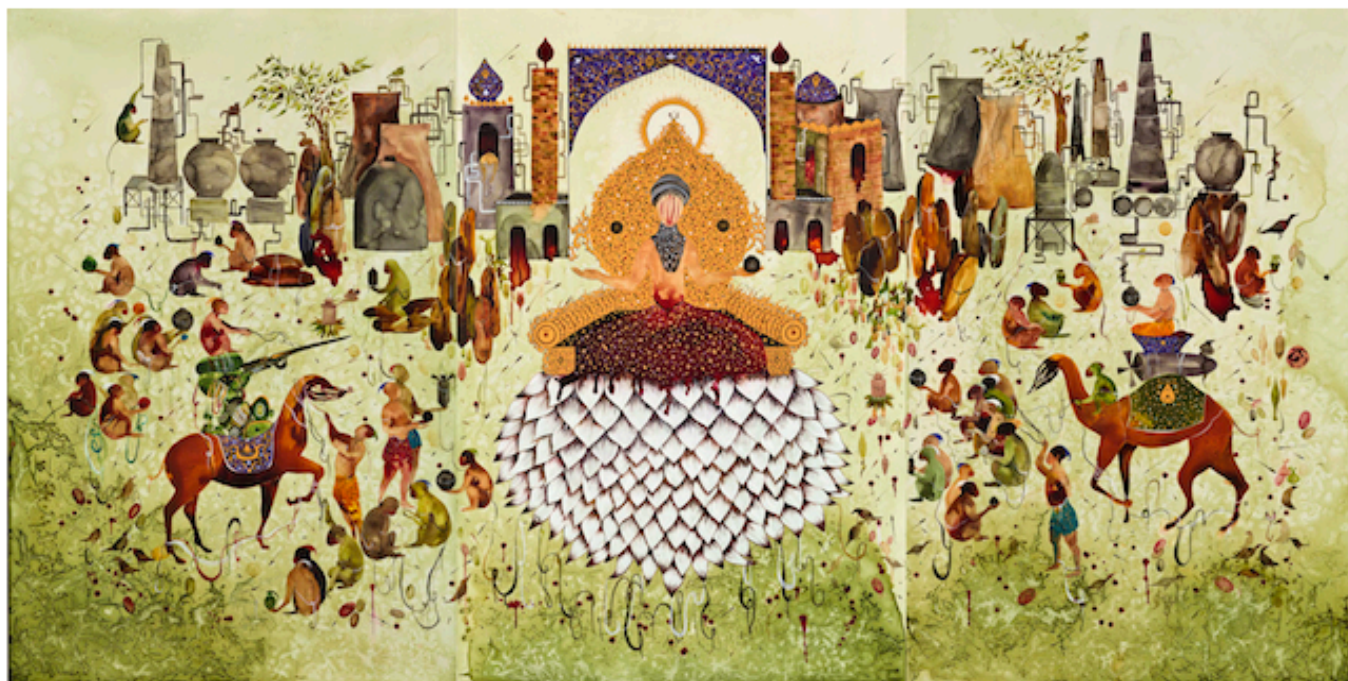
Shiva Ahmadi, "Lotus" (2013), Mixed media on acquaboard. Triptych. Overall dimensions 60 x 120 in.

Both works are as visually striking as they are politically dark, so it's no surprise their creators identify as painters. As Malani's lush images are projected on the wall, they bleed together like watercolors — vibrant extensions of her painting practice. Similarly, watching Lotus feels very much like seeing Ahmadi's original painting come to life; the narrative formerly frozen in time comes to pass before our eyes.